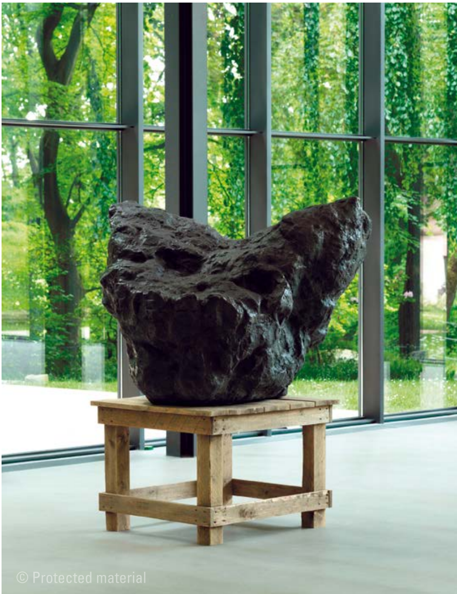
Victory , 2000 Drawing and plaster sculpture William Tucker's studio in Ashfield, Massachusetts