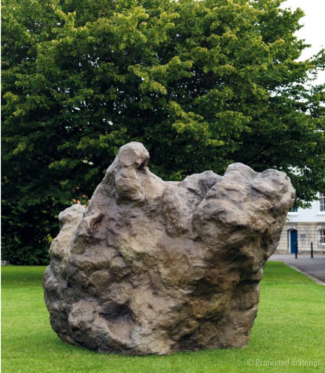
Emperor , 2002