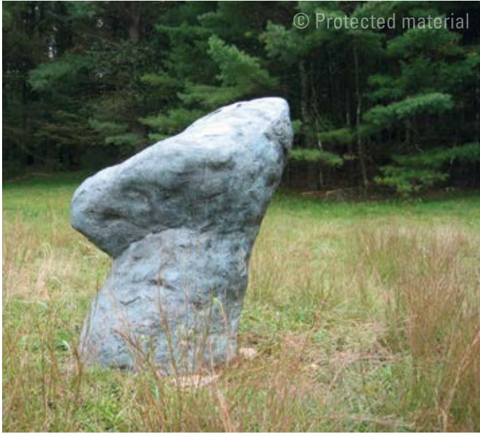
Tethys , 1995 Ward Pound Ridge Reservation, Cross River, New York

As Tucker puts it regarding the word statue , “inherent in the word is the idea of standing. To set a stone upright in a cleared space can be seen as the first sculptural act. Standing implies consciousness. The upright stone acquires a meaning which separates it from other stones before it is shaped into an image, a statue.” 52