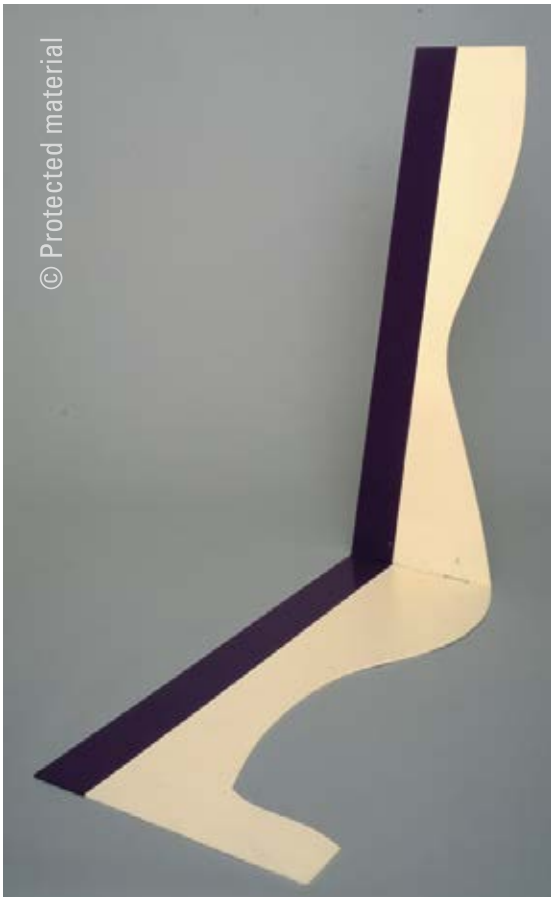
Margin II , 1963 Painted aluminium, 133 x 157.5 x 56 cm Tate, London Inv. no. T01373

of “truth to materials,” Tucker explored the possibilities afforded by new industrial materials, given their highly durable surfaces that allowed them, weighing less, to support greater loads. Fibreglass began to be marketed as a commercial product in 1938, by the American company Owens-Corning. After the Second World War, its use extended throughout the United Kingdom and, beginning in 1956, it was sold in a certain pink colour. Tucker used this kind of fibreglass in his piece titled Memphis (1965), an arrangement of three abstract, curved or kidney-shaped elements. He also worked in aluminium in pieces like Margin II (1963) [fig.], which, like Unfold (1963) [fig.], possesses a certain illusionistic quality, achieved by the simple act of folding a flat, thin sheet of metal and painting in two clearly defined areas of colour. The form can be seen as a whole from numerous angles, like a believably flat drawing; at the same time, it creates the effect of a splitting into mirror images. Tucker thus reveals the type of modelling, a displaying or an un-folding as a re-flection , as a sculptural action .