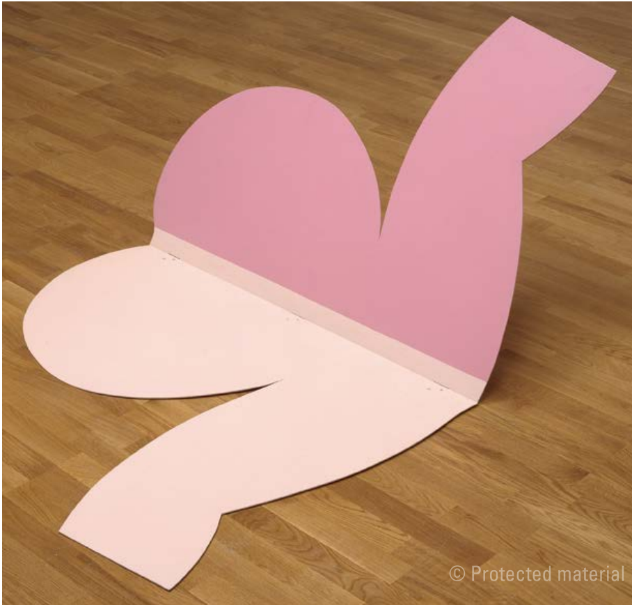
Unfold , 1963 Painted aluminium 71 x 117 x 134 cm Tate, London Inv. no. T01374

/(1964), included in that exhibition, is the progressive mutation of a simple cross shape, stacked in a series of three different volumes, the last of which is a simple, transparent sheet of Plexiglas. Fundamentally, Tucker gives priority to that third, more linear or planar element, to the geometric over the organic; with it, he suggests rather than actually creates volume.