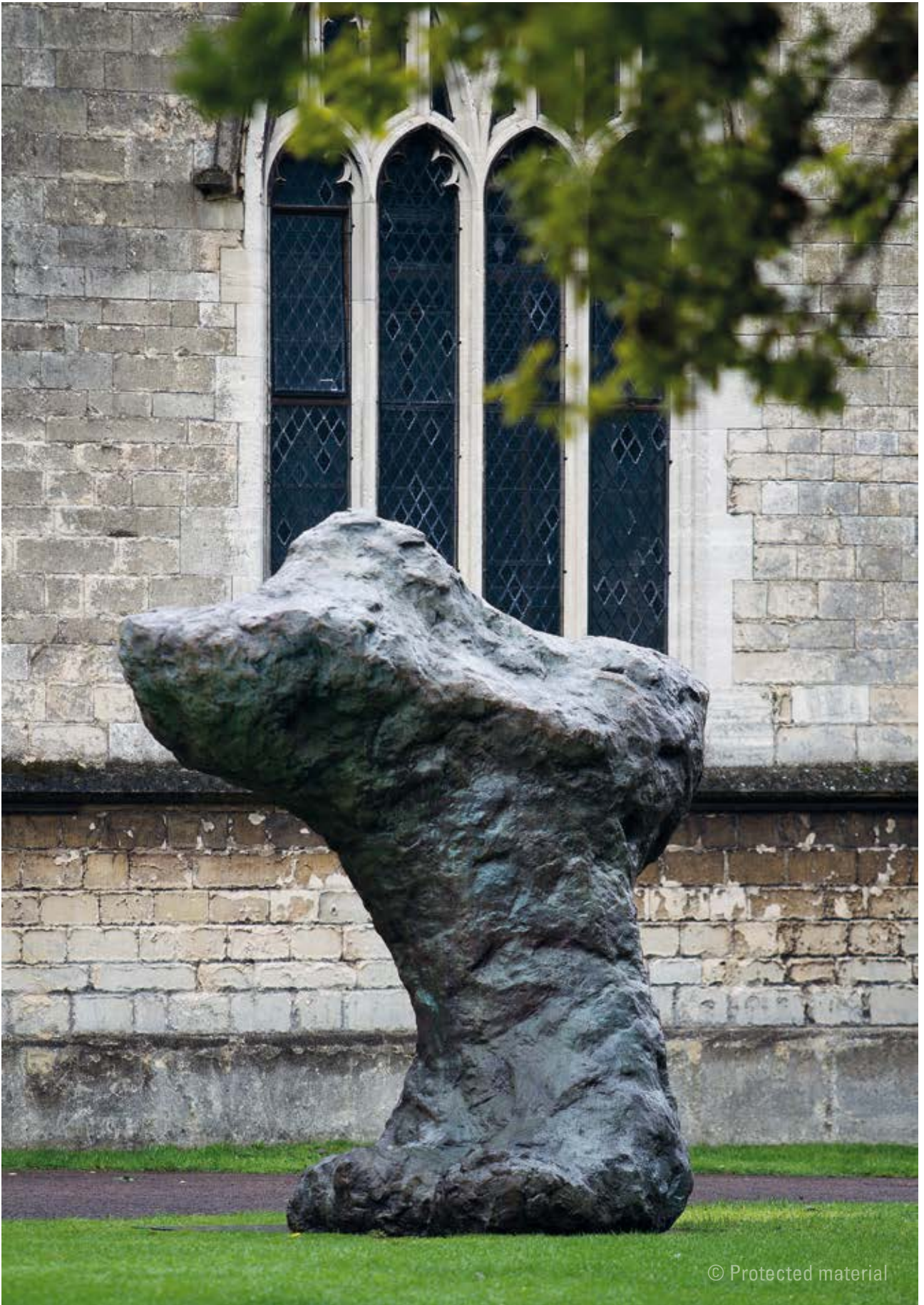
Messenger , 2001