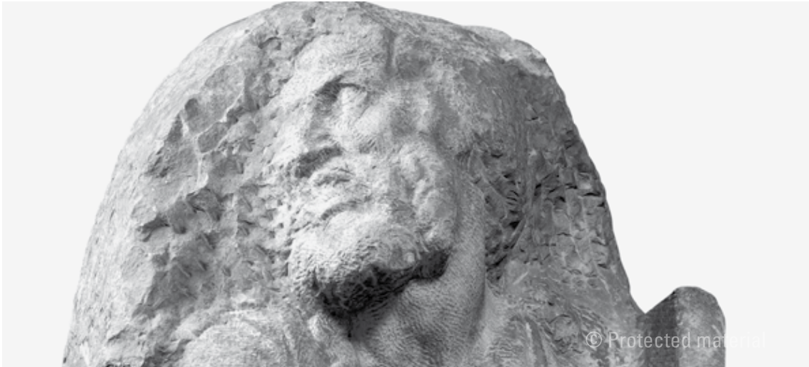
Michelangelo Buonarroti St. Matthew , 1505 Marble, 2.6 m (height) Galleria dell'Accademia, Florence Detail

Let us consider the upper portion, the head, of Michelangelo's St. Matthew [fig.]. The artist was around thirty years old and was in the process of sculpting two round bas-reliefs, the Pitti Tondo and the Taddei Tondo, as well as four statues of saints for the Cathedral of Siena. On 24 April 1503, the Arte della Lana, or wool guild, in Florence commissioned twelve statues representing the apostles, measuring four and a half braccia (270 cm), to adorn the interior of the cathedral of Santa Maria del Fiore. He only produced this marble block, which helps us understand the meaning of non-finito , to study the great sculptor's original conception.