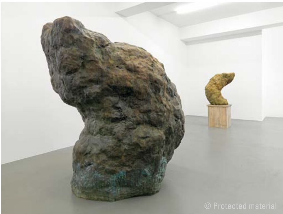
William Tucker exhibition at the Buchmann Galerie, 2013 On the left, Vishnu (1995); on the right, Prow (2010)