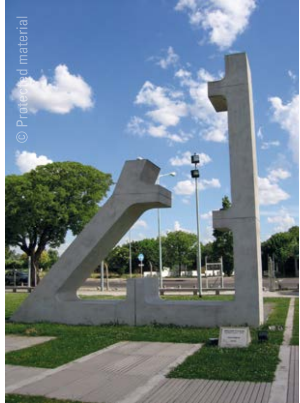
Victory , 1998-2001 Parque de la Memoria, Buenos Aires

Guardian marks a turning point in Tucker's practice, both in terms of technique and in his choice of subject. The pieces, with their title and their verticality, advance like sentinels in a new period of the sculptor's output.