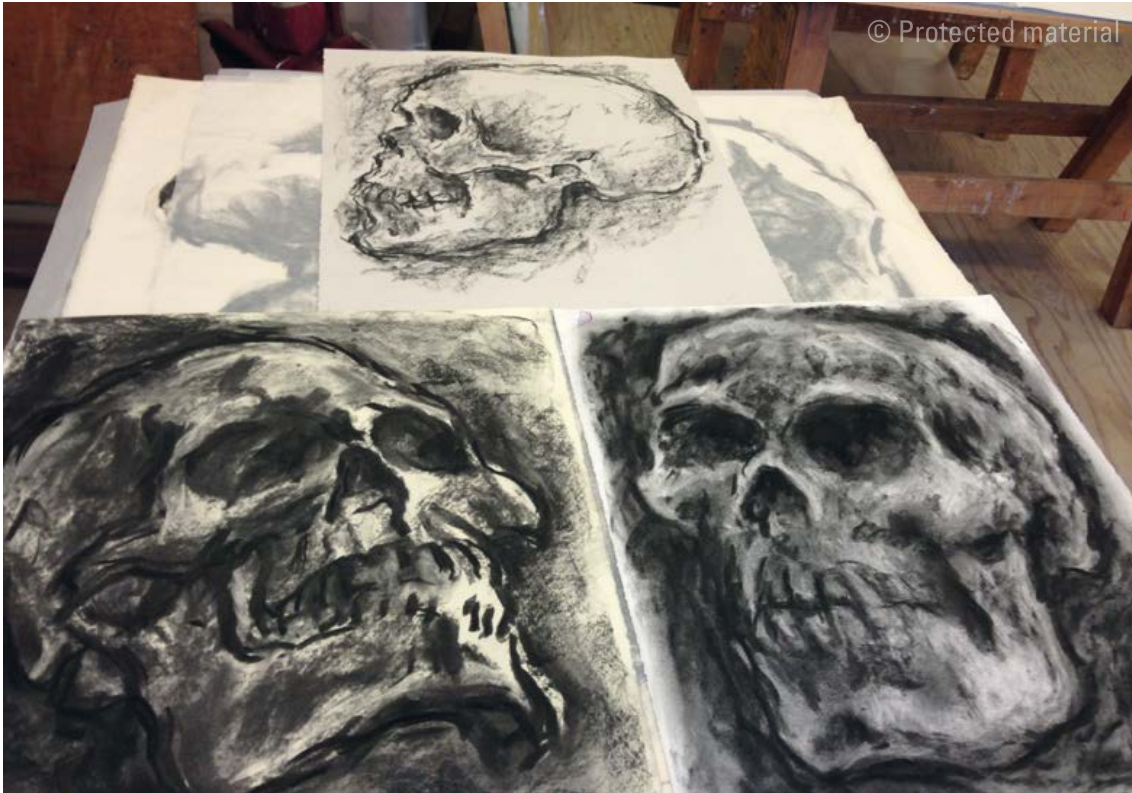
Selection of drawings of Victory (2000) in William Tucker's studio, Ashfield, Massachusetts, November 2008

devoted to Rodin in 2000 and after visiting an exhibition of the Riace bronzes (ancient Greek sculptures of warriors), as a souvenir or as documents of a certain way of seeing. They are drawings in notebooks, executed with the notebook lying on a horizontal surface or held in his own hand. I have chosen, in contrast, fifty examples of the other type of drawings, experiments in which the artist works standing before a sheet of paper hanging on the wall.