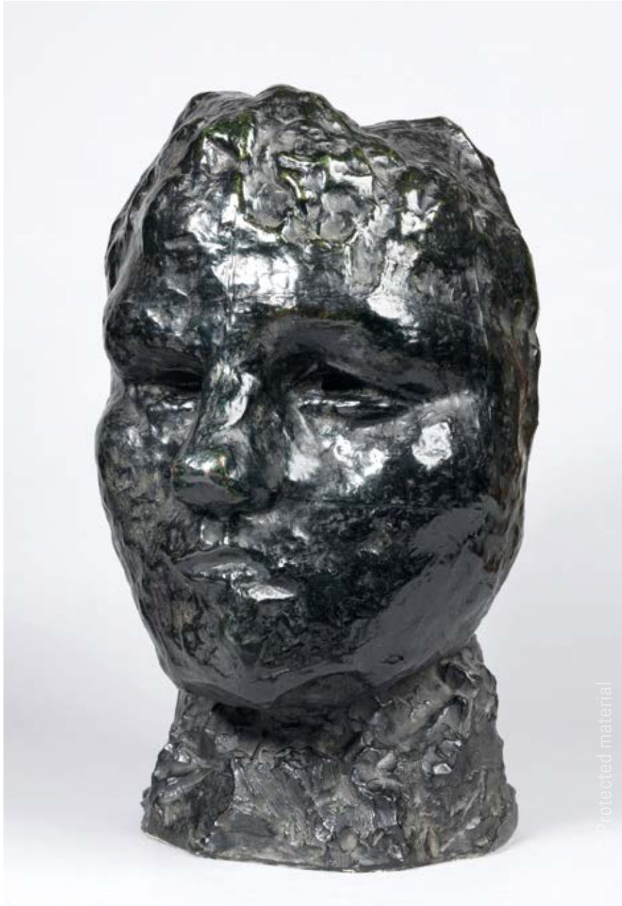
Auguste Rodin Head of Iris , ca. 1905 Bronze, 58.4 cm (height) Victoria and Albert Museum, London Inv. no. A.41-1914