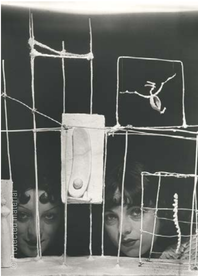
Alberto Giacometti The Palace at 4 a.m. , 1932–33 Wood, glass, wire, and string. 63.5 x 71.8 x 40 cm Museum of Modern Art, New York Inv. no. 90.1936