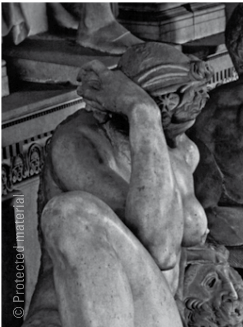
Michelangelo Buonarroti Tomb of Giuliano de' Medici: Allegory of Night , 1520-33 Medici Chapel, Basilica of San Lorenzo, Florence Detail