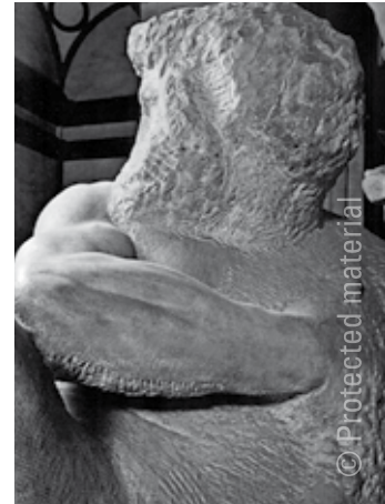
Michelangelo Buonarroti Tomb of Giuliano de' Medici: Allegory of Day , 1520-33 Medici Chapel, Basilica of San Lorenzo, Florence Details