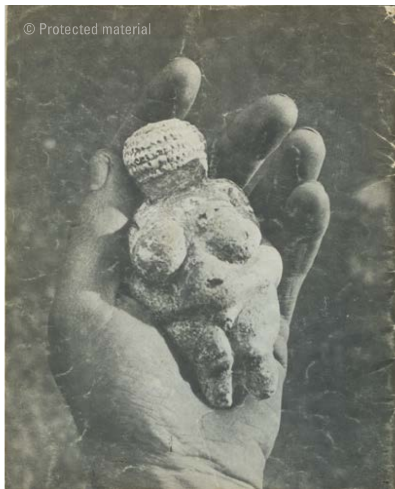
Front and back covers of the journal First , no. 2 (1961)