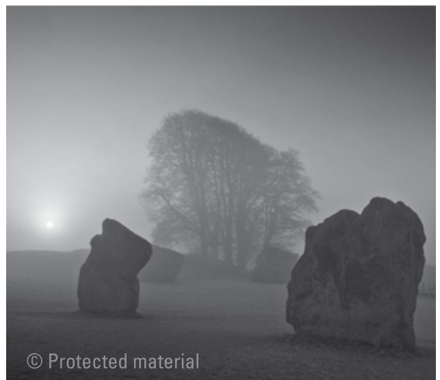
Henge monument of Avebury, Wiltshire, United Kingdom