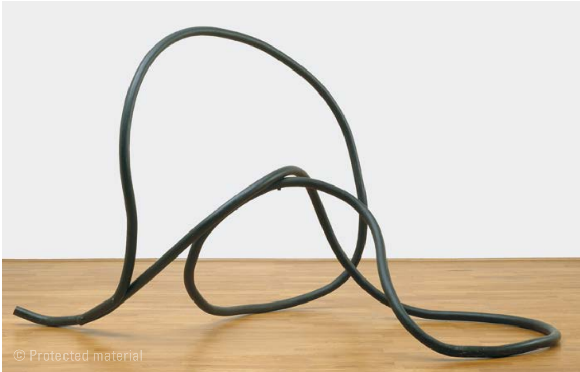
Beulah I , 1971 Painted iron 151 x 266 x 150 cm Tate, London Inv. no. T01818

little mass and whose title suggests a physical, participatory game. Viewers are made aware of their own perceptual effort to understand the form and structure of these works.