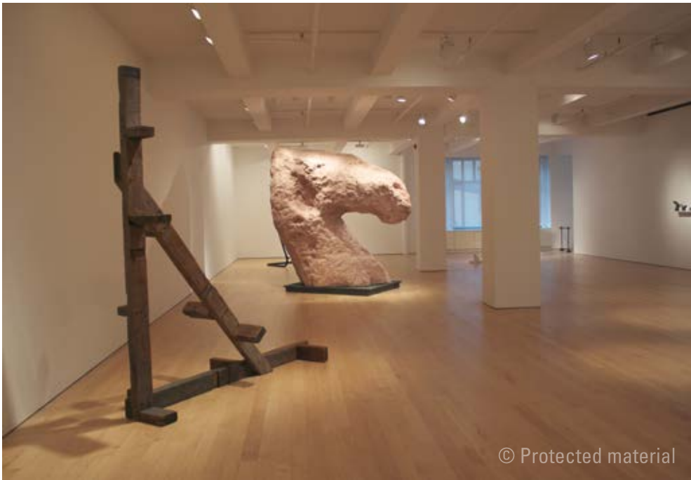
William Tucker exhibition at the McKee Gallery, New York, 2012 On the left, The Contract (1978); in the centre, Day (2012)