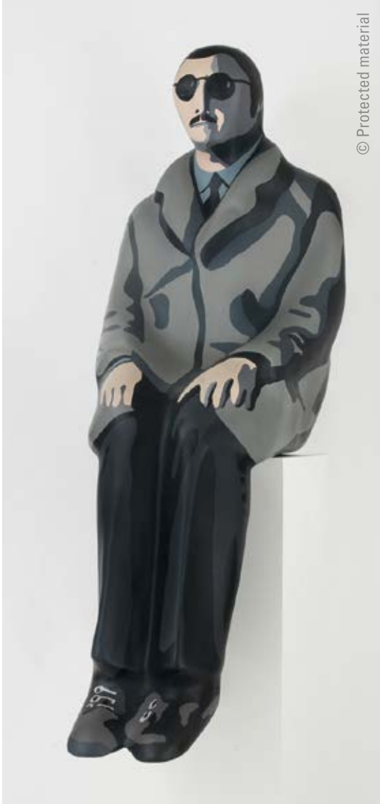
15. Equipo Crónica Spectator of Spectators , 1972 Multiple made for The Pamplona Encounters , 1972 Paint on papier mâché 127 x 49 x 82.5 cm Bilbao Fine Arts Museum Inv. no. 90/47

doubts. Finally, Equipo decided to take part but with a work that expressed the political problems involved in the organisation of the event.