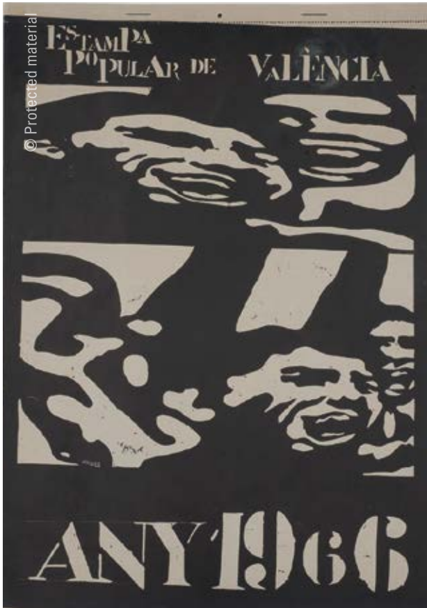
3. Estampa Popular de Valencia Calendar for 1966 (front) , 1965 Offset on paper 44 x 30.8 cm Private collection