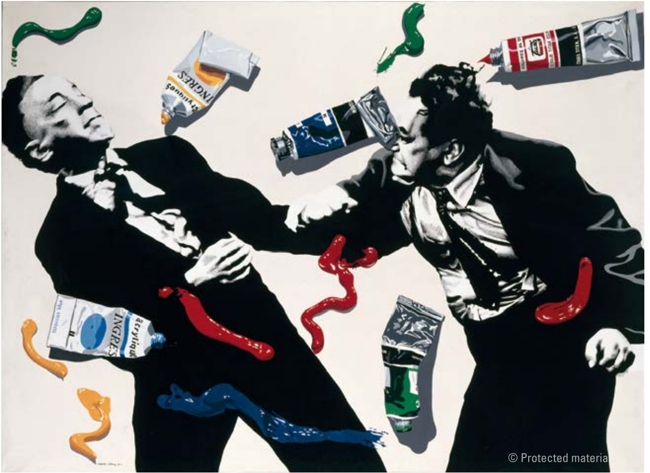
11. Equipo Crónica Painting is Like Hitting , 1972 Black Series Acrylic on canvas 150 x 200 cm Museo Nacional Centro de Arte Reina Sofía, Madrid Inv. no. AD00376