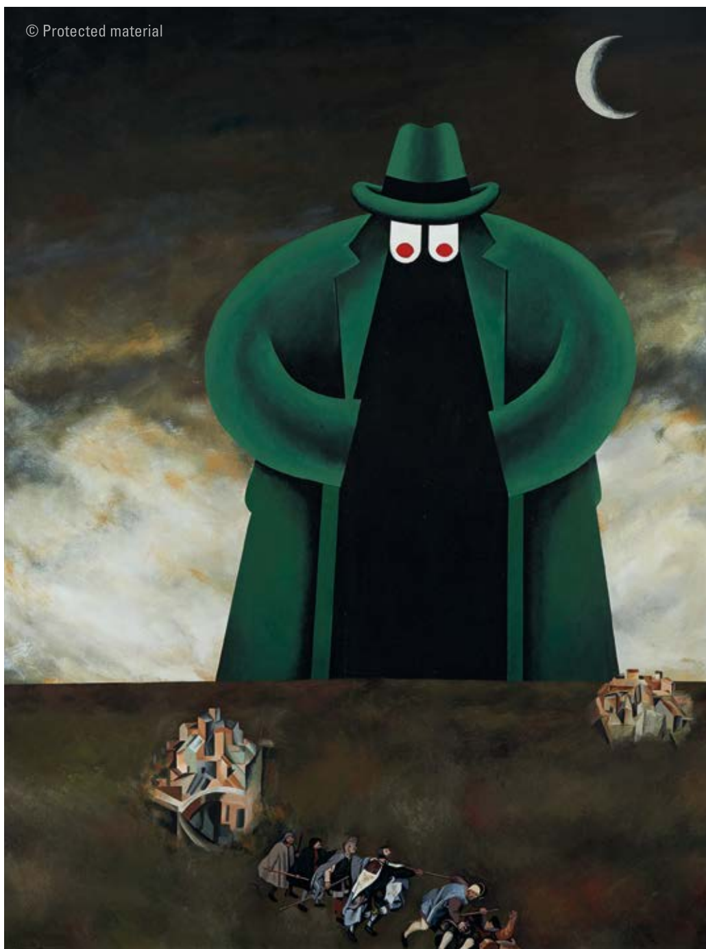
19. Equipo Crónica The Colossus of Fear , 1977 A Sort of Parable series Acrylic on canvas 200 x 150 cm Senate Art & Historical Collection Inv. no. 164