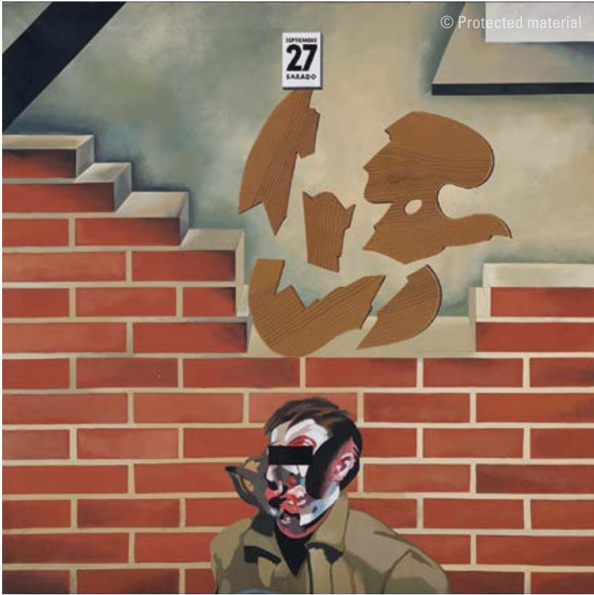
17. Equipo Crónica Execution Wall III , 1975 Execution Wall series Acrylic on canvas 150 x 150 cm Private collection

although perhaps not the most successful. The effort made in its execution is too apparent, giving it a certain rigidity that limits the results to which Equipo aspired.