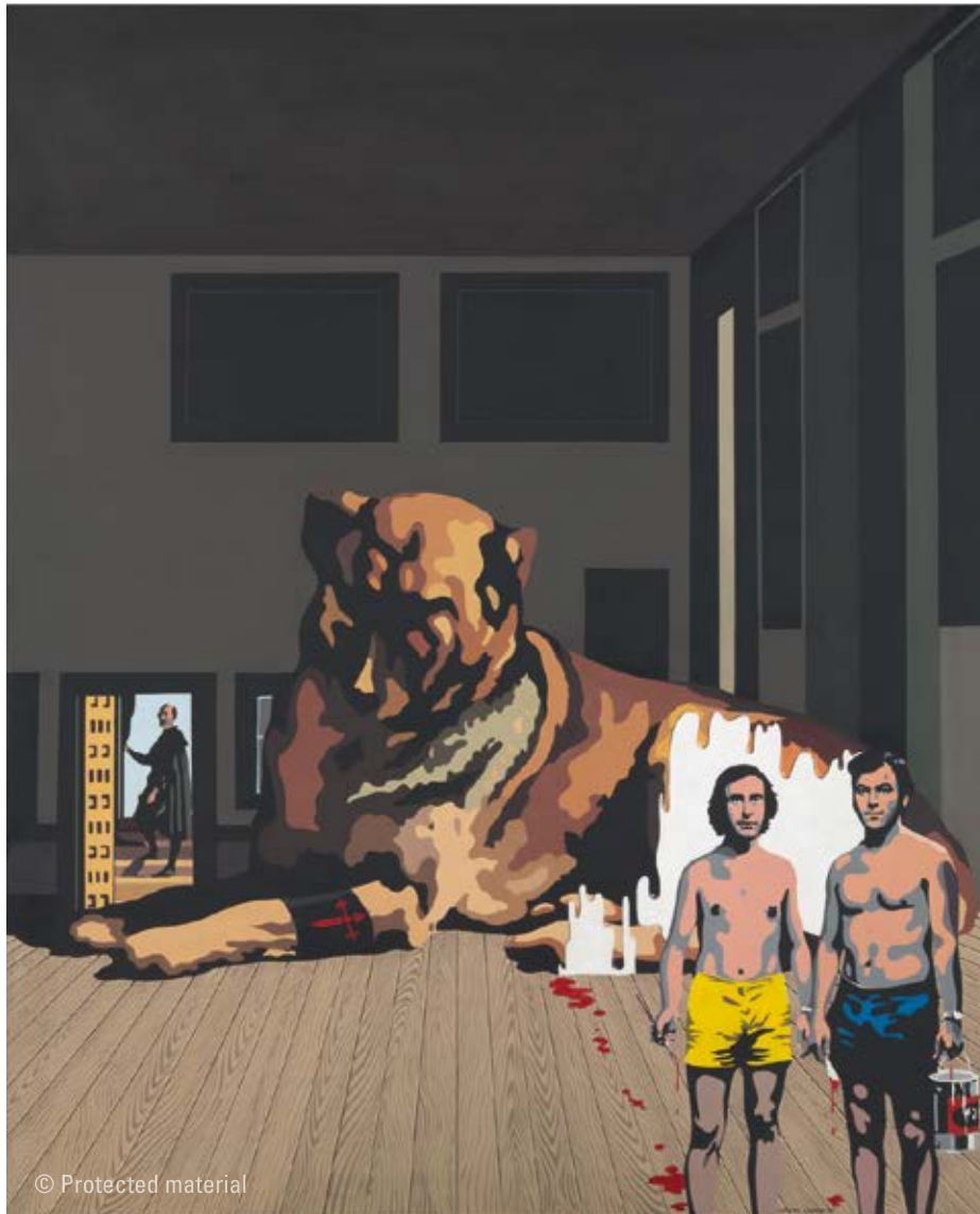
9. Equipo Crónica Self-Portrait at Palace or The Dog , 1970 Autopsy on a Profession series Acrylic on canvas 122 x 100 cm Colección Arte Siglo XX. MACA, Museo de Arte Contemporáneo de Alicante Inv. no. XX.044