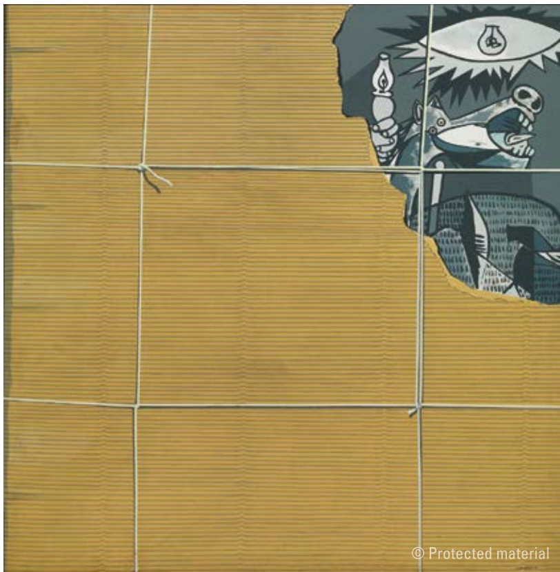
8. Equipo Crónica Packaging , 1969 Guernica 69 series Acrylic on canvas 120 x 120 cm Colección de arte contemporáneo Fundación "la Caixa" Inv. no. ACF0147