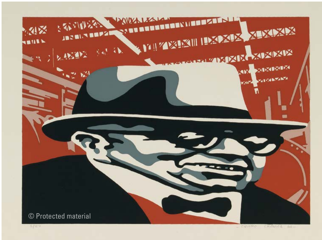
5. Equipo Crónica The Industrialist , 1966 Screenprint on paper Edition 6/50 39.5 x 54.9 cm (paper); 23,7 x 32,9 cm (shaded area) Private collection

as metaphor, metonymy and narrative sense. Works such as Folklore (1965) [fig. 4], K.O. (1966) or Vietnam (1966) illustrate the effectiveness of certain metonymic procedures. Others, such as America, America! (1965) or The Metamorphosis of the Pilot (1966) deploy the illuminating power of metaphor. The narrative sense is clearly present, as we see in Gathering (1966).