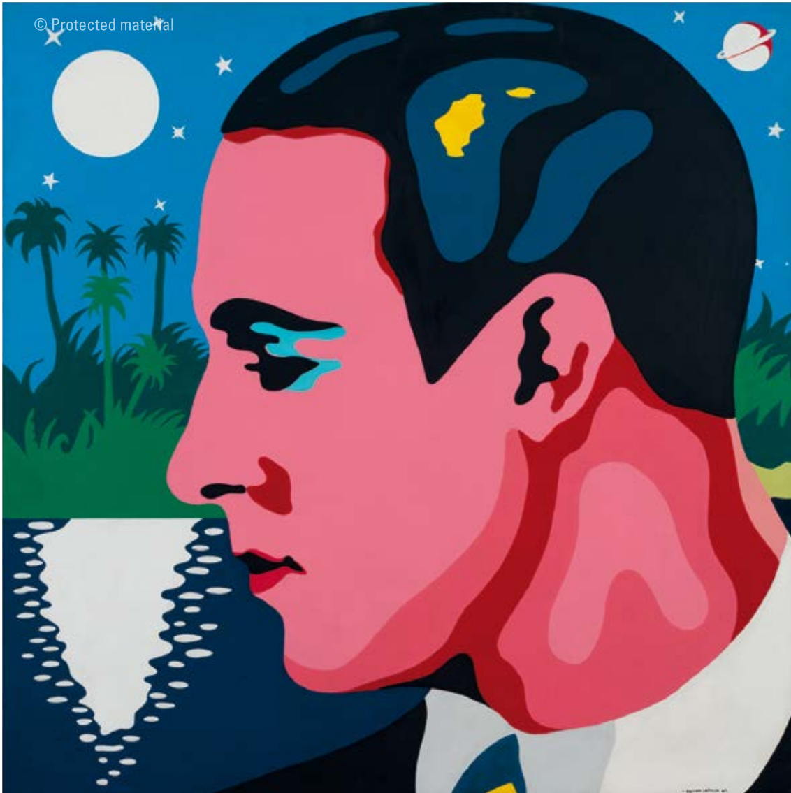
6. Equipo Crónica Latin lover , 1967 Acrylic on canvas 120 x 120 cm Private collection

example The Ribbon (1966). A portfolio of four silkscreens also published in 1966 also reveals this evolution. While the first of them, Medals , still offers a characteristic example of the contrasting repetition of images, the other three each represent a single theme.