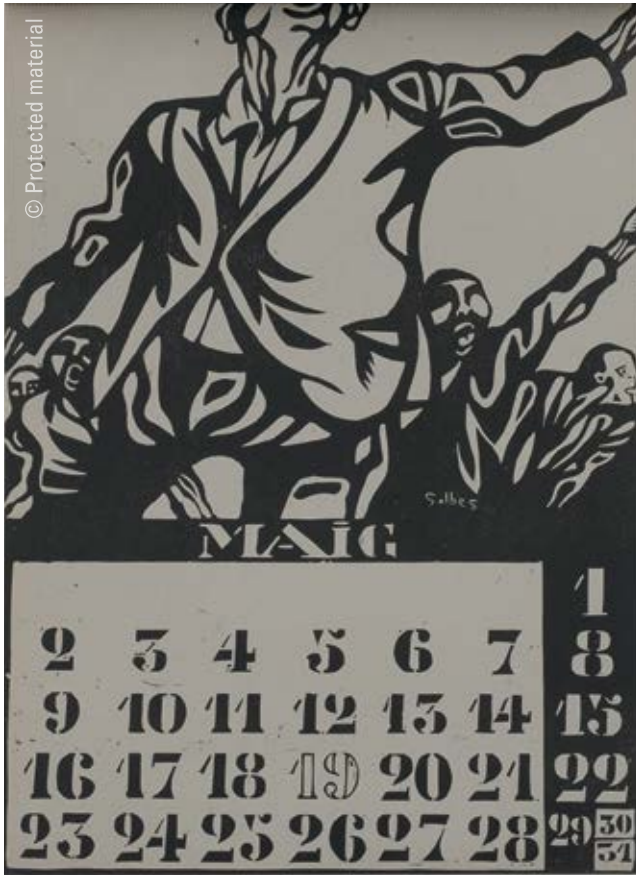
1. Estampa Popular de Valencia Calendar for 1966 (May) , 1965 Offset on paper 44 x 30.8 cm Private collection