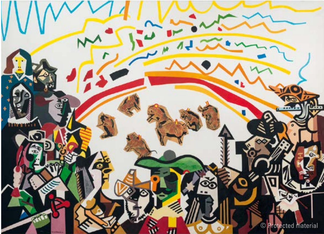
21. Equipo Crónica The Iberian Arena , 1981 Chronicle of the Transition series Oil and collage on canvas 170 x 240 cm Private collection

sequence of explanatory commentaries for publication in the catalogue of the retrospective that finally did not take place. I do not know why it was not published in the catalogue of the exhibition organised by the Ministry for November.