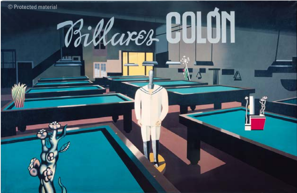
18. Equipo Crónica The Marvellous Forest , 1977 The Game of Billiards series Acrylic on canvas 175 x 275 cm Arango Collection

In the case of billiards, the vehicle of the metaphor was the historic disjuncture, the lack of adaptation to the modern world, a characteristic that billiards shared only shared with painting and not with society in general.