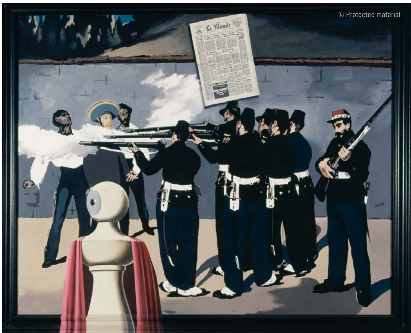
14. Equipo Crónica Eye Witness , 1974 The Executions series Acrylic on canvas 181 x 221 cm Stiftung Museum Kunstpalast, Düsseldorf. Acquisition, 1977 Inv. no. 0.1977.3