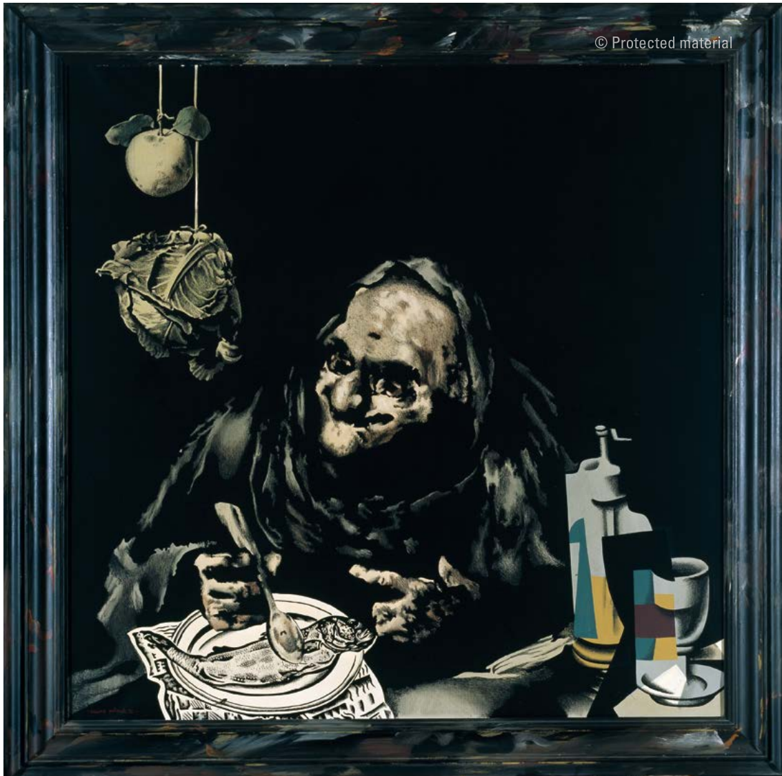
12. Equipo Crónica The Meal , 1972 Portraits, Still Life and Landscapes series Acrylic on canvas and frame 140 x 140 x 6,5 cm Museo Nacional Centro de Arte Reina Sofía, Madrid Inv. no. AD03787