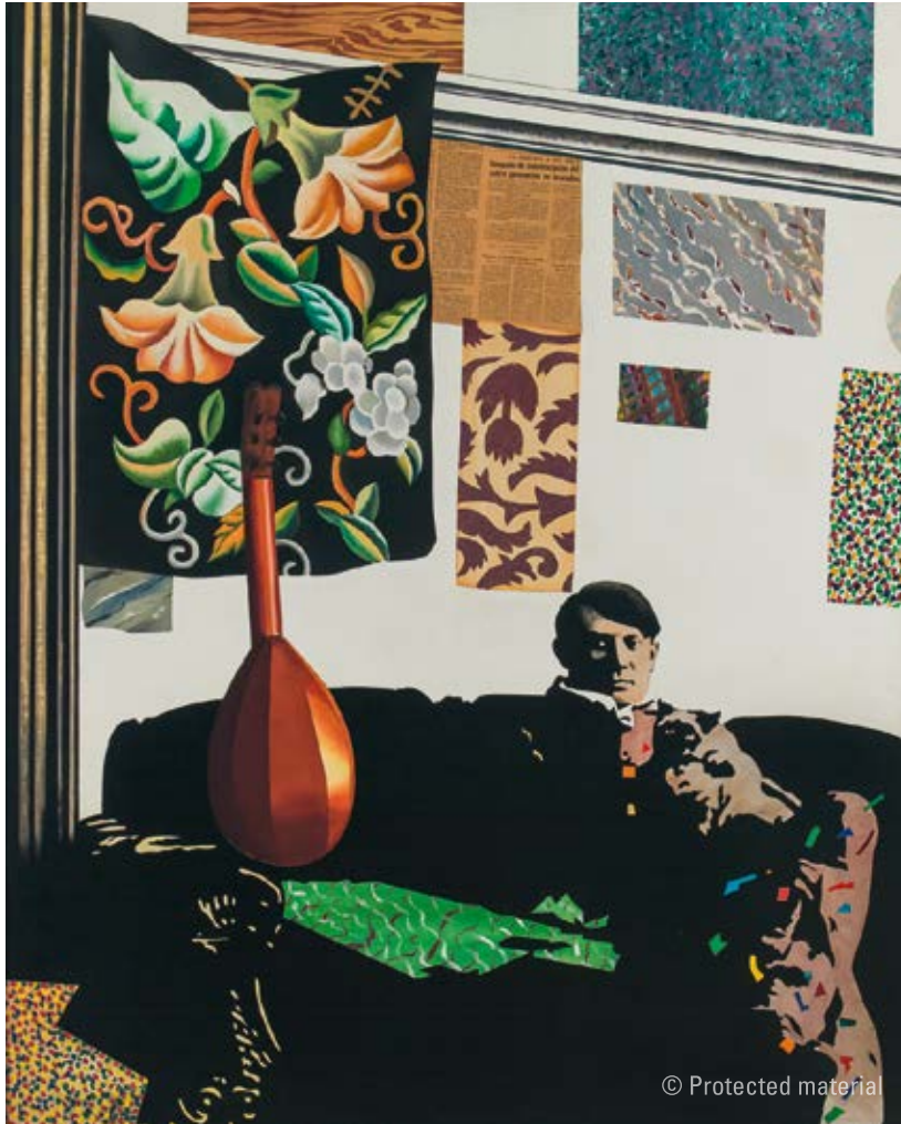
20. Equipo Crónica The Photograph or The Character , 1980 Chronicle of the Transition series Oil, collage and acrylic on canvas, 160 x 130 cm Bilbao Fine Arts Museum Inv. no. 87/31

of the circumstances in which it was produced. Chronicle of the Transition was exhibited at the Maeght gallery in Barcelona in May 1981 in a large exhibition that also included works from the two previous series. The catalogue included texts by Valeriano Bozal, José Francisco Yvars and the author of this text, but none by Equipo itself. This absence would interrupt the sequence of explanatory texts on their series which Equipo had written almost since the start of their activities. The last had been the one on the exhibition at the Maeght gallery in Zurich in October 1979. As a result, in the summer of 1981, the last two series lacked explanatory texts. Nonetheless, at the time when the exhibition opened in Barcelona or shortly afterwards, Javier Tussell, the Director General of Fine Arts, informed Equipo of the Ministry of Culture's desire to organise a major retrospective on its work. When it was decided to hold it in the October of that same year (coinciding with the 100th anniversary of Picasso's birth and the anticipated arrival of Guernica in Spain), it became clear that the project was not possible and it was thus postponed. Instead, the Ministry organised an exhibition in Madrid in November 1981 which included the same works shown at the Maeght exhibition in May that year and repeated the catalogue. The text quoted above was thus written as an update to the