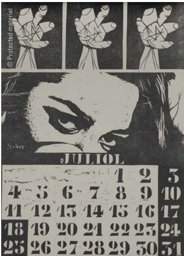
2. Estampa Popular de Valencia Calendar for 1966 (July) , 1965 Offset on paper 44 x 30.8 cm Private collection