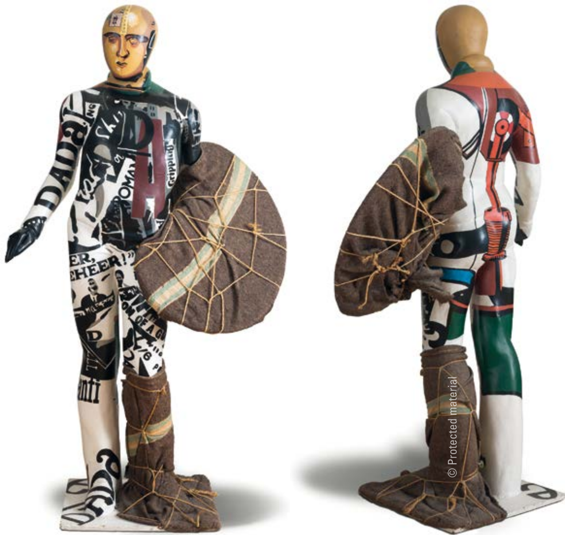
13. Equipo Crónica The Painter , 1973 Craft and Craftsmen series Paint on papier mâché 165 x 95 x 54 cm Private collection

The catalogue of the Rotterdam retrospective included fifteen paintings from this series alongside another thirty-nine from previous series. It also included a multiple, The Painter [fig. 13], of which the entire edition of twenty was included in the exhibition, all painted differently and lined up, rather in the manner of the Xian terracotta warriors. A single one of these has been chosen to represent the series Craft and Craftsmen in the present exhibition. Equipo described this multiple as follows: