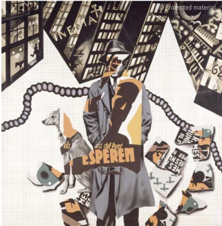
16. Equipo Crónica The Street , 1973 The Poster series Acrylic on canvas 200 x 200 cm Guillermo Caballero de Luján Collection, Valencia

The Poster was Equipo's reply. This is how the team described it in 1981: 21