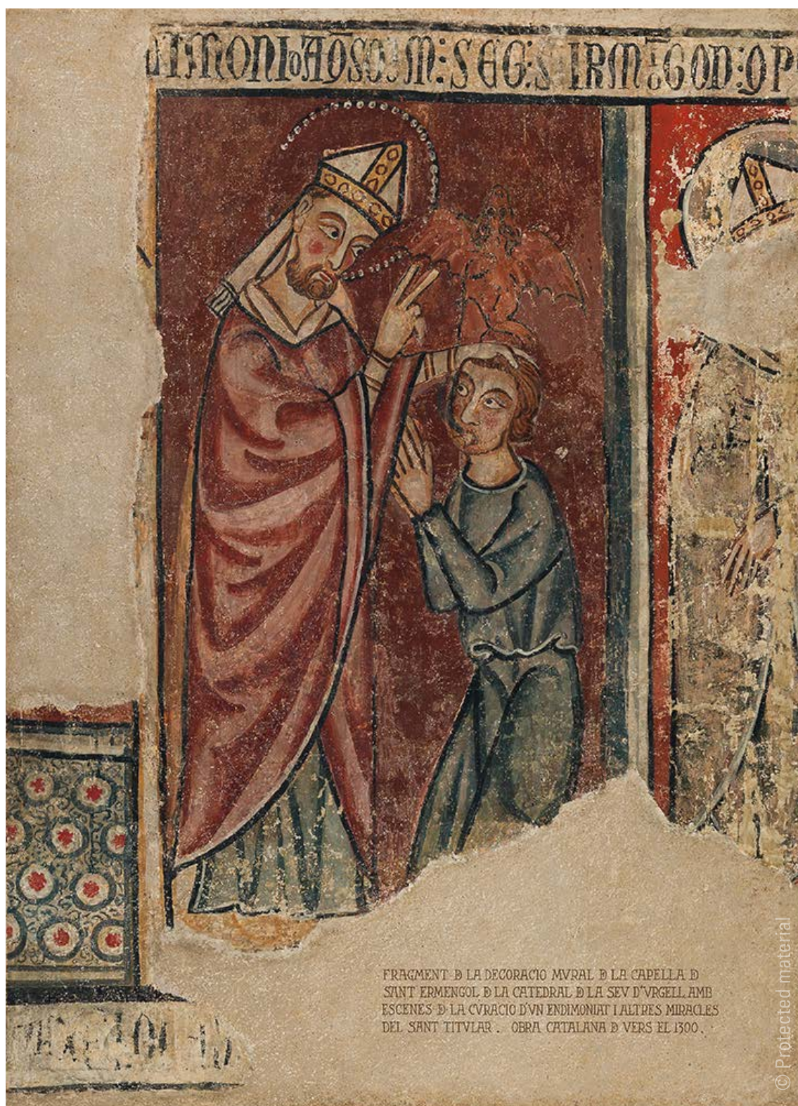
1. Saint Ermengol exorcising a possessed Man , final decades of the 13th century Mural painting in fresco transferred to a movable support. 142 x 102 cm Bilbao Fine Arts Museum Inv. no. 69/254