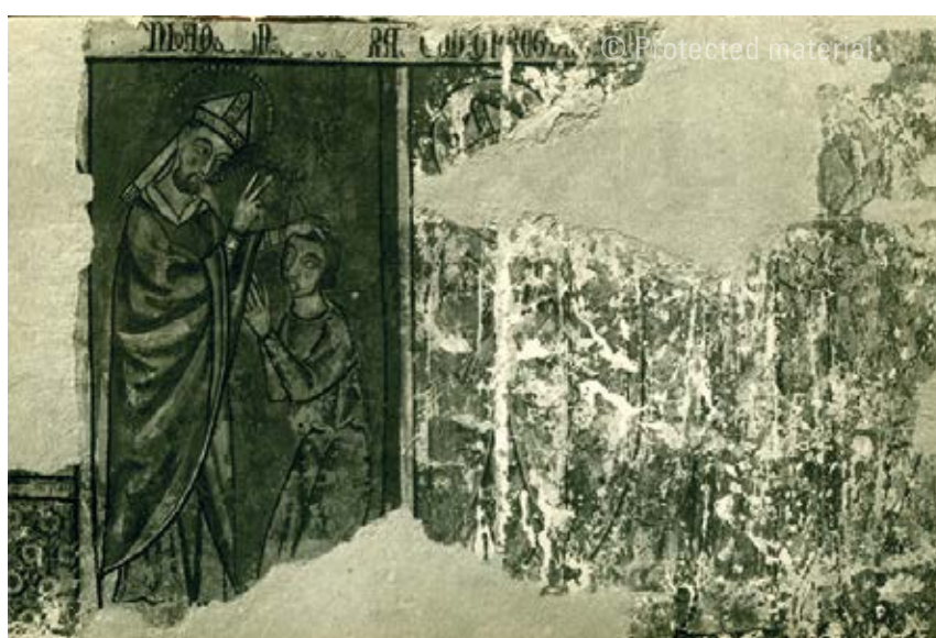
6-7. Saint Ermengol exorcising a possessed Man and an adjoining scene before and after the restoration of the first scene

the fragment in Bilbao after it had been restored by Cividini. 26 In this case the losses to the polychromy have been reintegrated, although the inscription at the top still has the same losses, which must have been painted in during a subsequent restoration. It should be noted that in this photograph the winged demon emerging from the praying man is not as clearly visible as it is now. A third photograph [fig. 8] shows the now lost fragment after its restoration. Particularly notable is the haloed and veiled female figure who is