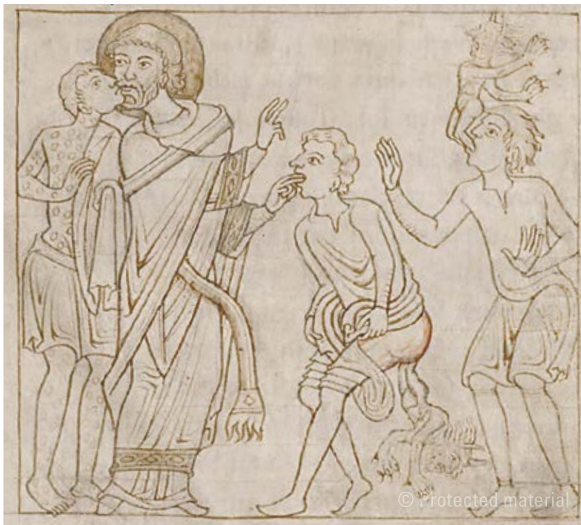
11. Saint Martin healing the sick and possessed , from a manuscript on the life of Saint Martin from the abbey of Moyenmoutier, 12th century Bibliothèque municipale, Épinal, France, ms. 145, fol. 5v

[fig. 9]. 47 Compositionally, they differ little from episodes of healing carried out by bishop-saints, as to be seen in an example from the same period as the present one, namely the stained-glass windows in Angers cathedral [fig. 10], which include several cycles of different saints, most of them bishops, curing figures, including a few possessed by demons. 48