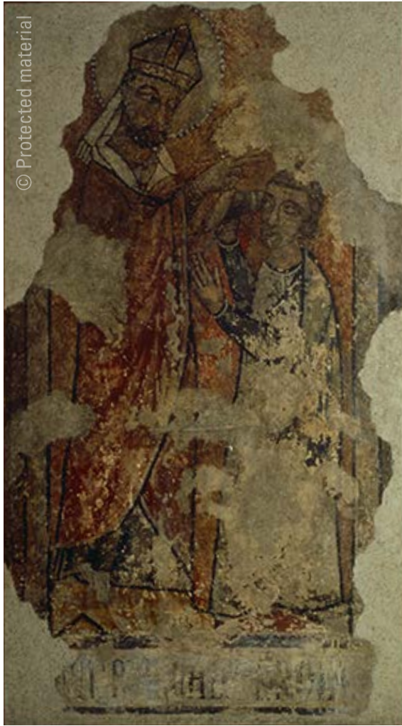
2. Saint Ermengol blessing a Follower , final decades of the 13th century Mural painting in fresco transferred to canvas, 129 x 72 cm Museu Maricel, Sitges, Barcelona. Dr Jesús Pérez Rosales collection Inv. no. 190

It seems clear that this mural painting would have been part of a larger, now lost hagiographic cycle. In this sense it is interesting to note that in the Museo Maricel in Sitges there is a fragment of a composition that is so similar to the one in Bilbao that on some occasions the two have been confused, leading to the assumption that they are one and the same work [fig. 2]. 3 Given the compositional and stylistic similarities and despite the fact that the work in Sitges does not have an inscription indicating its origin, it is quite clear that they are related and were both part of the same cycle from La Seu d'Urgell's cathedral. While the arrangement of the figures is almost the same, the male figure in the Sitges fragment is not expelling a demon.