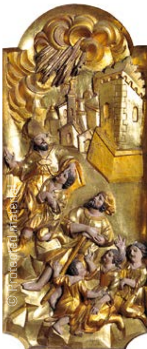
16 . Miracles of Saint Ermengol

Fragment of an altarpiece for the chapel in the north arm of the transept next to the central apse in the cathedral of La Seu d'Urgell, 18th century Museu Diocesà d'Urgell, La Seu d'Urgell, Lleida