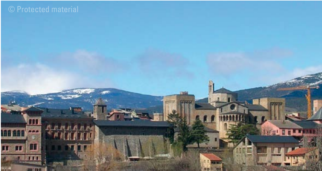
12. La Seu d'Urgell from the eastern side with a view of the apse of the Romanesque cathedral

this architecturally striking work lasted for almost a century. 50 The cathedral was the seat of an already ancient diocese, of which several of its distinguished bishops would subsequently be canonised, including the above-mentioned Ot (1095-1122), son of the Count and Countess of Pallars, and before him Ermengol (1010-1035), who had been involved in the construction of the previous building. 51 There was also an earlier bishop saint, Justus (631-646), whose memory was to some extent eclipsed over time by the popularity of the later bishops, although a chapel at the far south end of the transept under the tower was dedicated to him.