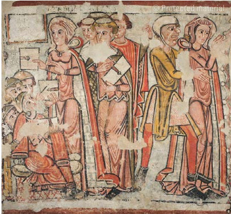
14. Saint Catherine debating and her Arrest , 1241-1255

Mural painting transferred to canvas, 164.5 x 179.5 cm