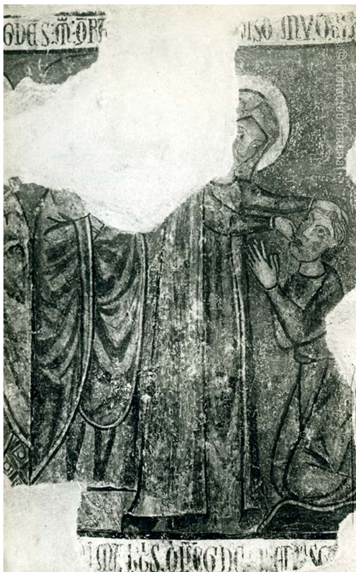
8. Fragment next to Saint Ermengol exorcising a possessed Man after restoration

undertaking some sort of healing, placing her right hand on the mouth of the figure in front of her and her left hand on his head.