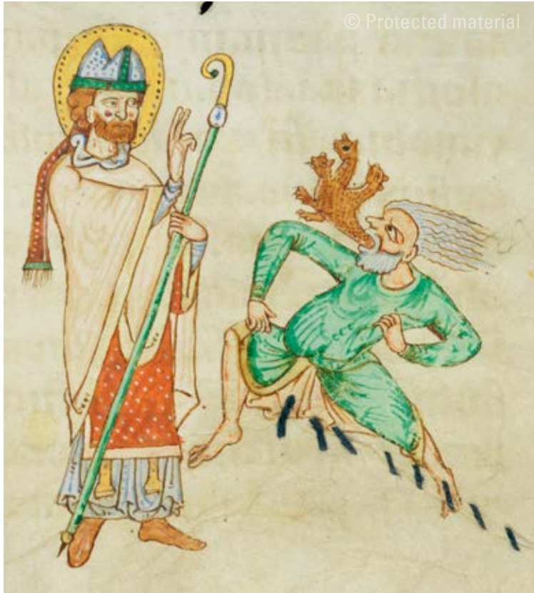
9. Saint Leo IX exorcising a possessed Man , from the Weissenau Passionary , c. 1200 Fondation Martin Bodmer, Cologny, Switzerland, Cod. Bodmer 127, fol. 191 r