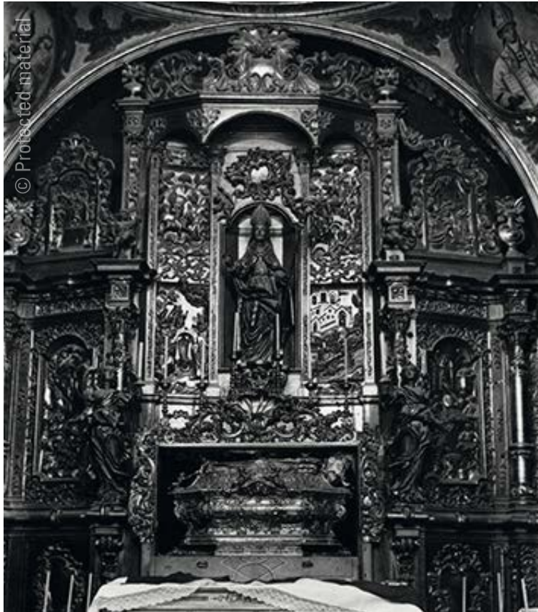
18. Chapel of Saint Ermengol in the cathedral of La Seu d'Urgell, with a Baroque altarpiece and funerary urns Photograph taken before the Spanish Civil War

appears as a figure with the power of healing, an extremely common ability in hagiographic accounts but which can also in a way be associated with the anti-heretical context that characterised the diocese, if only for the fact that until the creation of a specialist tribunal in 1232, it was the bishops who were responsible for inquisitorial matters and who were the principal and habitual figures entrusted with defending orthodoxy. Thus, while they are a traditional device, the lengthy inscriptions that accompany this and other scenes acquire particular meaning at a time when preaching as a weapon against heresy, particularly as deployed by the Dominicans, was exceptionally important and widespread.