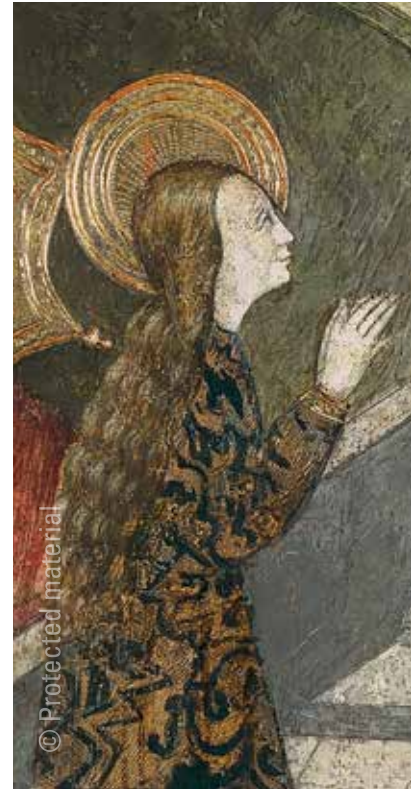
20. Master of Cervera de la Cañada (active in second half of 15th century) Presentation of the Virgin in the Temple Bilbao Fine Arts Museum The Virgin (detail)

en strip decorating God the Father's cloak, with motifs in plaster relief simulating pearls or precious stones, is similar to the border of the Archangel Gabriel's cape in the Annunciation.