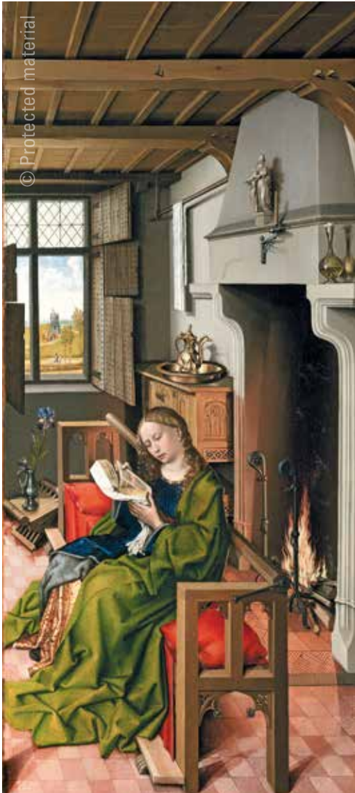
9. Robert Campin (c. 1375-1444) Saint Barbara , lateral panel of the Werl Triptych , 1438 Oil on panel, 101 x 47 cm Museo Nacional del Prado, Madrid Inv. no. P01514

The elements hanging on the wall to the right of Mary also evoke Flemish models. In a niche opened in the wall, held in place by an iron chain, is what looks to be a copper pot or pan, judging by the yellowy metal sheen. Next to the niche is a white cloth decorated with blue lines. Both objects feature in a similar arrangement in the Mérode Altarpiece . We know the pot alludes to Mary as a pure repository within which Christ became flesh. In the panel devoted to Saint Barbara the white cloth, hanging from the ceiling, is repeated, although the copper pot has been replaced by a metal ewer. The receptacle containing the lilies in the Cervera Annunciation is also metal.