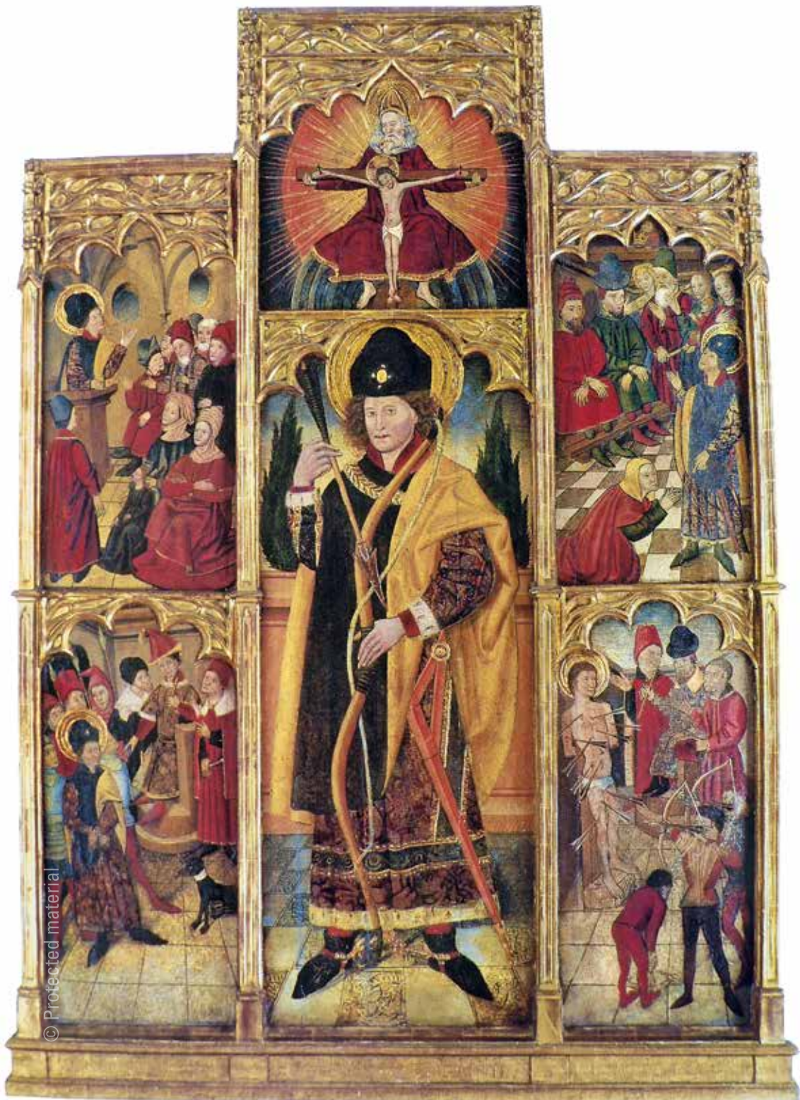
11. Master of Cervera de la Cañada (active in second half of 15th century) Retable of Saint Sebastian Tempera on panel, 160 x 115 cm Private collection