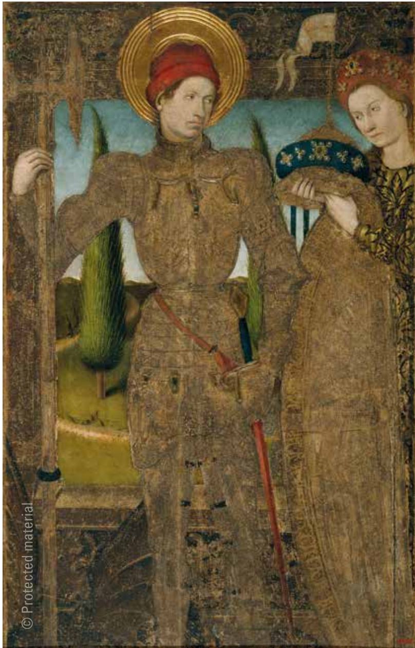
3. Master of Saint George and the Princess (active around the third quarter of 15th century) Saint George and the Princess Tempera, stucco reliefs, gold leaf and remains of foil on panel, 90 x 58.5 cm MNAC-Museu Nacional d'Art de Catalunya, Barcelona Inv. no. 015868-000