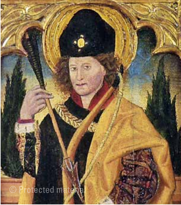
12. Master of Cervera de la Cañada (active in second half of 15th century) Retable of Saint Sebastian Private collection Detail