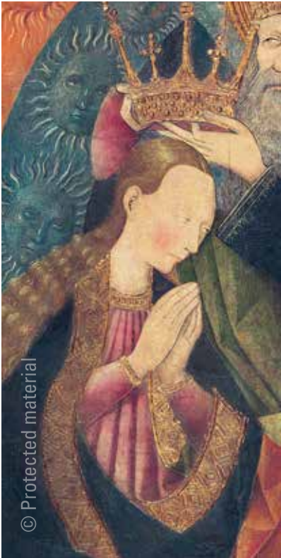
18. Master of Cervera de la Cañada (active in second half of 15th century) Coronation of the Virgin MNAC-Museu Nacional d'Art de Catalunya, Barcelona The Virgin (detail)