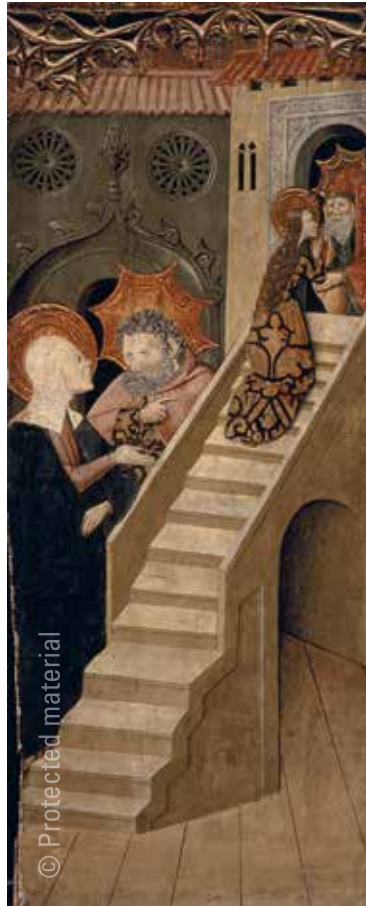
14. Master of Cervera de la Cañada (active in second half of 15th century) Coronation of the Virgin Tempera on panel, 129 x 69 cm MNAC-Museu Nacional d'Art de Catalunya, Barcelona Inv. no. 15852