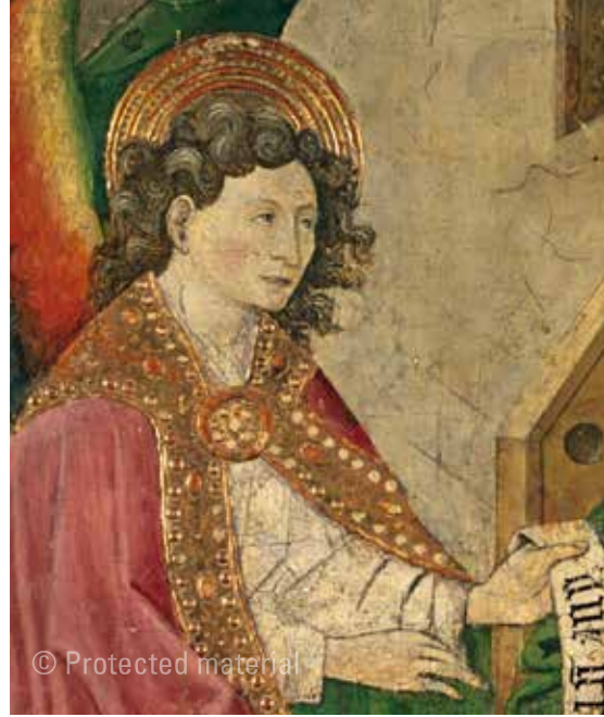
13. Master of Cervera de la Cañada (active in second half of 15th century) Annunciation of the Virgin Amatller Collection, Barcelona Detail