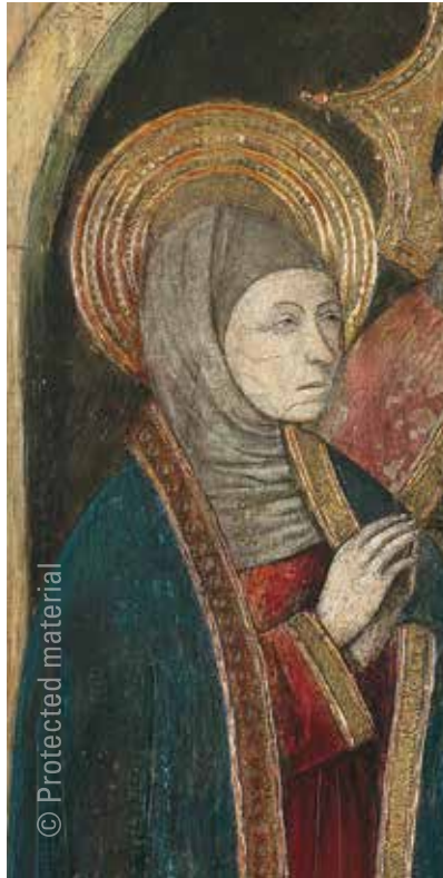
19. Master of Cervera de la Cañada (active in second half of 15th century) Presentation of the Virgin in the Temple Bilbao Fine Arts Museum Saint Anne (detail)