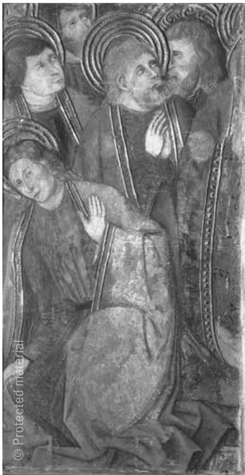
6. Master of Cervera de la Cañada (active in second half of 15th century) Pentecost , compartment of the Retable of Cervera de la Cañada Tempera on panel, 68 x 37 cm Private collection

To my mind, the Retable of the Virgin from Cervera de la Cañada should be located at the periphery of the circle defined by the activity of the Master of Saint George and the Princess and his workshop. It is an artistic movement that hybridizes the tradition of the fertile international Gothic in Aragon with numerous ingredients of the new Flemish realism and which also seems to include some familiarity with the art world in Barcelona in the mid-15th century.