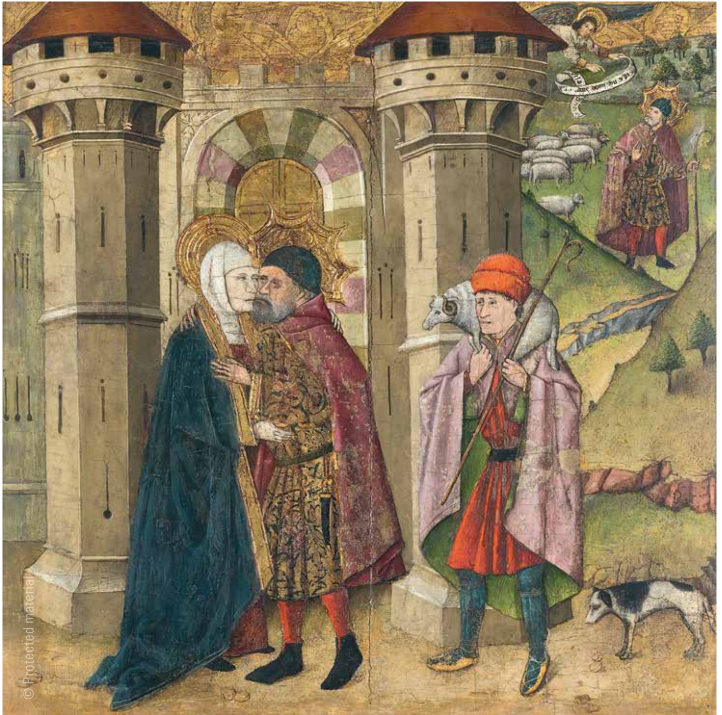
1. Master of Cervera de la Cañada (active in second half of 15th century) Saint Joachim and Saint Anne at the Golden Gate in Jerusalem , compartment of the Retable of Cervera de la Cañada Tempera on panel, 90 x 92 cm Bilbao Fine Arts Museum Inv. no. 69/131