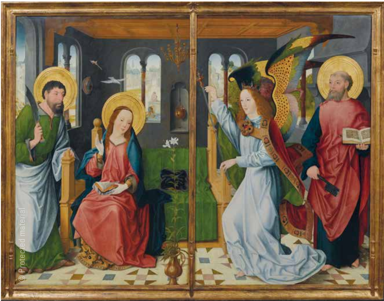
10. Master of the Holy Kinship (active in Cologne c. 1475-1510) Annunciation , c. 1490 Oil on panel, 134 x 94 cm (each panel) Private collection