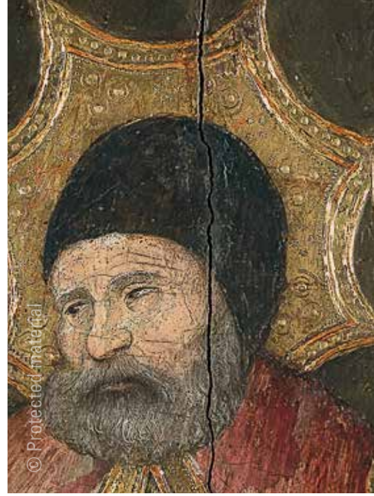
17. Master of Cervera de la Cañada (active in second half of 15th century) Presentation of the Virgin in the Temple Bilbao Fine Arts Museum Saint Joachim (detail)