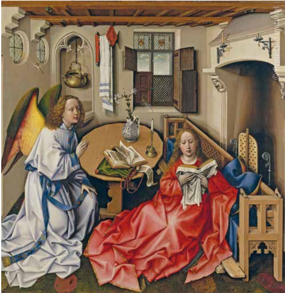
8. Robert Campin (c. 1375-1444) Annunciation , central compartment of the Mérode Triptych , c. 1425 Oil on panel, 64.1 x 63.2 cm The Metropolitan Museum of Art, New York Inv. no. 1956 (56.70)

the works of Campin's circle is the elongated bench the Virgin is seated on. Although in the Mérode Altarpiece , the Brussels Annunciation and Annunciation in a Church , the Virgin sits directly on the floor, adopting the old iconography of the Virgin of humility, both in these works and in the compartment devoted to Saint Barbara, the long bench, partially covered with fabric and cushions, is an essential part of the composition. The Master of Cervera de la Cañada, however, organizes the elements differently and places the bench so the Virgin is seated facing the spectator. The bench is in fact almost entirely concealed by a green fabric that generates a complex play of folds. Like Campin's Virgins, the Master of Cervera de la Cañada's Mary holds a book in her hands, thus eschewing the gesture of prayer more usually found in the Annunciations of the kingdom of Aragon. Distracted for a moment from her reading by the presence of an angel, the Virgin lifts her gaze from the book to give her attention to the messenger who arrives, as is habitual in Aragon, unfolding a large phylactery or speech scroll bearing the words "ave gratia plena, dominus tecum". In some annunciations from Campin's circle, the Virgin's room has a window with wooden shutters that opens on to the outside world; this is also used by the Master of Cervera. Here, the shutters are open and he avoids the complex play of open and closed frames to be found in the Mérode and Brussels annunciations.