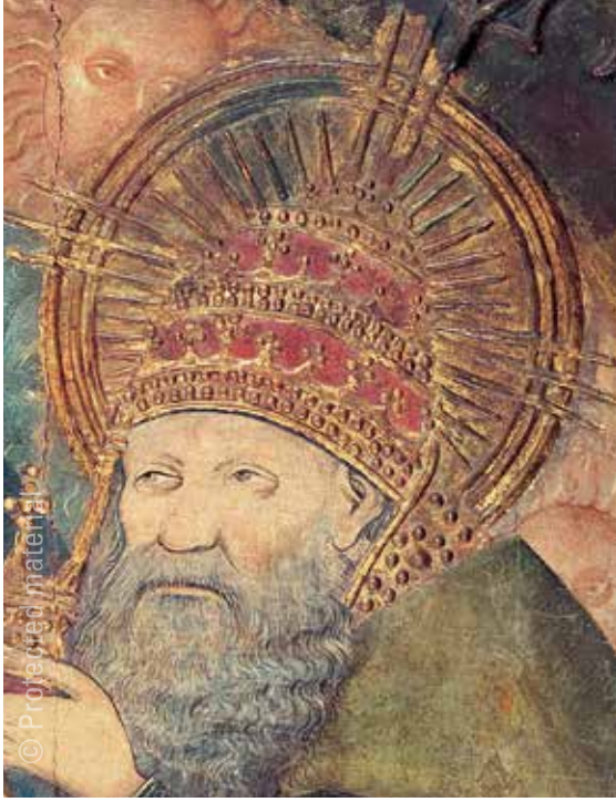
16. Master of Cervera de la Cañada (active in second half of 15th century) Coronation of the Virgin MNAC-Museu Nacional d'Art de Catalunya, Barcelona God the Father (detail)