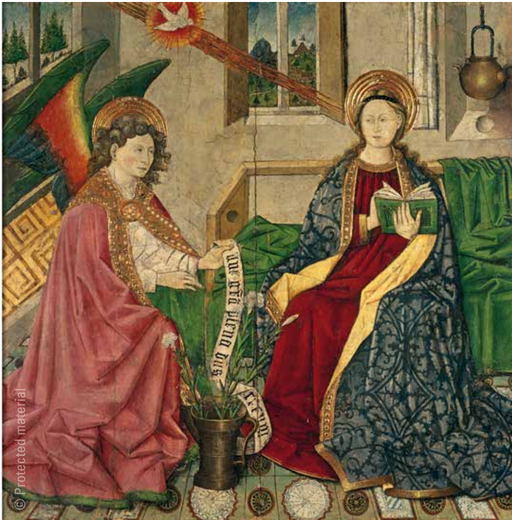
4. Master of Cervera de la Cañada (active in second half of 15th century) Annunciation of the Virgin , compartment of the Retable of Cervera de la Cañada Tempera on panel, 83 x 83 cm Amatller Collection, Barcelona