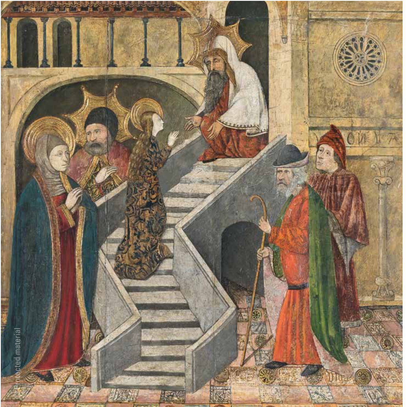
2. Master of Cervera de la Cañada (active in second half of 15th century) Presentation of the Virgin in the Temple , compartment of the Retable of Cervera de la Cañada Tempera on panel, 90 x 91 cm Bilbao Fine Arts Museum Inv. no. 69/132