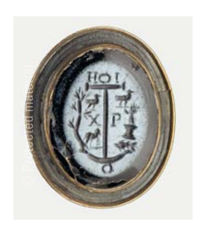
14. Paleochristian gemstone with multiple symbols, c. 300-320 Chalcedony with nicolo intaglio, 1.6 x 1.3 cm Ashmolean Museum, University of Oxford Inv. no. ANFortnum.107