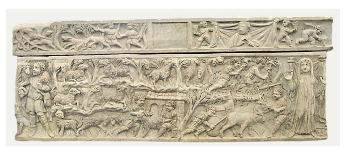
8. Continuous-frieze sarcophagus with pastoral motifs Late 3rd-early 4th century Pio Cristiano Museum, Vatican City