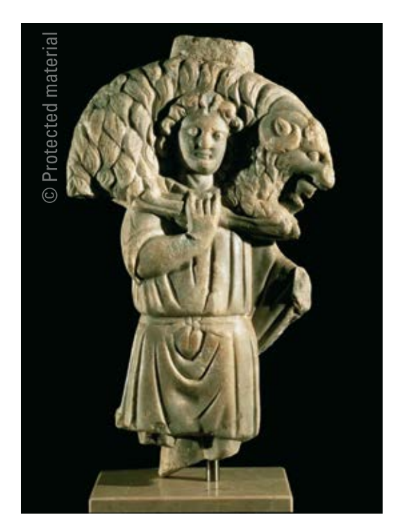
13. Good Shepherd of Gádor, 4th century White marble, 68.5 x 40 cm Museum of Almería

Proof of the relevance acquired in the 4th century by the motif of the Good Shepherd is the fact that it was used on all kinds of supports. In some cases, like free-standing Christian-themed sculpture, this was virtually the only image used, with the exceptions of the figure of Christ as philosopher in the museum of Rome's Palazzo Massimo and the small sculptures showing the Jonah cycle at the Cleveland Museum of Art. In these, which make an iconographically homogeneous group, the Good Shepherd is shown in front of a tree trunk, usually a palm-tree, which made the sculpture more consistent; He bears a lamb on His shoulders while two others graze at His feet. Obeying the same functional requirements, the Good Shepherd's arms are very close to the body, to prevent any fragility threatening the work as a whole. This makes the figures look very compact as a rule. Three Spanish examples are amongst the fifteen or so known cases. The one in the Casa de Pilatos (Pilatos's house) in Seville [fig. 12] belongs to the Rome type<sup>24</sup>, in which the Shepherd's face turns towards the head of the lamb, while the two found in Gádor (Almería) [fig. 13], markedly front-on, have features that link them with works from further East<sup>25</sup>.