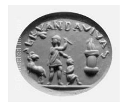
22. Paleochristian gemstone with the sacrifice of Isaac, c. 360-380 Chalcedony with nicolo intaglio, 2.2 x 1.9 cm Private collection

If it were not for the fact that it has no olive branch in its beak, the bird that, in our gem, flies between the ribbon-adorned crown and the Chi Rho, could be seen as an allusion to the same passage on Noah's ark. There are parallels, like the one of a gem in the Hermitage in St. Petersburg [fig. 19]<sup>39</sup>, where the bird alights on the stock of the anchor, as a kind of allegory of the soul that finds a resting-place in the hope of salvation. In the Ashmolean Museum gem [fig. 14] there are two birds, one either side of the anchor, and in one of the gems in the British Museum [fig. 18] the birds are shown in isolation close to the Good Shepherd, while the motif is repeated in the lower part, with the bird now posed on the ark. However, in the other British Museum gem [fig. 17] a bird quite clearly in flight with the olive branch in its beak heads toward the human figure. In our gem, the bird seems to allude to the disintegration of the group that usually perches in the branches sheltering the Good Shepherd.