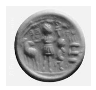
20. Paleochristian gemstone with the sacrifice of Isaac, c. 400 Carnelian Private collection