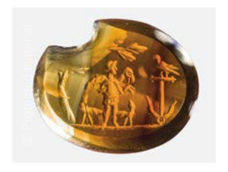
19. Paleochristian gemstone with the Good Shepherd, tree and bird standing on anchor, c. 350-370 Carnelian, 1.6 x 1.3 cm The State Hermitage Museum, St. Petersburg Inv. no. GR-25816 (Zh-5621)