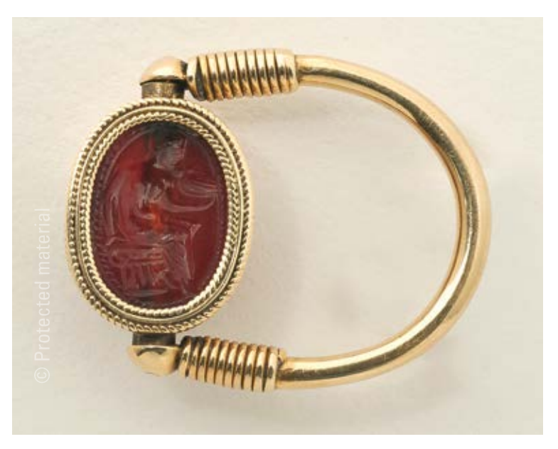
2. Carving with an image of Athena Polias, 3rd century B.C. Garnet scarab mounted on a rotatable gold ring Ring: 1.6 (maximum diameter) x 0.2 cm; scarab: 1.5 \times 1.1 \times 0.7 cm Bilbao Fine Arts Museum Inv. No. 82/1433

unmistakable large round eyes of an owl, symbol of Athena and the city of Athens. A gold ring from c. 400 BC from Cyprus signed by Anaxiles in the British Museum collection<sup>7</sup> has a similar portrayal of Athena with the owl on her left hand. A coin from Xanthos from 410 BC<sup>8</sup> bears the same iconographic type, which comes from the revered statue of Athena Polias, tutelary goddess of the Acropolis and Athens; Pausanias (I, 26.6) describes the ancient wooden image, which received the offering of the peplos during the Panathenaic festivals. The seated figure, bearer of a patera and holding a golden owl, was one of the most highly valued objects of the treasure of Erechtheion<sup>9</sup>. We know of archaic replicas in terracotta and one in stone, found on the north slope of the Acropolis, which may well be the one Pausanias attributes to the sculptor Endoios (I, 26.4)<sup>10</sup>. In the gem under discussion here, the simplified semi-nude figure is very similar to a seated Aphrodite, although the owl means it must be Athena. The footrest she sits on, with its air of being the top of an lonic column, also bears a remarkable likeness to the altar that precedes Athena Polias in portrayals on Attic black-figure ceramics<sup>11</sup>.