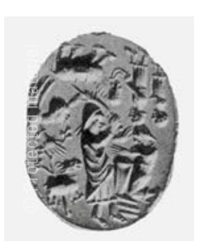
21. Paleochristian gemstone with the sacrifice of Isaac and multiple symbols, c. 400 Carnelian, 2.3 x 1.7 cm Private collection