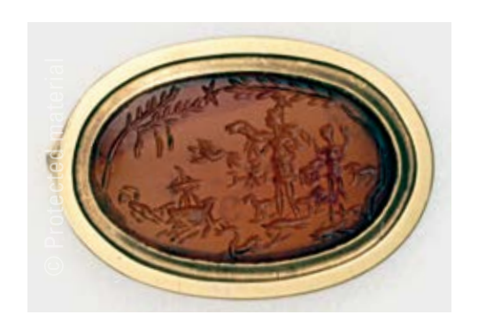
17. Paleochristian gemstone with multiple symbols, c. 320-340 Carnelian, 1.75 x 1.1 cm British Museum, London Inv. no. 1856,0425.10