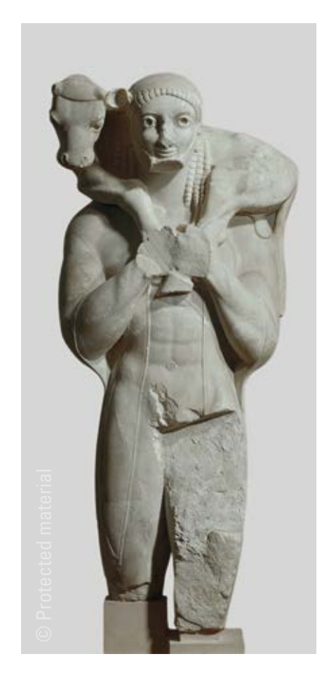
6. Hermes Kriophoros , c. 500-490 BC Museum of Fine Arts, Boston Inv. no. 99.489