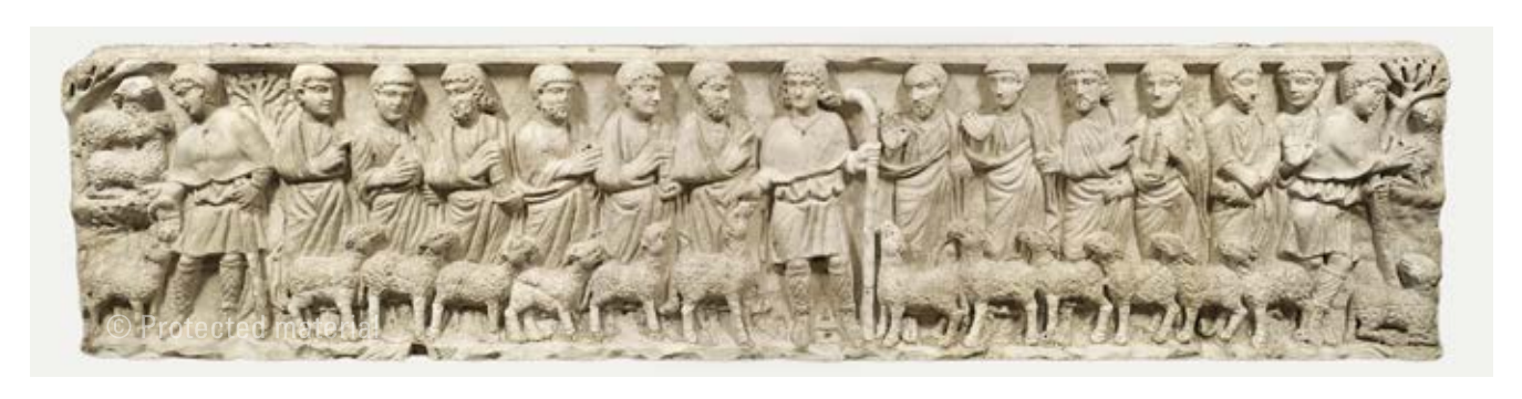
9. Continuous-frieze sarcophagus with portrayals of Christ and the Apostles Rome, last quarter of 4th century Pio Cristiano Museum, Vatican City