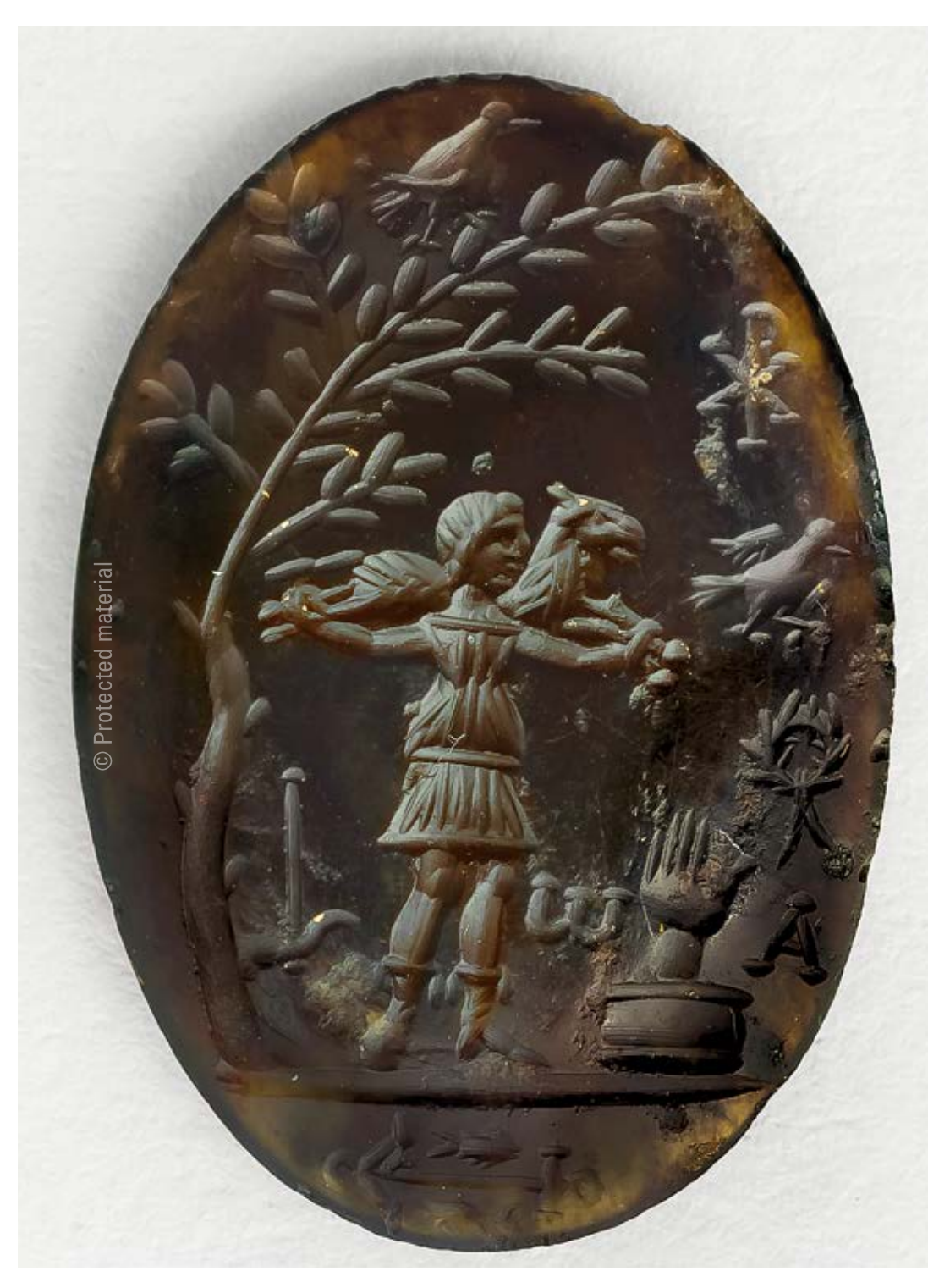
1. Carved oval gemstone with symbols Paleochristian, second half of 4th century Quartz, 3.2 x 2.1 x 0.4 cm Bilbao Fine Arts Museum Inv. no. 82/1432