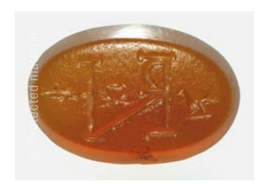
25. Paleochristian gemstone with monogram, fish, laurel and bird, c. 300-320 Carnelian, 1.5 x 1 cm Bibliothèque Nationale de France Inv. no. 2167

The combination of symbols and figures in the early Christian gem at the Bilbao Fine Arts Museum suggests that it was made in the second half of the 4th century AD. The iconographic repertoire in use at that time had developed to full maturity and the motifs referring to each subject were by then sufficiently clear for use in isolation. It was thus possible to portray more, and more varied, contents, with the inescapable economy of means imposed by the size of the gem. Even so, in this particular case, the gems is larger than usual, meaning the figures could be rendered in no little detail.