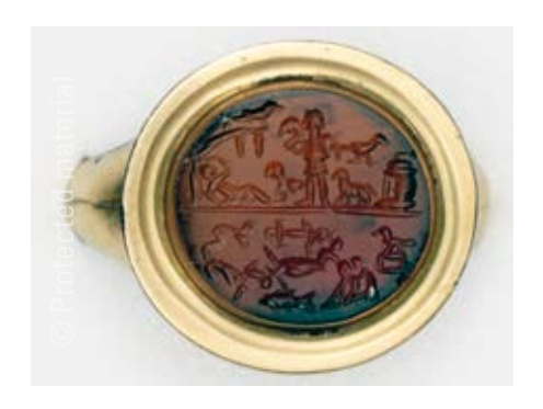
18. Paleochristian gemstone with multiple symbols, c. 320-340 Carnelian, 1.3 x 1.2 cm British Museum, London Inv. no. 1856,0425.9