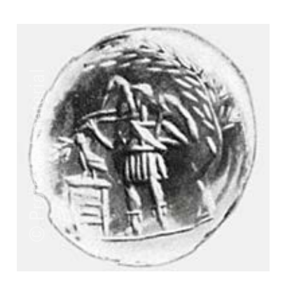
16. Paleochristian gemstone with the Good Shepherd and a bird on the altar, c. 350 Sardonyx, 1.6 cm Campo Santo Teutonico, Rome Inv. no. G 4