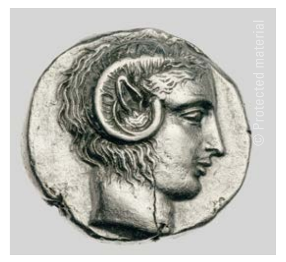
5. Nomos with portrayal of Apollo Karneios Lucania (Metaponto), 5th century BC Museum of Fine Arts, Boston Inv. no. 97.427