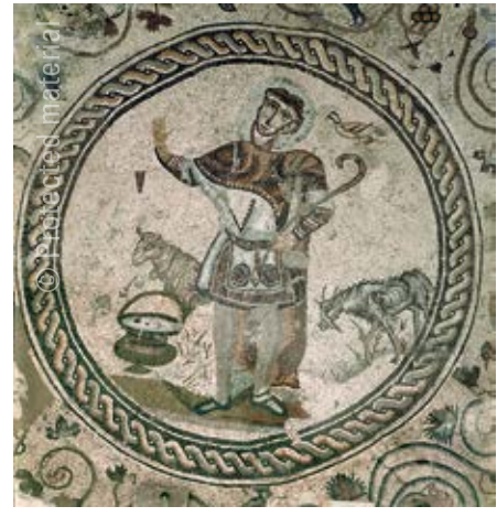
11. Mosaic from a domus in Fondo Cossar (Aquileia) with a portrayal of the dominus-pastor , 4th century Museo Archeologico Nazionale di Aquileia, Italy