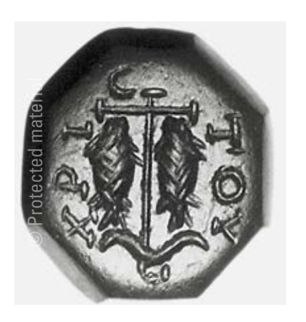
15. Paleochristian gemstone with anchor and fishes, c. 300-320 Red jasper, 1.3 x 1.15 cm Private collection