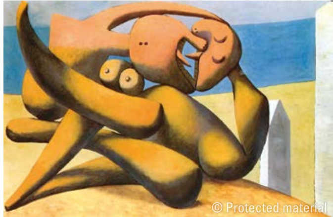
4. Pablo Picasso (1881-1973) Figures au bord de la mer (Figures by the Sea) , 1931 Oil on canvas, 130.5 x 195.5 cm Musée Picasso, Paris