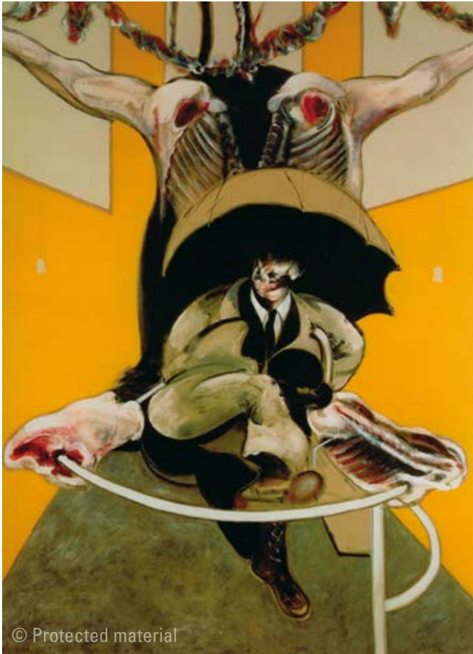
1. Francis Bacon (1909-1992) Painting 1946 (Second Version) , 1971 Oil on canvas, 198 x 147.5 cm Museum Ludwig, Köln

Bathed in brilliant light, and yet casting no shadow, the fleshy body is little more than a biomorphic mass with just the members, the curve of the thighs and a head sketched in or suggested. In the early thirties, Pablo Picasso had condensed the human body into a surface of colour, and in a painting like Nu au jardin (Nude in the Garden) , 1934 [fig. 3], he used a few lines and a brief scratch or two to mark the shape of the large body, the breasts, anus and pubis. It was the amazing force of Picasso's works, which Bacon saw for the first time in Paris in the 1920s, that had so impressed the young Irishman then embarking on his own artistic career. It is quite likely that Bacon also saw the large painting of the massively powerful Figures au bord de la mer (Figures by the Sea) , 1931 [fig. 4], at least in reproduction. The position of the figures perched on a sort of arched prominence and, above all, the totally liberated interpretation of the physiognomy, freed too from all the conventions governing the representation of the human body, would certainly suggest that he had.