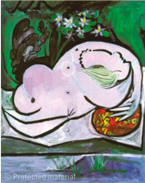
3. Pablo Picasso (1881-1973) Nu au jardin (Nude in the Garden) , 1934 Oil on canvas, 162 x 130 cm Musée Picasso, Paris