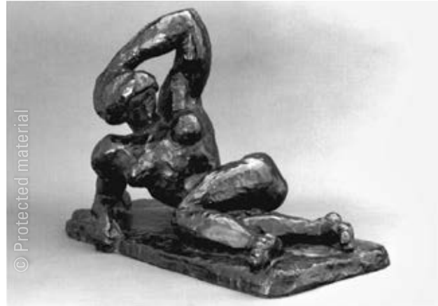
6. Henry Matisse (1869-1954) Nu couché I (Aurore) (Nude Lying I (Aurore)) , 1907 Bronze, 36 x 51 x 27 cm Musée d'Art Moderne de la Ville de Paris

the figure lies, only the yellow is more intense. But one does not perceive either the expected distortion of space or the symmetry between room and reflection. The painting's assumed clarity gives way, provoking a permanent sense of insecurity. Here the mirror is not a vehicle for a "distortion or alteration of the figure represented" 5 ; the figure is not duplicated either. It is there as a mere affirmation, one for which there are insufficient indications. Gilles Deleuze got to the heart of the matter in 1984 in his interesting study of Bacon's oeuvre: "Everything is possible in Bacon's mirror, except a surface that actually reflects". Talking about Lying Figure in Mirror he continues: "The body penetrates the mirror, it settles there, it and its shadow. That accounts for its fascination: there's nothing behind the mirror, just in it " 6 .