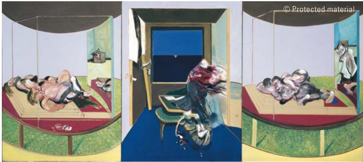
7. Francis Bacon (1909-1992) Triptych – Inspired by T.S. Eliot's poem "Sweeney Agonistes" , 1967 Oil on canvas, 198 x 147.5 cm Hirshhorn Museum and Sculpture Garden, Smithsonian Institution, Washington, D. C. Gift of the Joseph H. Hirshhorn Foundation, 1972

tally to divide the surface and mark the position of the figure lying on it was predefined. As the soft violet of the upper half of the painting and the yellow in the lower half were applied later, the violet, for instance, in the edge areas also becomes visible below the figure. Both yellow and violet, and the intense black of the blinds hanging from the upper edge of the painting, must have been applied with a roller. Then he traced the lines at an obtuse angle, thereby indicating the frame that fixes the figure on the surface of the painting. Here a simple frame replaces the cage-like structures of the works from the 1950s and 60s, which provide support for which provided the figures inside the space with a frame. A layer of fine sand covers most of the yellow surface, although it hasn't stuck everywhere. Within the supposed mirror, for the reflection of the light, Bacon retouched this rough, brilliant zone with a dirty cloth, taking off some of the sand in the process. Only the darker, more compact area inside the "frame" suggests a mirror reflection.