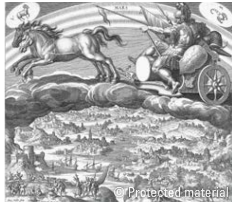
46. Johann Sadeler the Elder (1550-1600), after lost drawing by Martin de Vos (1532-1603) Mars , 1585 Engraving, 215 x 245 cm The British Museum, London

Music, books, instruments of knowledge and the reflexive attitudes of the figures are constant themes of the illustrations circulating from the late Middle Ages throughout Europe.