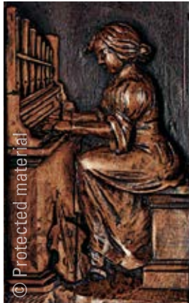
19. Anonymous, German Bureau, c. 1560-1570 Bilbao Fine Arts Museum Detail