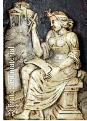
24. Anonymous, German Bureau, c. 1560-1570 Bilbao Fine Arts Museum Detail