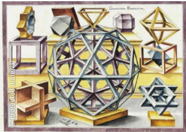
10. Lorenz Stöer (active in the second half of the 16th century) Illustrative plate with geometric figures, no. 332, 1564 Library of the University of Munich, Germany