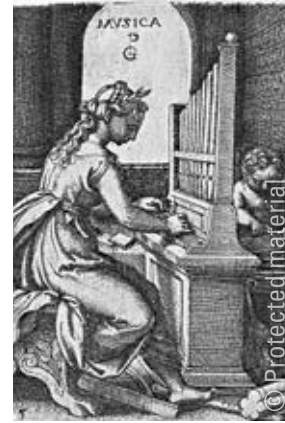
21. Hans Sebald Beham (1500-1550) Music , 1531-1550 Engraving no. 5 from the series The Liberal Arts The British Museum, London

found in the abundant production in Augsburg and Nuremberg. The artist who carved the reliefs here 44 used different prints to represent them, which makes identifying them correctly a difficult, complex task and more so, as we shall see later, the interpretation of its iconographic programme.