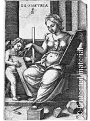
25. Georg Pencz (c. 1500-1550) Geometry , c. 1541 Engraving no. 6 from the series The Liberal Arts The British Museum, London

in Landscapes by Virgil Solis [figs. 22 and 23] 49 ; also identifiable are Grammar, Geometry [figs. 24 and 25] and Ceres and the Summer [figs. 26 and 27]. Some, which we might interpret as Dialectics or Grammar, like the two flanking Jupiter in the third drawer to the right, do not strictly match with the liberal arts or the standard virtues, having been taken from a small series by Virgil Solis of the four allegorical figures in landscapes, on which Self-Knowledge [figs. 28 and 29] 50 , Peace, Truth and Calumny are personified 51 .