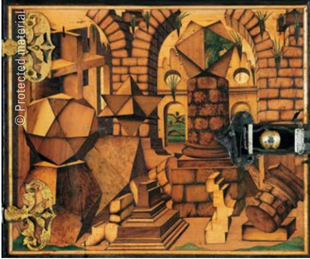
12. Anonymous, German Bureau, c. 1560-1570 Bilbao Fine Arts Museum Detail of interior of central door