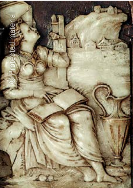
28. Anonymous, German Bureau, c. 1560-1570 Bilbao Fine Arts Museum Detail