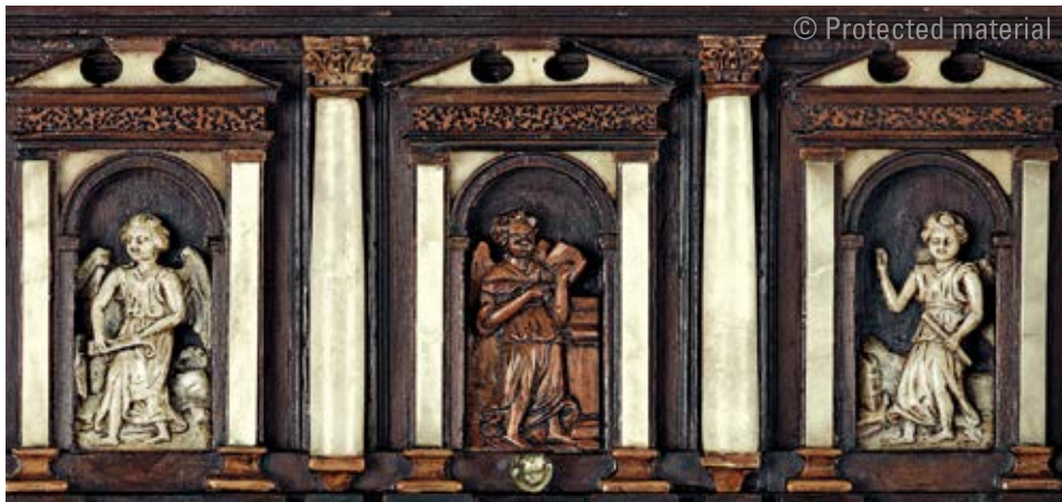
37 and 38. Anonymous, German Bureau, c. 1560-1570 Bilbao Fine Arts Museum Details