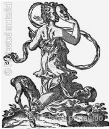
34. Jost Amman (1539-1591) Woman with mask representing Deceit (Detractio) Engraving from the series Kunstbüchlin Herzog August Bibliothek, Wolfenbüttel, Germany