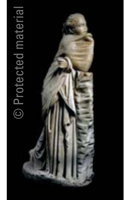
33. Polyhymnia , late 2nd century Marble, 159 cm (height) Musei Capitolini, Centrale Montemartini, Rome Inv. no. MC2135

Rather more difficult to identify are the figures of the plinth: three females, two of them seated in thoughtful pose and another with a spindle before a flock of sheep, and three males, a young shepherd and a beggar, for which a reference has been found in a late 15th-century engraving from the school of Ferrara for Tarot cards [figs. 43 and 44] 57 . For the two scenes with two figures under the main relief, only a slight similarity has been found in Solis's prints in different contexts, such as the Story of Joseph 58 . And as for the warrior in the two-horse chariot, the closest reference is probably Sadeler's Mars after a lost Martin de Vos drawing [figs. 45 and 46] 59 .