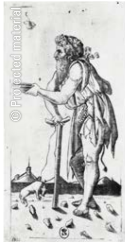
44. Anonymous, school of Ferrara Blind beggar with dog Engraving, 225 x 110 cm (paper); 216 x 104 cm (print) Bibliothèque nationale de France, Paris