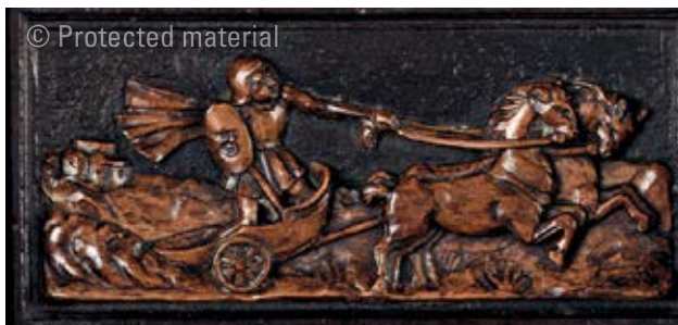
45. Anonymous, German Bureau, c. 1560-1570 Bilbao Fine Arts Museum Detail