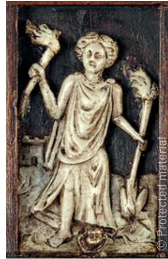
49. Anonymous, German Bureau, c. 1560-1570 Bilbao Fine Arts Museum Detail