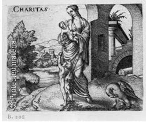
23. Virgil Solis (c. 1514-1562) Charity Engraving from The Virtues in Landscapes Kupferstichkabinett, Staatliche Museen Preussischer Kulturbesitz, Berlin