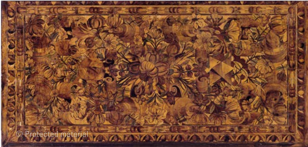
5. Anonymous, German Bureau, c. 1560-1570 Bilbao Fine Arts Museum Detail of upper plane