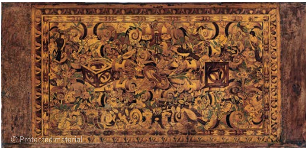
6. Anonymous, German Support table of the bureau, c. 1560-1570 Wood, 48.7 x 101.5 cm Bilbao Fine Arts Museum Inv. no. 82/2472

The two side planes [figs. 7 and 8], with similar floral motifs, are arranged around a centre as a sort of lectern, inside which we glimpse large books and a polyhedron surrounded by two large birds. The four planes are framed by a double border, the inner one with buds and flat discs and the outer one with algae, both motifs taken from the classical world and common in Mannerist engravings, in which owls also appear as guardians above the cartouche 29 . A careful analysis of all the planes reveals the cuts and additions made to the piece in earlier restorations. The same type of marquetry can be seen in the four sides of the central space behind the door, consisting in a single scroll with a prism in the laterals and the floor, and in a garland at the back. In the superb plane of the lower drawer which also serves as lectern or writing desk, the