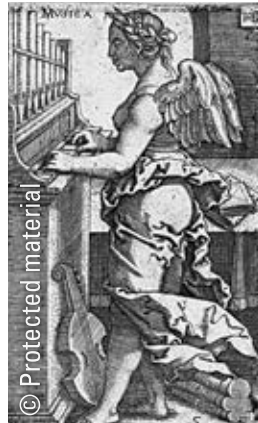
20. Georg Pencz (c. 1500-1550) Music , c. 1541 Engraving no. 5 from the series The Liberal Arts The British Museum, London