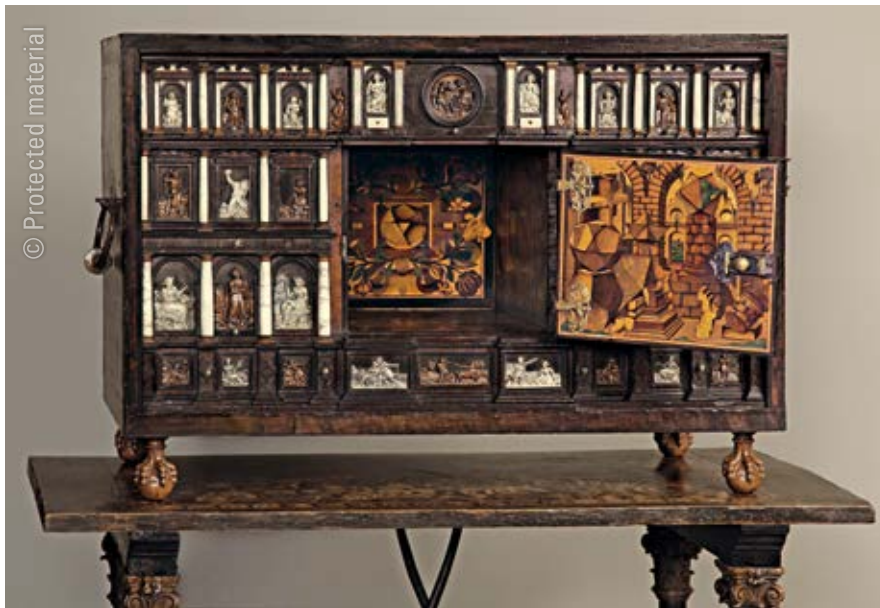
2. Anonymous, German Bureau, c. 1560-1570 Wood, alabaster and iron, 56.3 x 89.1 x 38.6 cm; 89 x 101.5 x 48.7 cm (table) Bilbao Fine Arts Museum Inv. no. 82/1477; 82/2472 (table) Detail with door open