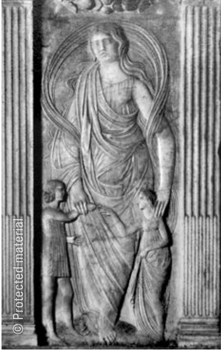
51. Agostino de Duccio (1418-1481) Erato , 1451-1455 Malatesta temple, Rimini, Italy

tor of Theology and Philosophy, as the planet-god of all scholars 66 . He is also depicted this way in the bureau now in the Victoria & Albert Museum mentioned above.