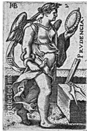
39, 40, 41 and 42. Hans Sebald Beham (1500-1550) Geometry, Rhetoric, Dialectics and Prudence Engravings nos. 6, 3 and 2 from the series The Liberal Arts and engraving no. 2 from the series The Seven Virtues The British Museum, London