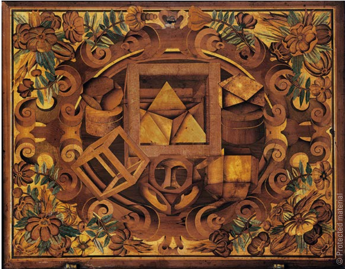
4. Anonymous, German Bureau, c. 1560-1570 Bilbao Fine Arts Museum Detail of lid of extractable central drawer