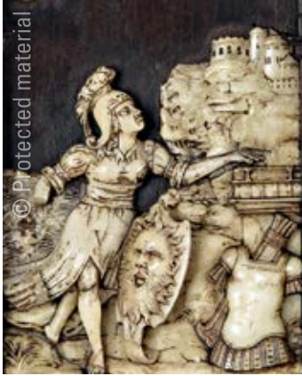
16. Anonymous, German Bureau, c. 1560-1570 Bilbao Fine Arts Museum Detail