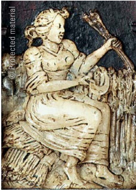
26. Anonymous, German Bureau, c. 1560-1570 Bilbao Fine Arts Museum Detail