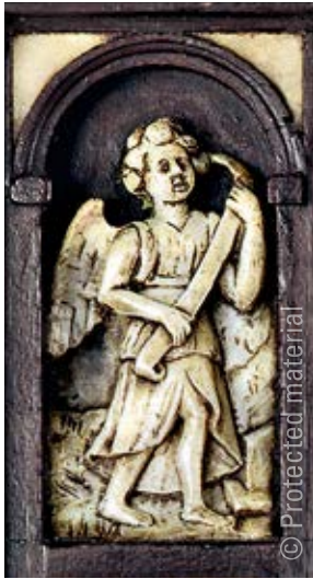
47 and 48. Anonymous, German Bureau, c. 1560-1570 Bilbao Fine Arts Museum Details