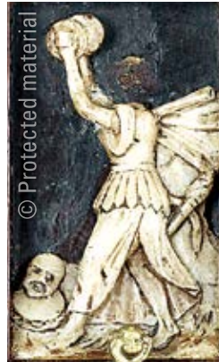
35. Anonymous, German Bureau, c. 1560-1570 Bilbao Fine Arts Museum Detail