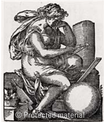
30. Jost Amman (1539-1591) Woman with a compass representing Geometry (Melancholy) Engraving from the series Kunstbüchlin Herzog August Bibliothek, Wolfenbüttel, Germany