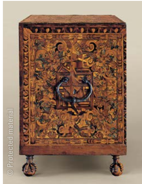
7 and 8. Anonymous, German Bureau, c. 1560-1570 Bilbao Fine Arts Museum Details of sides