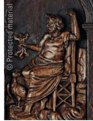
18. Anonymous, German Bureau, c. 1560-1570 Bilbao Fine Arts Museum Detail