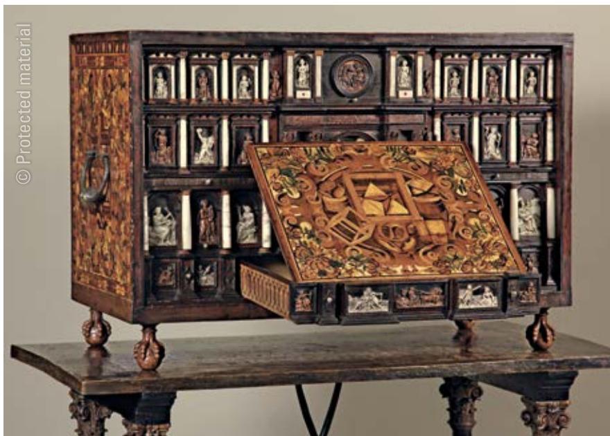
3. Anonymous, German Bureau, c. 1560-1570 Bilbao Fine Arts Museum Detail with extractable central drawer