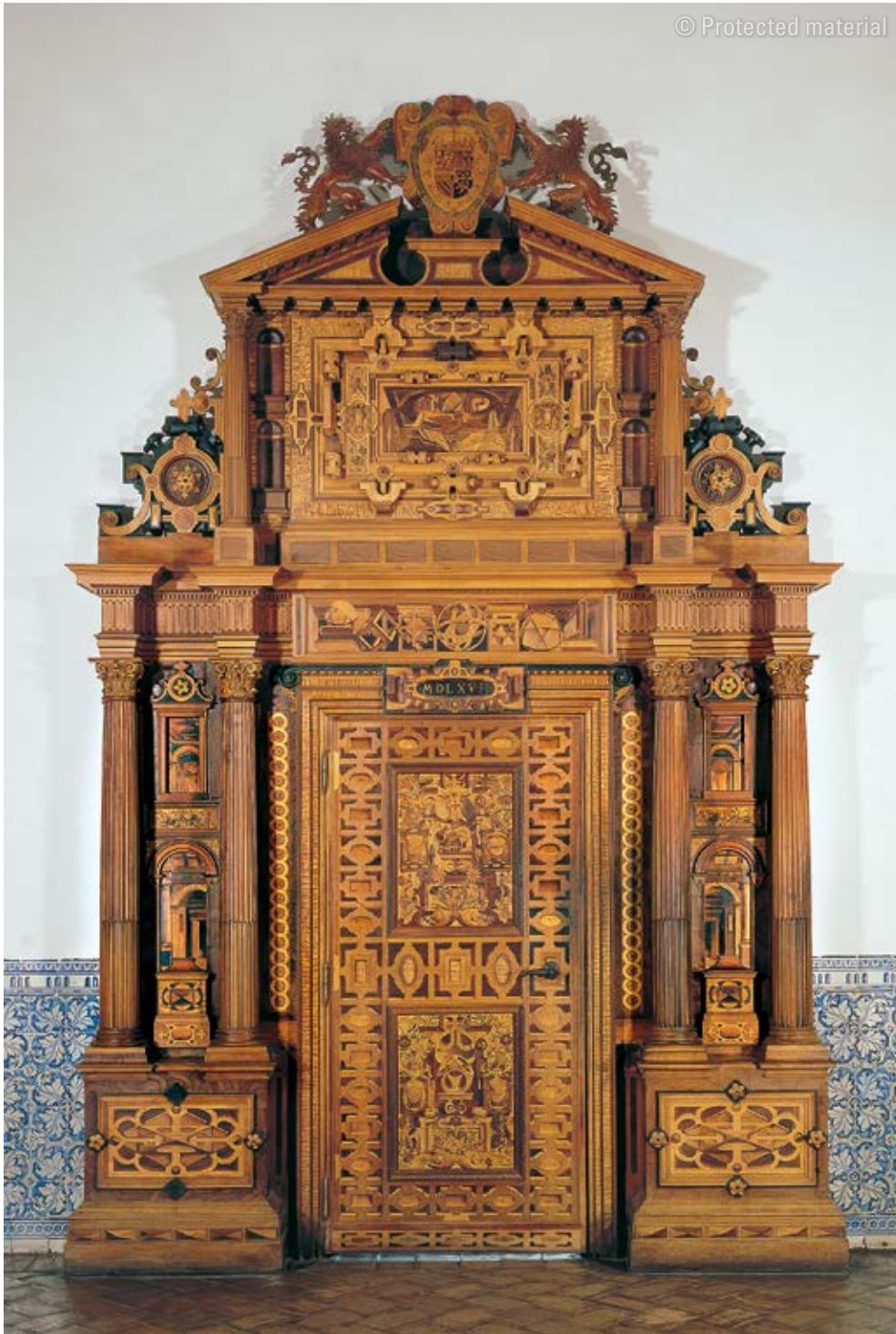
9. Attributed to Bartholomew Weisshaupt (active between 1560 and 1580) Door of Hall of Ambassadors, 1567 Royal Monastery of San Lorenzo de El Escorial, Madrid Inv. no. 10014373