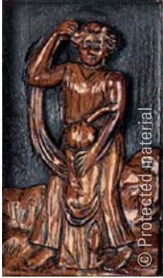
22. Anonymous, German Bureau, c. 1560-1570 Bilbao Fine Arts Museum Detail