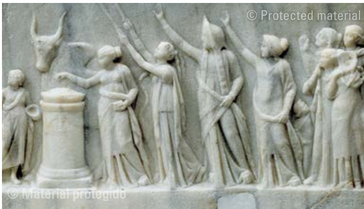
50. Apotheosis of Homer Relief discovered mid-17th century on Appian Way The British Museum, London Detail

One of the first hypotheses was that the bureau was made for a woman, together with the possible representation of Biblical "strong women" alongside the virtues and the arts, another typical humanist interpretation that exemplifies the power and the virtue of the alma poesis , or of the arts in general, the argument being supported in reference to the gods.