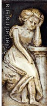
31 and 32. Anonymous, German Bureau, c. 1560-1570 Bilbao Fine Arts Museum Details