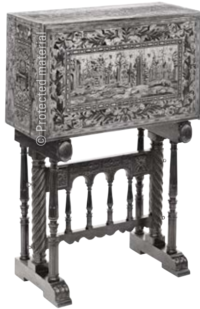
14. Attributed to HS master Bureau, 1560 Wood, 59.5 x 96.5 x 42.5 cm Victoria & Albert Museum, London Inv. no. W.24:1, 3-1931