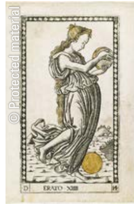
36. Anonymous, school of Ferrara Erato XIII , c. 1465 Engraving from the series known as Tarocchi de Mantegna , 20.4 x 13.5 cm Hamburger Kunsthalle, Hamburg, Germany Inv. no. 49245

existed. One of these is Poetry, placed next to Music in the second drawer on the right with two torches lit over her head [fig. 49], the reference being the relief of the Apotheosis of Homer discovered in the Appian Way in the mid-17th century, and today in the British Museum [fig. 50], where she is placed between History, offering a sacrifice, and Apollo and Calliope, the latter holding a scroll of a new poem 61 .