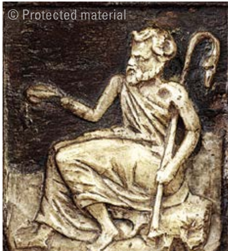
43. Anonymous, German Bureau, c. 1560-1570 Bilbao Fine Arts Museum Detail