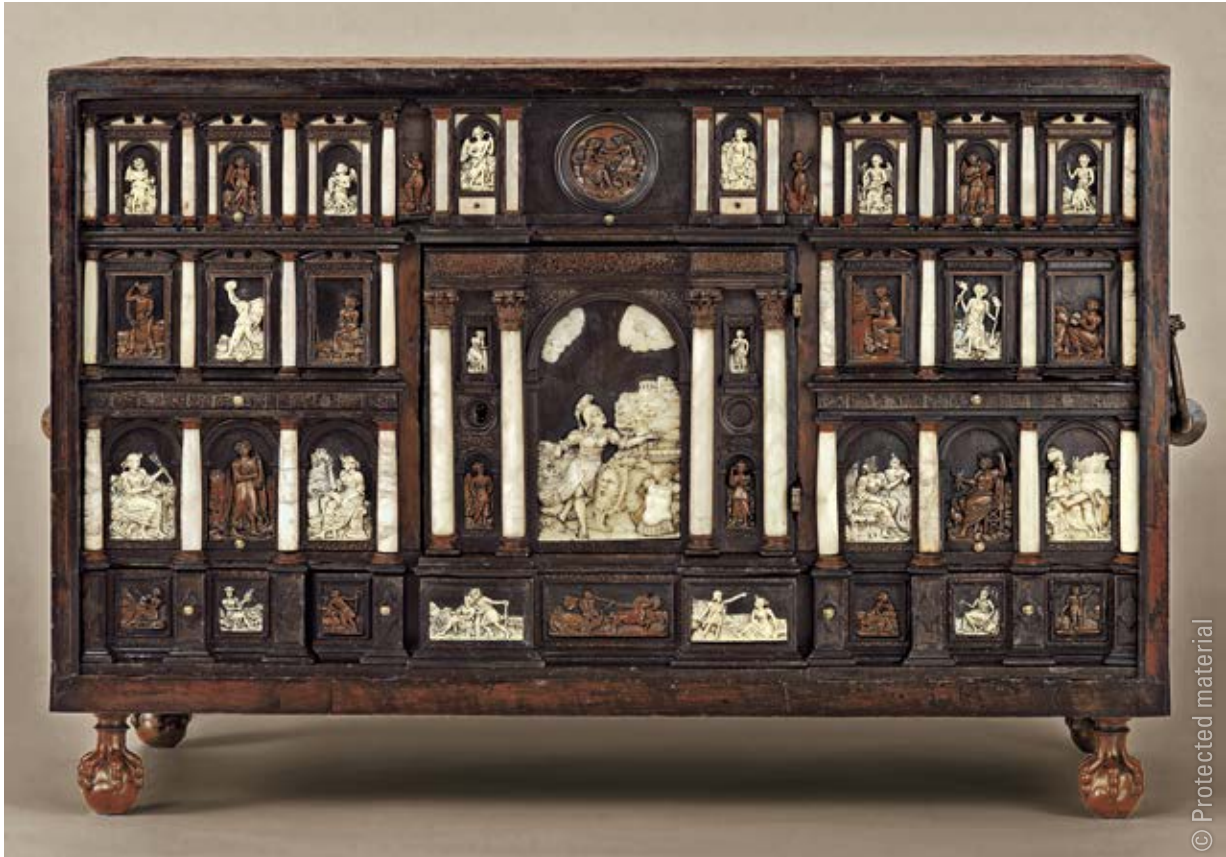
1. Anonymous, German Bureau, c. 1560-1570 Wood, alabaster and iron, 56.3 x 89.1 x 38.6 cm Bilbao Fine Arts Museum Inv. no. 82/1477