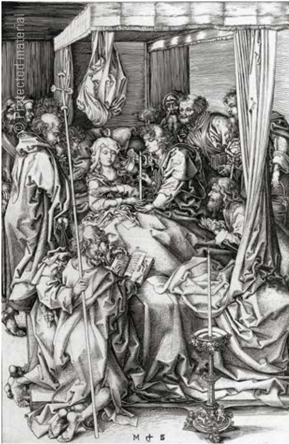
20. Martin Schongauer (documented in 1465-1491) The Death of the Virgin , c. 1470-1475 Engraving. 254 x 169 mm