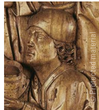
23. Anonymous, German (Eastern Bavaria?) The Dormition of the Virgin , c. 1500 Bilbao Fine Arts Museum Detail