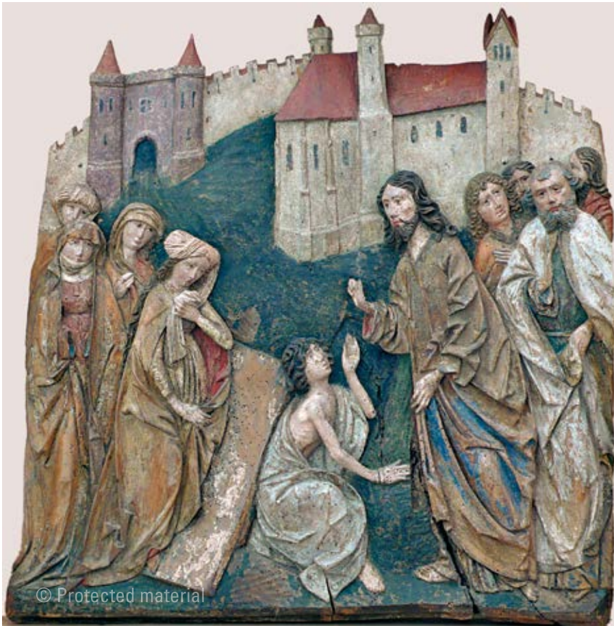
30. Anonymous, Bavaria Resurrection of Lazarus , c. 1510 Wood relief from Haigermoos, 68.5 x 67 cm Diözesanmuseum, Freising Inv. no. P 103

the atmosphere in which the Bilbao relief was created. The work that comes closest to The Dormition of the Virgin in Bilbao has also been connected with Landshut, originating from the village of Haigermoos, about a hundred kilometres to the south east of Landshut, in upper Austria, to the north of Laufen and near the river Eno 61 . It is a much smaller relief depicting the resurrection of Lazarus [fig. 30]. The difference in size and the polychromy make a judgement more difficult, but the strong vertical features, the drawing of the folds, the treatment of several other details and even the human types, invite comparison. These analogies 62 provide further backing for the attribution of the Bilbao relief to a studio active in the area in the triangle defined by the cities of Landshut, Salzburg and Passau, close to the Eno, a river that runs between lower Bavaria and upper Austria. Support for this conjecture may be gleaned from the fact that many —although not all— the works on offer in 1930 by the Krüger collection came from Bavaria, the Tyrol and the Alps 63 . Although the support, lime wood, confirms the general classification, it unfortunately does not authorize us to make a more specific attribution. Lime wood was preferred throughout southern Germany, also being used in the Alps and, exceptionally, even in the Baltic area 64 . It has a relatively homogeneous structure, is reasonably easy to carve and is more durable than poplar.