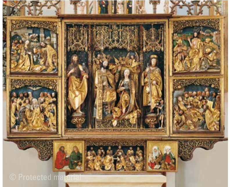
6. Veit Stoss (documented in 1476-1533) High retablo, Schwabach, 1505-1508 1350 x 631 x 86 cm Church of St. John the Baptist and St. Martin, Schwabach (near Nuremberg)

Under the shrine or central panel, German retablos usually had a predella, a platform or step on which the altar rests, which often housed relics, sculptures or paintings. Later the Monstrance could also be stored there, mirroring developments in the retablo in Spain. Although some early retablos are known to have been used to house the Monstrance 13 , in general it was kept in cabinets, often placed inside the walls of the choir, or in freestanding structures, like the famous Tabernacle towers that have survived in a number of regions in Germany. The fact that some primitive retablos were used to keep relics or the Monstrance was probably one of the factors that led to the first retablos with shrines that could be closed, although this has been the subject of much discussion 14 .