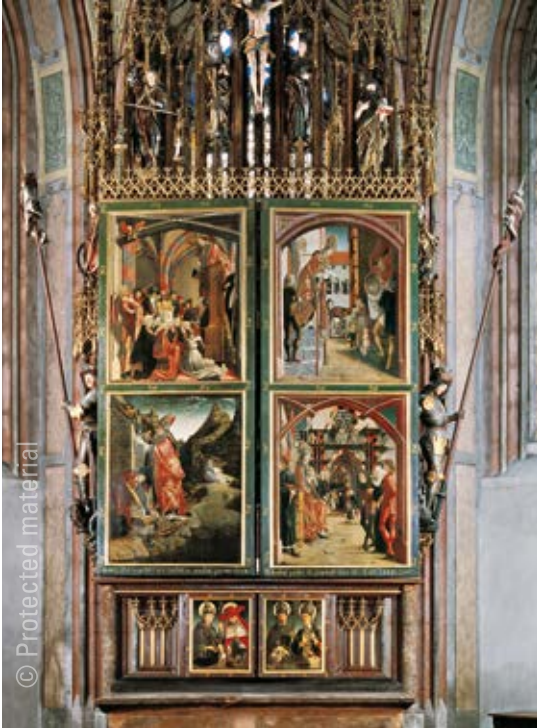
7. Michael Pacher (documented in 1465-1498) High retable, St. Wolfgang (commissioned 1471, finished 1481) 1088 x 330 x 97 cm Parish church of St. Wolfgang, Salzkammergut, Austria