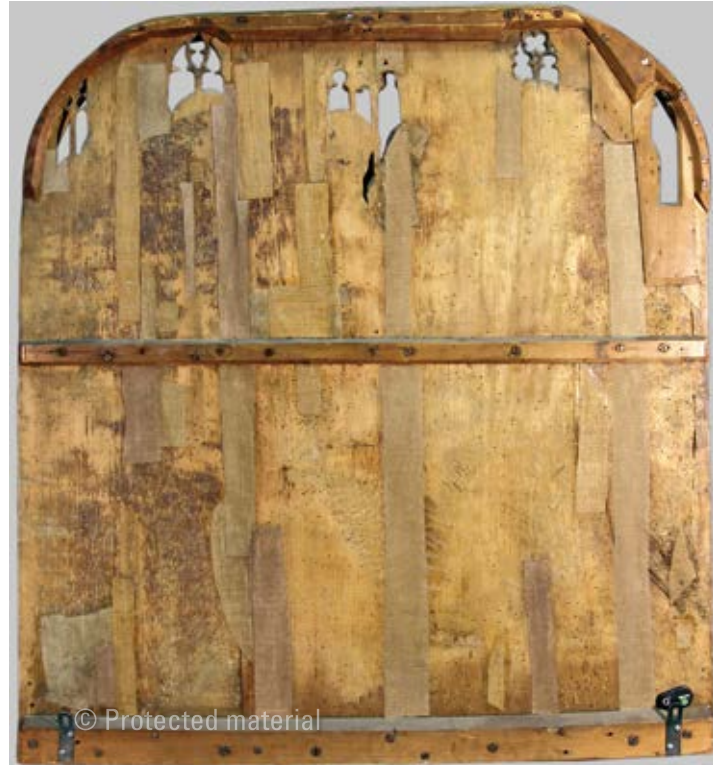
14. Anonymous, German (Eastern Bavaria?) The Dormition of the Virgin , c. 1500 Bilbao Fine Arts Museum Reverse

In the oldest known photograph of the work in the Bilbao Fine Arts Museum, the relief still has a deteriorated polychromy, although this is unlikely to be the original [fig. 16]. The photograph is reproduced in an unpublished album from around 1930, which displayed the collection of Dr. Karl Krüger, of Hanover, then up for sale 27 . From the photograph, the painting would appear subsequently to have been heavily retouched, if not totally renovated, possibly in the 18th century. An X-ray produced at the Museum [fig. 17] 28 shows some remains of the ground that have survived to the present day and which, owing to the lead content, provide a strong contrast on the image. When, in February 1972, the relief came to light again with one of Munich's most famous gallery owners, Julius Böhler, it no longer had the polychrome, looking then much as it does today [fig. 19].