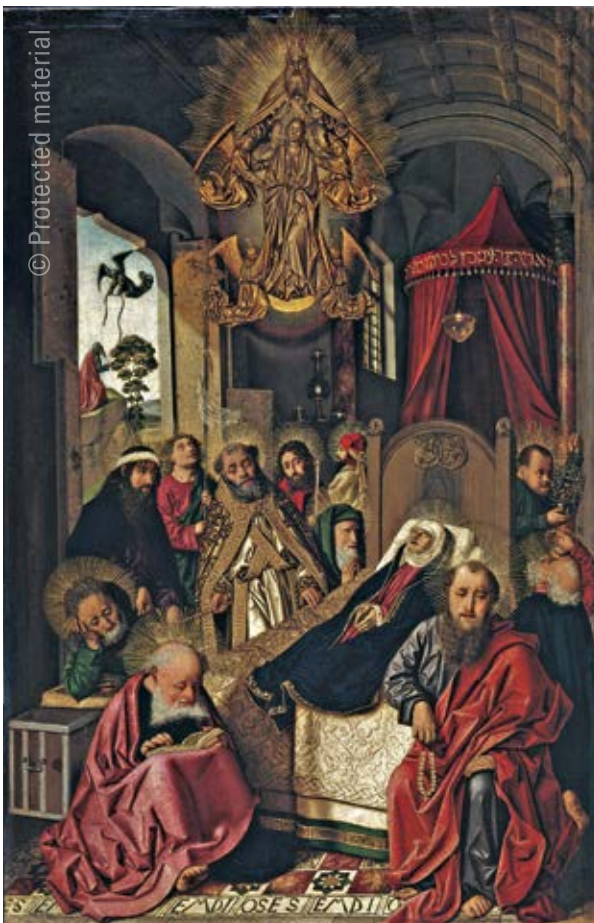
21. Bartolomé Bermejo (active between 1468 and 1501) The Death of the Virgin , c. 1470-1475 Oil on oak wood. 63 x 41 cm Staatliche Museen zu Berlin, Gemäldegalerie, Berlin Kat. 552