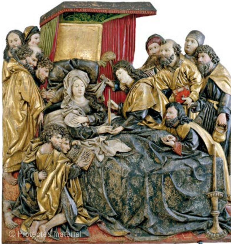
22. Anonymous, Franconia The Death of the Virgin , c. 1500 Wood relief on a composition by Martin Schongauer. 104.5 x 100 x 9 cm Augustinermuseum, Freiburg Inv. no. S 59/2