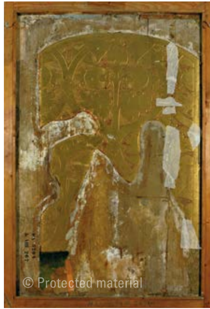
12. Anonymous, German Panels from a retable of the Virgin, c. 1500 Backs bearing traces of lost reliefs apparently showing scenes from the life of Saint Anne, St. Joachim or the childhood of Jesus Tempera on fir-tree panel, 122 x 79 cm (each one) Bayerisches Nationalmuseum, Munich Inv. no. MA3203; MA3204

period that originally belonged to retables, one can see the preparation or the paint applied in the zones not covered by the reliefs, silhouetting their contours, which enables us to guess fairly accurately which themes were depicted there [fig. 12]. Sometimes words written in Gothic characters, which actually name the saint or the story to be fixed in the place reserved for it, are visible. Only in a few isolated cases were reliefs and paintings executed on the same piece of wood, testimony to a particularly close cooperation between the two professions 20 .