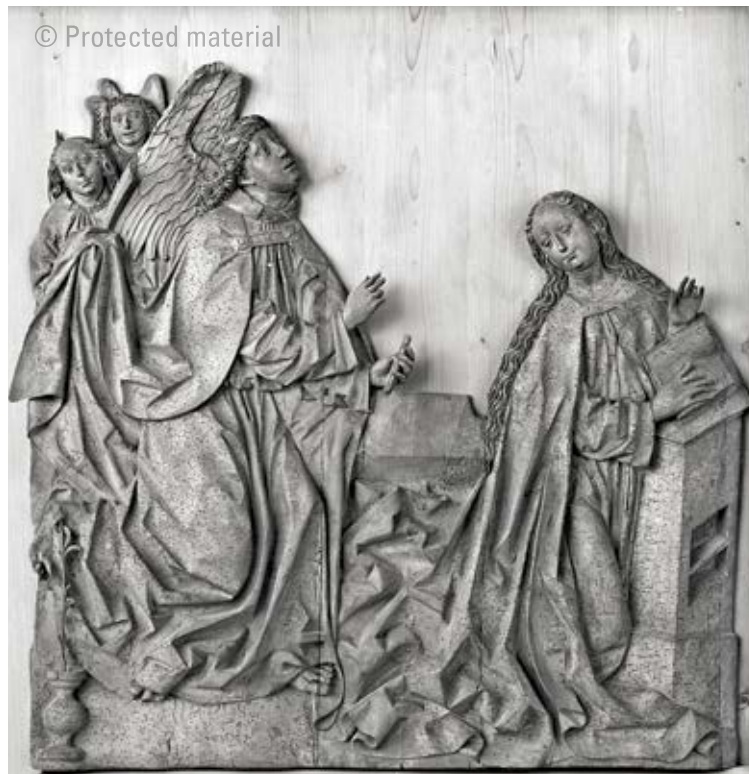
28. Anonymous, Bavaria Annunciation , c. 1500 Lime-wood relief from Landshut, 120 x 121 cm Bayerisches Nationalmuseum, Munich In deposit at the Church of St. Martin, Landshut Inv. no. MA 1244