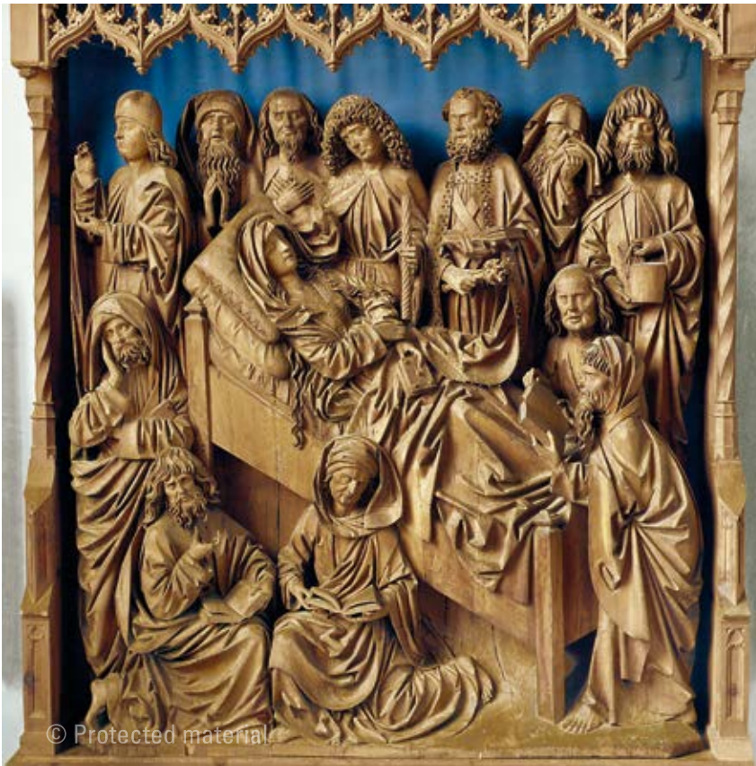
19. Anonymous, Bavaria Retable, church at the Hospital of the Holy Ghost, Ingolstadt, c. 1490-1500 (box from 19th century) Lime-wood relief. 142 x 138 cm Bayerisches Nationalmuseum, Munich Deposited at the Liebfrauenmünster, Ingolstadt