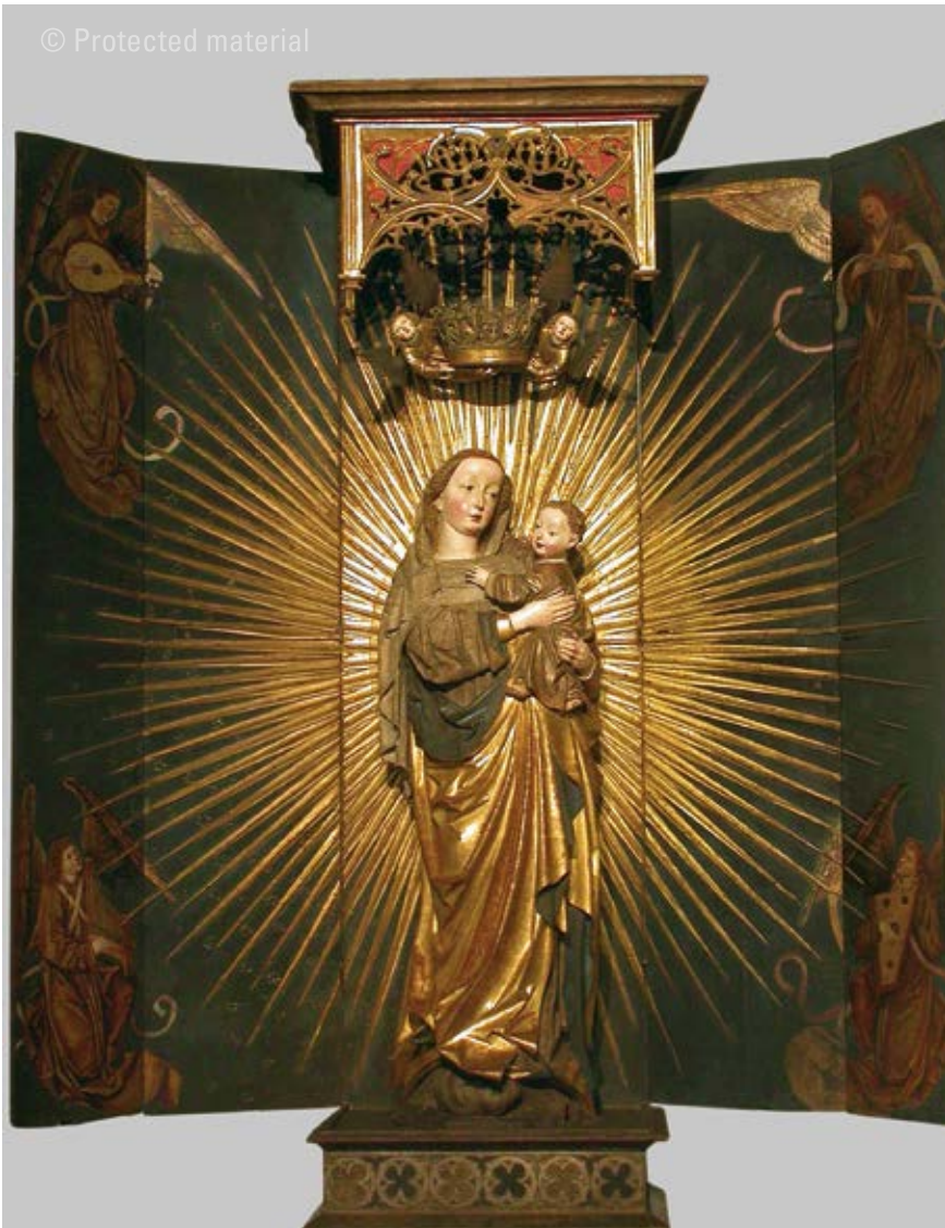
9. Anonymous, central Franconia Retable, Weissenburg, c. 1477. 410 x 315 cm Bayerisches Nationalmuseum, Munich Inv. no. MA 1961

prevent the wood from deforming. Being an organic material, wood continues to dilate in damp surroundings and contract in the dry, which leads to cracks that, generally speaking, move radially outwards from the centre of the trunk. For this reason, the sculptor tried to reduce volume as much as possible. In this respect, Saint Anne, the Virgin and Child is no exception. Indeed, the work owes its admirable state of conservation partly to this procedure [fig. 10].