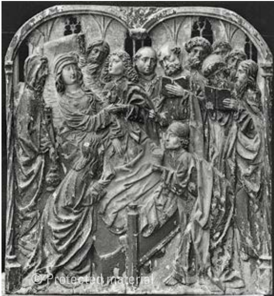
16. Anonymous, German (Eastern Bavaria?) The Dormition of the Virgin , c. 1500 Bilbao Fine Arts Museum Old photograph, c. 1930 Staatliche Museen zu Berlin, Skulpturen Sammlung