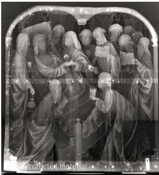
17. Anonymous, German (Eastern Bavaria?) The Dormition of the Virgin , c. 1500 Bilbao Fine Arts Museum X-ray