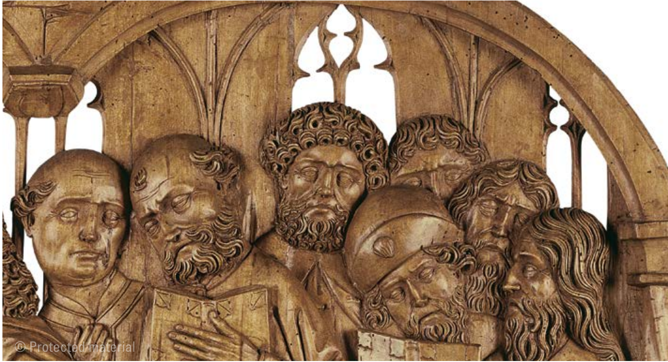
15. Anonymous, German (Eastern Bavaria?) The Dormition of the Virgin , c. 1500 Bilbao Fine Arts Museum Detail