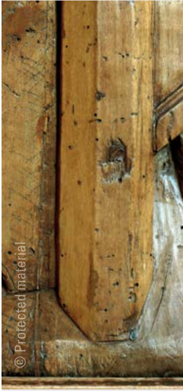
13. Anonymous, German (Eastern Bavaria?) The Dormition of the Virgin , c. 1500 Bilbao Fine Arts Museum Detail, joint between two panels