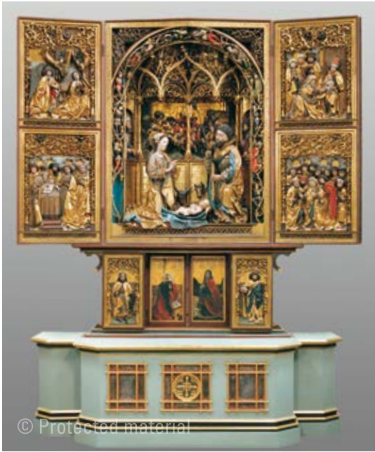
5. Hans Klocker (documented between 1474 and 1498) Bozen retablo, completed in 1500 314 x 353 x 43 cm (original crown lost) Church of the Franciscans, Bozen