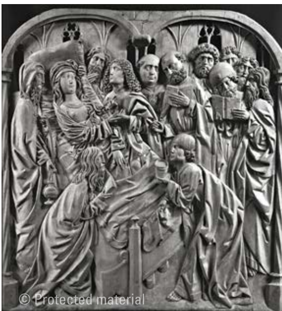
18. Anonymous, German (Eastern Bavaria?) The Dormition of the Virgin , c. 1500 Bilbao Fine Arts Museum Old photograph, c. 1972 Bayerisches Nationalmuseum, Munich