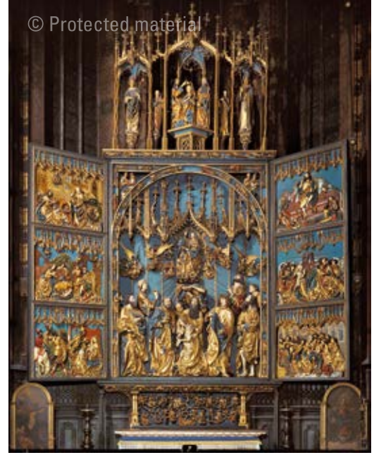
4. Veit Stoss (documented in 1476-1533) High retablo, the Church of the Assumption, 1477-1489 1285 x 1068 cm (open) Krakow

house more than three figures 9 . Other retablos have a narrative scene in the centre, but these are less frequent than the other model [fig. 4]. The saints were normally depicted standing up, although some seated figures have also survived, particularly when images of the Madonna with the Child are involved 10 . Retablo doors often had paintings outside and inside or reliefs inside [figs. 5 and 6] 11 and paintings on the outside [fig. 7]. Artists usually chose standing figures of saints or story scenes for the reliefs. In large retablos, if story scenes were favoured, two superimposed stories normally appeared in more or less square shaped areas, so four scenes in all were visible when the retablo was open [figs. 5 and 6]. The Bilbao relief would seem to come from a retablo of this type. Other retablos are known to have had doors showing just one story, with slimmer proportions [fig. 8] and, exceptionally, others could even depict up to three superimposed scenes [fig. 4] 12 .