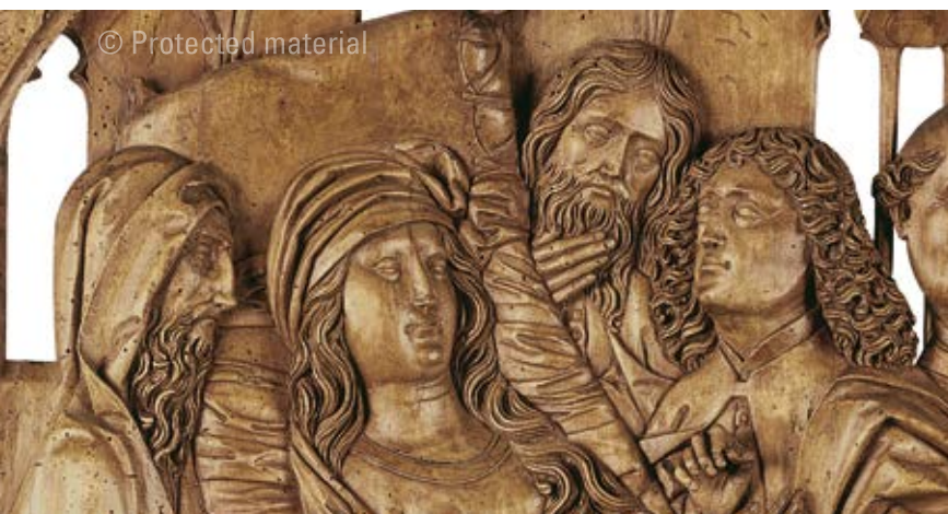
26. Anonymous, German (Eastern Bavaria?) The Dormition of the Virgin , c. 1500 Bilbao Fine Arts Museum Detail