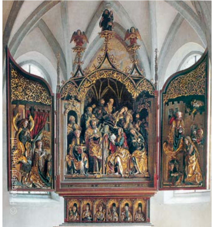
8. Studio of Niklaus Weckmann (documented between 1481 and 1528) Death of the Virgin Retable, Reutti, 1498 (inscription on box) Parish church of St. Margaret, Reutti (Neu-Ulm)

to the places under Byzantine influence in the southeast and east, and where Italian and Mediterranean models prevailed in the south and southwest. Similar models were not unknown in the Low Countries either. However, there and in some neighbouring regions of northwest Germany, the retable shrines that contained sculptures usually showed narrative scenes featuring figures that rarely exceed 60 centimetres in height, while the images in the shrines of retables in the rest of Germany normally measured more than a metre, some even being life-size or larger. In the Saint Anne, the Virgin and Child , in the Bilbao Fine Arts Museum, the figures are as much as 151 centimetres tall.