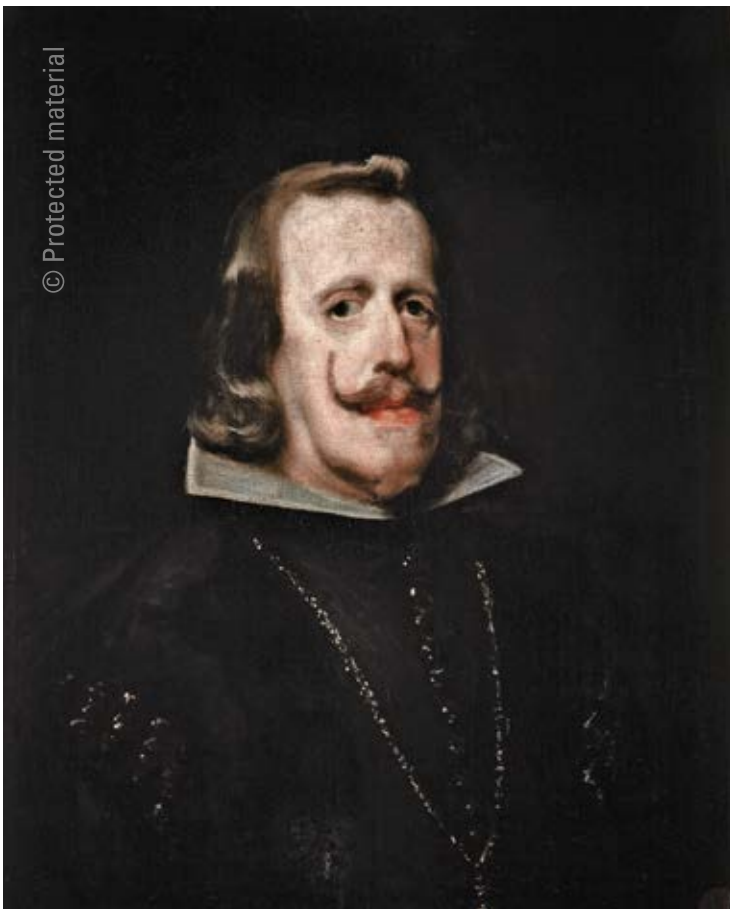
11. Diego Velázquez (1599-1660), workshop of Portrait of Philip IV , c. 1656 Oil on canvas, 66 x 40 cm San Fernando Royal Academy of Fine Arts, Madrid