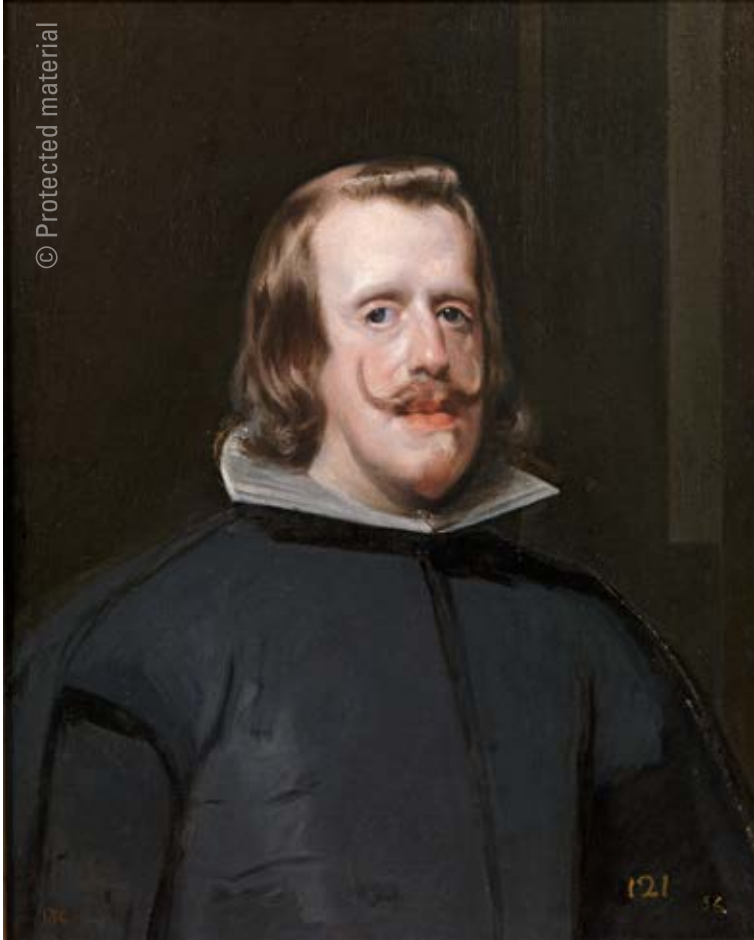
6. Diego Velázquez (1599-1660) Philip IV , c. 1654 Oil on canvas, 69.3 x 56.5 cm Museo Nacional del Prado, Madrid Inv. no. P1185

a starting point to multiply (in the workshop) the images of the monarch 12 . The work has been in the royal collections since its first confirmed mention in 1745 13 .