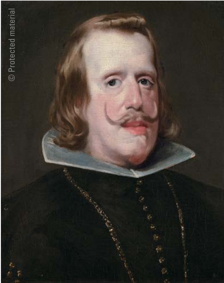
9. Diego Velázquez (1599-1660), workshop of Philip IV , 1654 Oil on canvas, 47 x 37.5 cm Kunsthistorisches Museum Wien, Gemäldegalerie Inv. no. GG 324