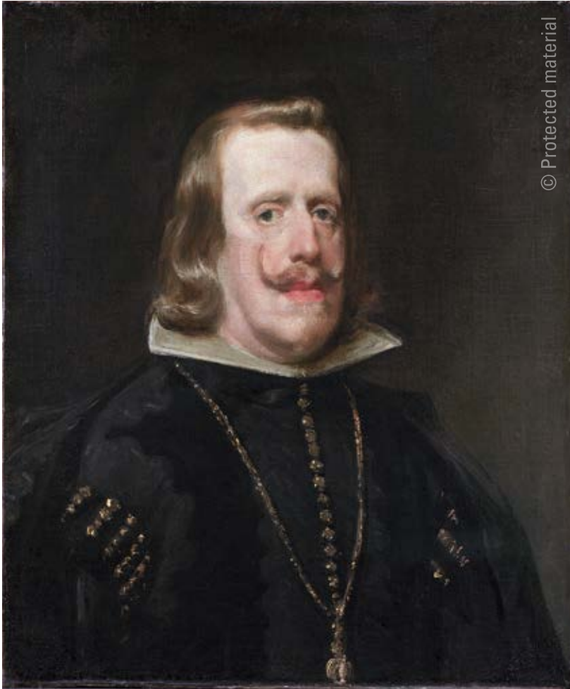
7. Diego Velázquez (1599-1660), attributed to Philip IV , c. 1656 Oil on canvas, 64.1 x 53.7 cm The National Gallery, London Inv. no. NG745