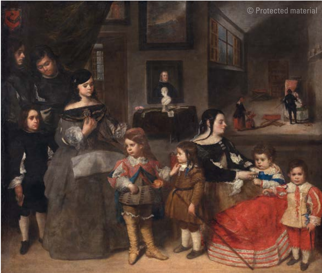
12. Juan Bautista Martínez del Mazo (c. 1611-1667) The Painter's Family , 1664-1665 Oil on canvas, 149.5 x 174.5 cm Kunsthistorisches Museum Wien, Gemäldegalerie Inv. no. GG 320

As I mentioned above, there is very little specific information available about the way Velázquez's workshop operated in the last years of his career or about how the artists went about multiplying portraits. The existence of so many almost identical portraits of Philip IV is proof that they were tightly controlled, but we do not know the channels by which such control was exerted: whether there was a single workshop, productive enough to deal with all the replicas needed, or if work was subcontracted to other workshops. Although the comparison of some portraits with others might help in establishing filiation in some cases, the fact is that the differences in their states of conservation, the impossibility of a direct comparison of these works (unless by the use of images) and the lack of technical analyses make this a difficult task. All cases involve mimetic replications, the only noticeable differences being ones of handling. Comparison, for instance, of the technical material of the Bilbao painting with the one in the Prado Museum shows different methods. These are appreciable, among other things, in their x-ray images, which show different levels of contrast, in turn linked to notable discrepancies in the ground layer: white-greyish in the Madrid painting 22 and reddish in the Bilbao painting. The version in Cincinnati also seems to have been painted on a reddish ground.