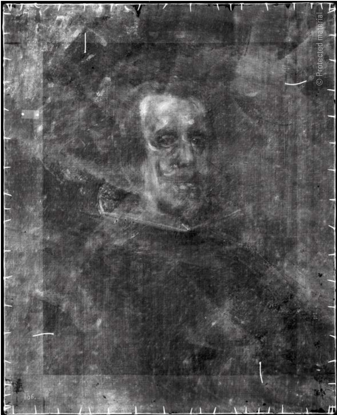
8. Diego Velázquez (1599-1660) Philip IV , c. 1654 Museo Nacional del Prado, Madrid X-ray