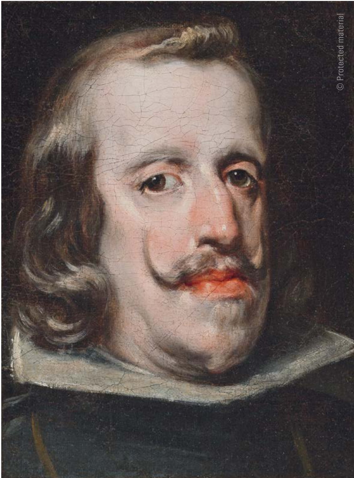
1. Diego Velázquez (1599-1660), circle of Portrait of Philip IV (fragment) , c. 1657 Oil on canvas, 40.5 x 32.5 cm Bilbao Fine Arts Museum Inv. no. 69/237