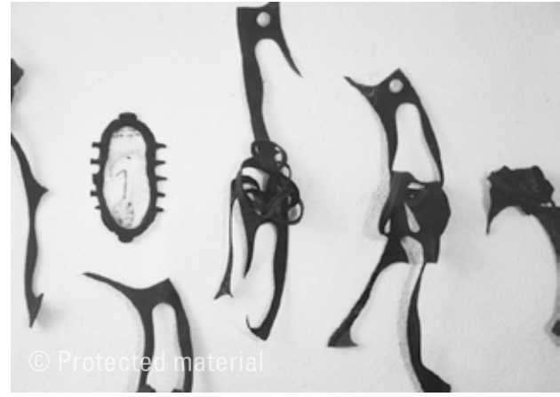
Rubber pieces, assemblages in the Bilbao studio, 1994

jects. The things that built up between the walls, furniture and floor of each of the places where she worked ended up becoming a kind of installation, in a perpetual state of emerging and striving. Even the actual space—the imaginary stage—of each “installation” became an element that Susana explored and worked on, not as a finished “composition” but as an event open to multiple suggestions.