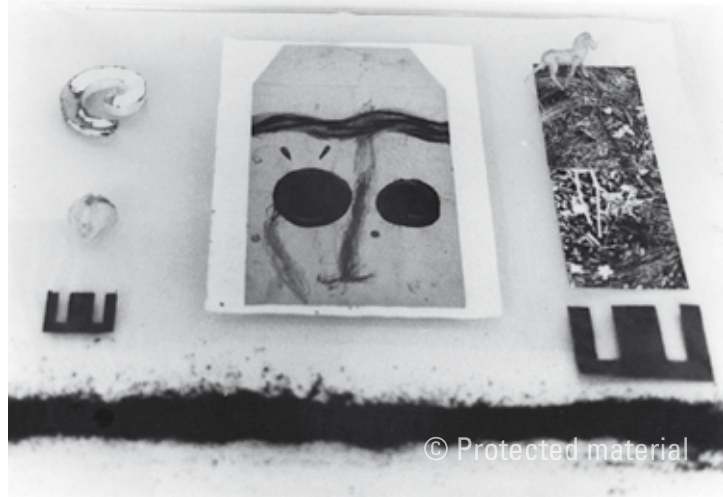
Envelopes series, assemblages in the Rome studio, 1998