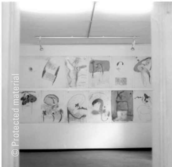
Plant Drawings, installation view, Galerie Kunstfalle, Bern, 1991