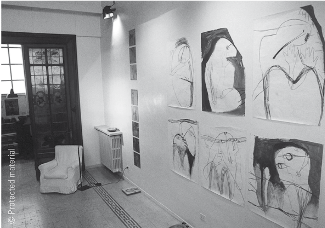
Broken Drawings series (1991), installation view, Studio Morbiducci, Rome, 1993

poetry and irony, alternate and combine in her work, which constantly swings between conflicting perceptions.