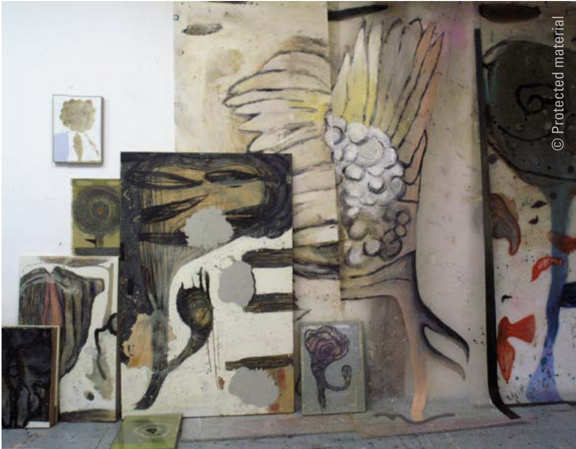
Garden , assemblage in the Bilbao studio, 2015

with a series of previously unexhibited encaustic works on paper created between 2000 and 2009, thus creating a single assemblage consisting—like life itself—of “a multiplicity of individual pieces”. At the same time, given that the “non-objectual” arts— les immatériaux , as the philosopher Jean-François Lyotard called them—make it possible to capture the fleeting nature of images, and even their power, Susana naturally explored the potential of new audiovisual technologies, producing experimental films and videos. In any case, as we saw earlier, she had already shown an interest in film and photography and in the potential of the virtual eye during her Rome period. One of her notable films is the 2010 project Domestic Flights , in which she uses video and photographs to explore a space that she vividly describes as “domestic, but not domesticated”. And here we could add that the spaces that Susana creates have always been essentially “not domesticated”.