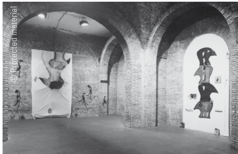
L'oiseau prophète , installation view, Centro per L'Arte Contemporanea Sala 1, Rome, 1996