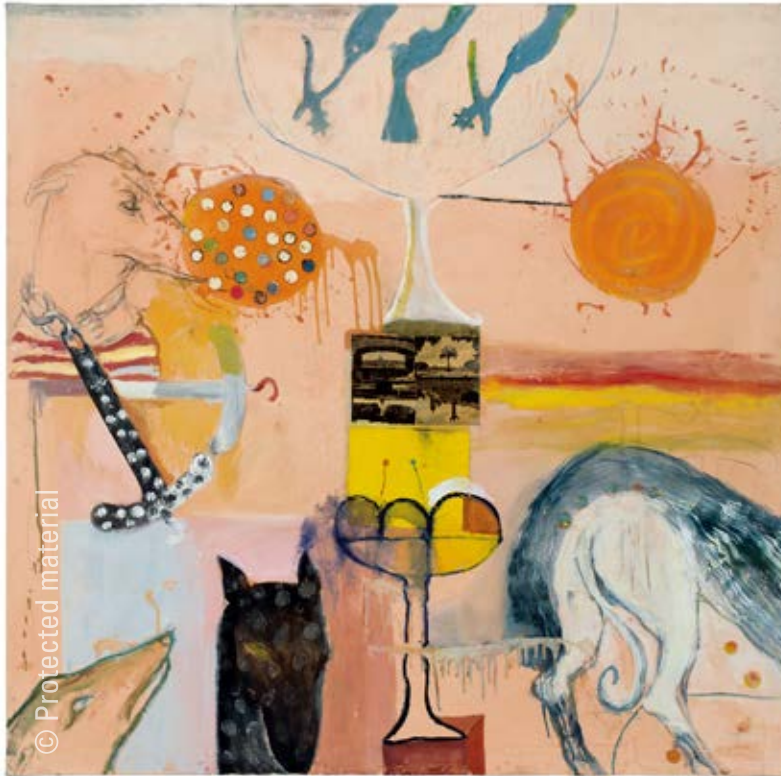
4 cani per strada , 1991 Acrylic, postcards, and metal on canvas. 200 x 200 cm

the meantime. It had changed a lot . And not just in Rome. The effects of the amply studied phenomenon of the emergence of “globalisation”, of virtual reality, of postmodernity and of post-postmodernity... were compounded by the well-known effects that led to the creation of what critic and historian Fredric Jameson called a “dominant art system” in which the boundaries between art, commercial power, and media politics are often unclear.