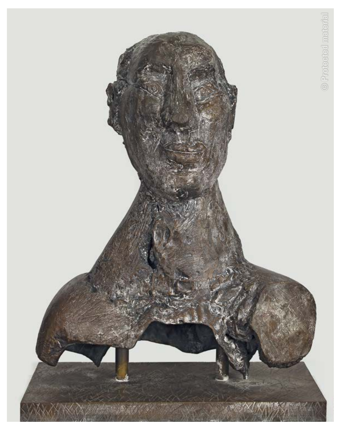
1. Markus Lüpertz (1941) Frauenkopf (Kopf meiner Mutter), 1987 Painted bronze, 97 x 75 x 47.5 cm Bilbao Fine Arts Museum Inv. no. 02/185