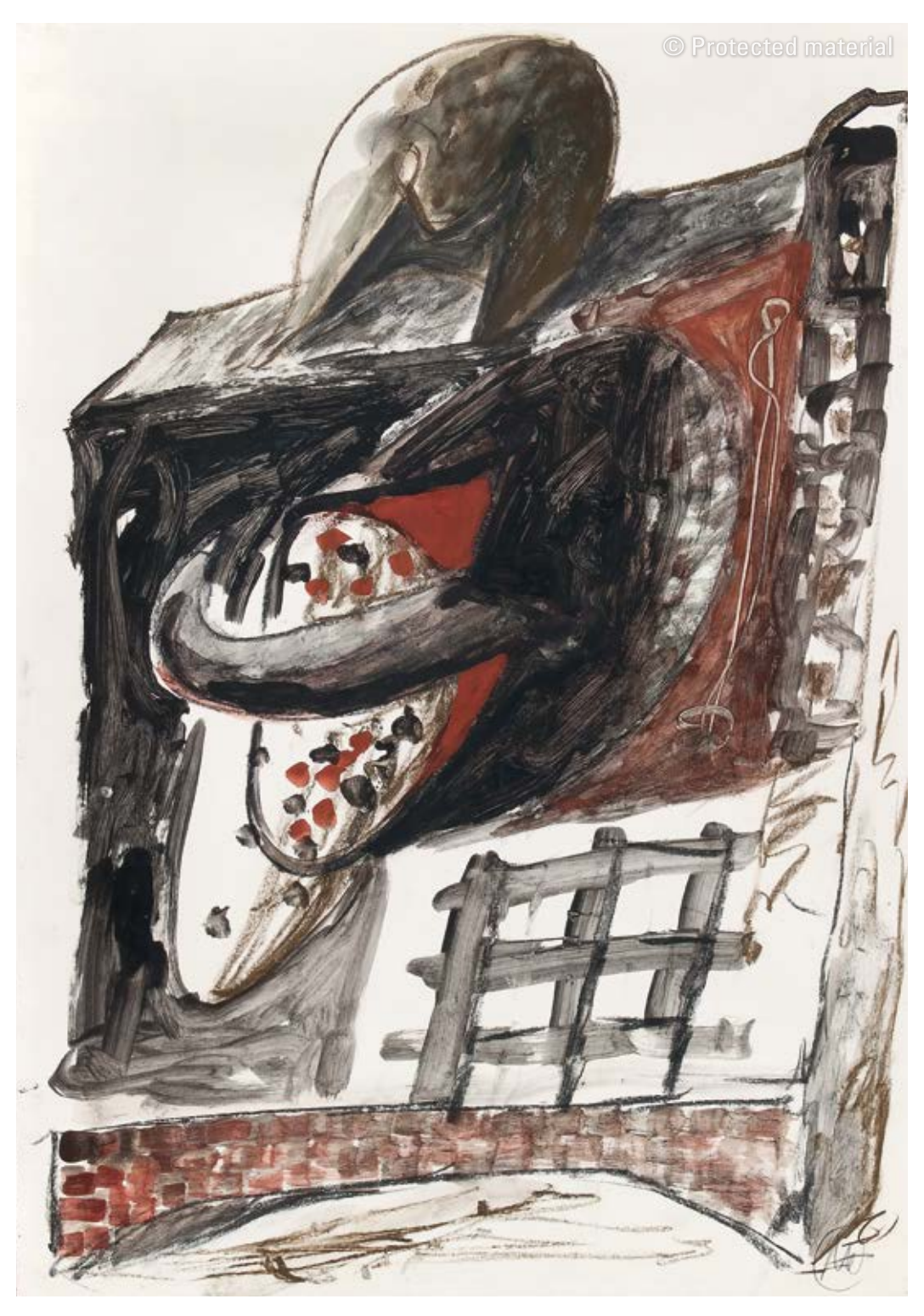
7. Markus Lüpertz (1941) Über Orpheus, 1982 Gouache and Conté pencil on paper, 70 x 49 cm Bilbao Fine Arts Museum Inv. no. 84/10