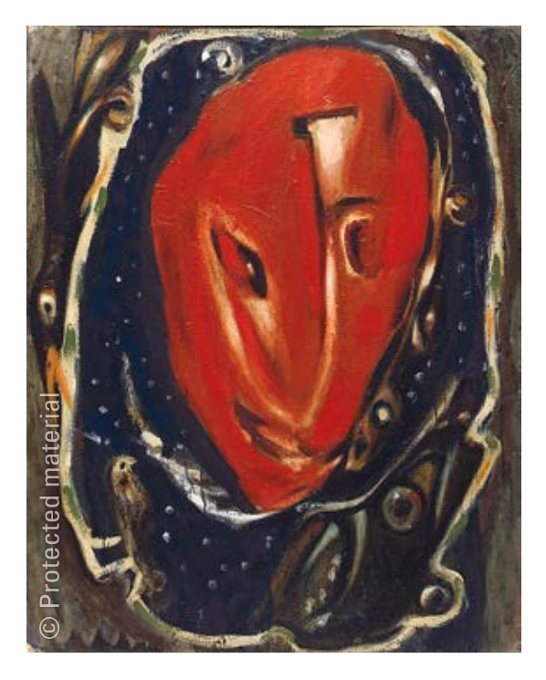
8. Markus Lüpertz (1941) Selbstportrait "Ich als Dichter", 1983 Oil on canvas, 100 x 81 cm ML 499/00