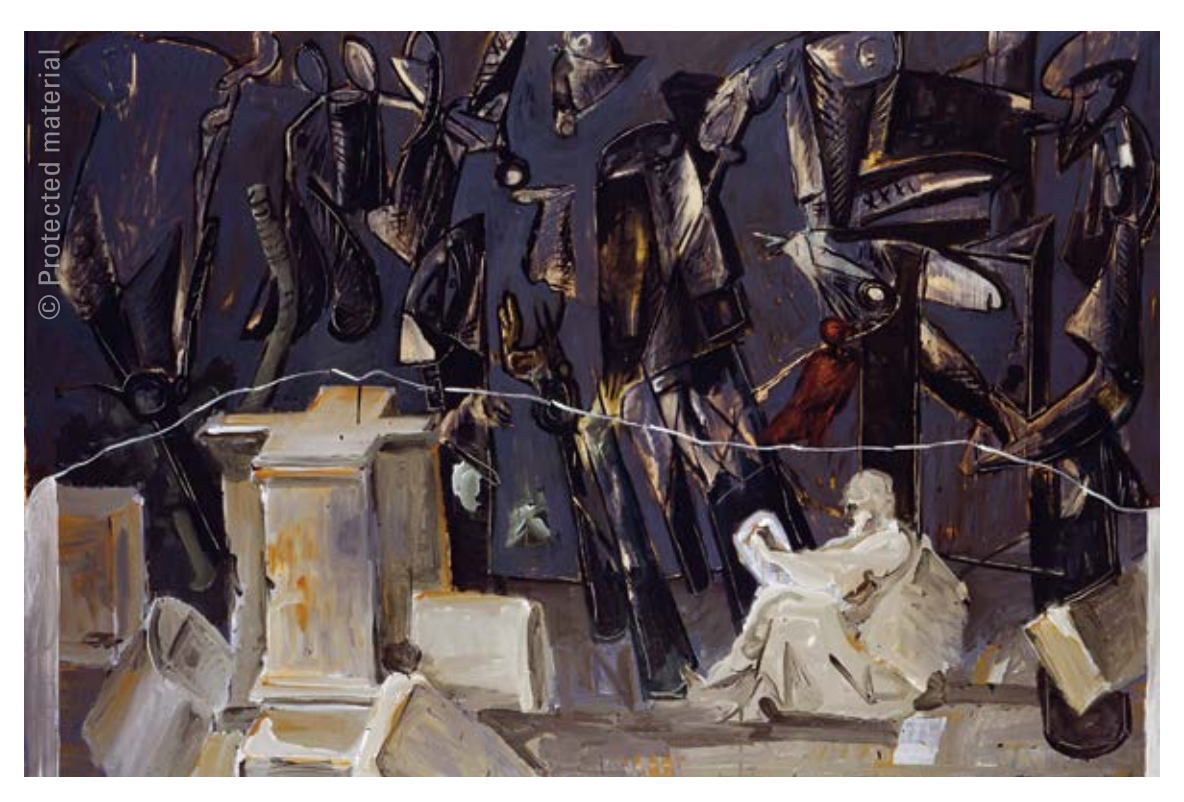
12. Markus Lüpertz (1941) Poussin - Philosoph, 1990 Oil on canvas, 200 x 300 cm ML 907/00

the first phase, "Bildern nach Poussin" (Paintings based on Poussin), Lüpertz and Poussin seem to exalt the sculptural form of the figures, this being the link between the two. While Lüpertz puts the expressive force of the figure to the test, he also makes it his own, taking them to the heights of allegory, something Poussin did through mythology. In his interpretation of Poussin, Lüpertz discovers a pictorial freedom bound up with the mythological, a freedom that demolishes the concept traditionally associated with the French painter of aesthetically interpreting his painting as cold, remote classicism. Here we are not confronted with some nostalgic wish to reconsider the forms of Modernism three hundred years before the fact; nor does it have to do with Modernist dogmas on abstraction typical of the 1960s. Lüpertz' interpretation is associated with the sense of philosophical investigation to be found in Poussin's paintings, and this became a contemporary theme for him and a reference point he marked out for himself. In this case we may plausibly say that Lüpertz was moved by a desire to reconcile abstract with figurative, while imbuing with an allegorical character the search for and renewal of history painting, at a time (the 1960s) when abstract painting was the predominant form.