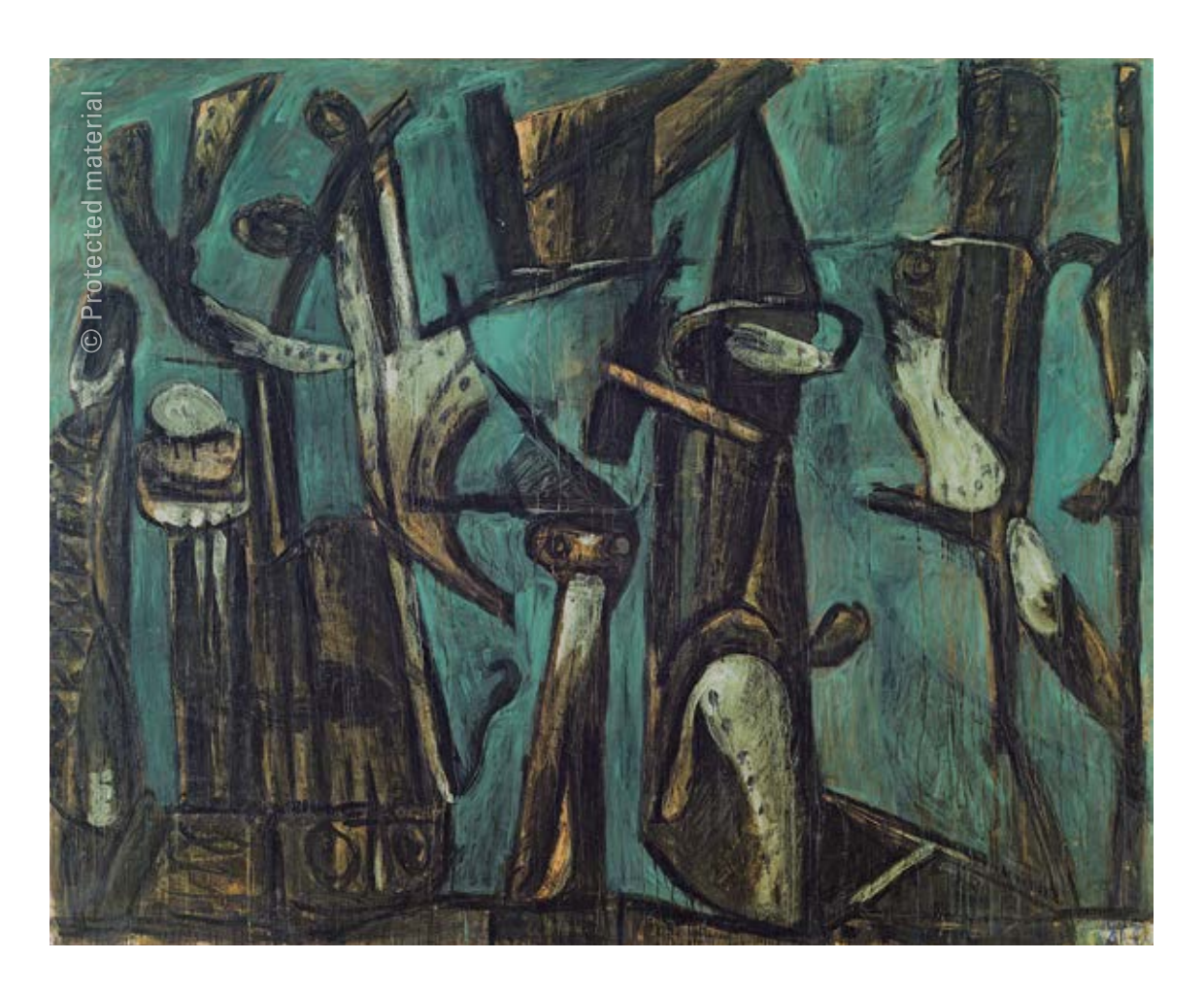
10. Markus Lüpertz (1941) Rüstzeug des Architekten, 1988 Oil on canvas, 162.3 x 200.5 cm Bilbao Fine Arts Museum Inv. no. 09/6

Lüpertz' pictorial work combines a number of basic visual takes that interweave myth, cultural construction and historical concept, which in the resulting mystery and alchemy head towards a new reality. This is true of the drawing under consideration here and of the oil painting Rüstzeug des Architekten , also in the Bilbao Fine Arts Museum [fig. 10]. Both works transcend description to penetrate to the core of the object the artist displays in his art. They reveal a reality that encloses and condenses an essence, thus converting something intangible, something that cannot be captured solely by the senses, into an image. In these examples, the artist attempts to unveil a reality that is there and which holds magic. Carl Gustav Jung, a great connoisseur of the art history of many and varied cultures, observed the similarity between the circular, recurring patterns in Oriental religions, known as mandalas. In interviews, Lüpertz has described his way of painting as a meditation on the objects and the trees surrounding his studio.