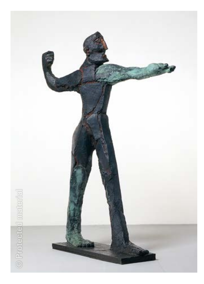
3. Markus Lüpertz (1941) Titan , 1986 Painted bronze, 253 x 59 x 196 cm MLP 28/4

to another sensibility. Landscapes in Lüpertz—like his Mozart—are not simple memories; they have an evocative touch that takes them into a more profound sensibility, no less pictorial for being less analytical. Phantoms, images produced by fantasy, are not improvised out of nothing: they have their origins in representations or are equivalent to those same representations. The pictorial eye is not the instrument of other knowledge, the image is not the illustration of a prior thought; in his work, Lüpertz's eye transforms what he has seen and makes evident other registers and other intentions, when his vision becomes gesture, when like Cézanne he thinks in paint , when his enigmas are converted, are translated, are shaped into phantoms.