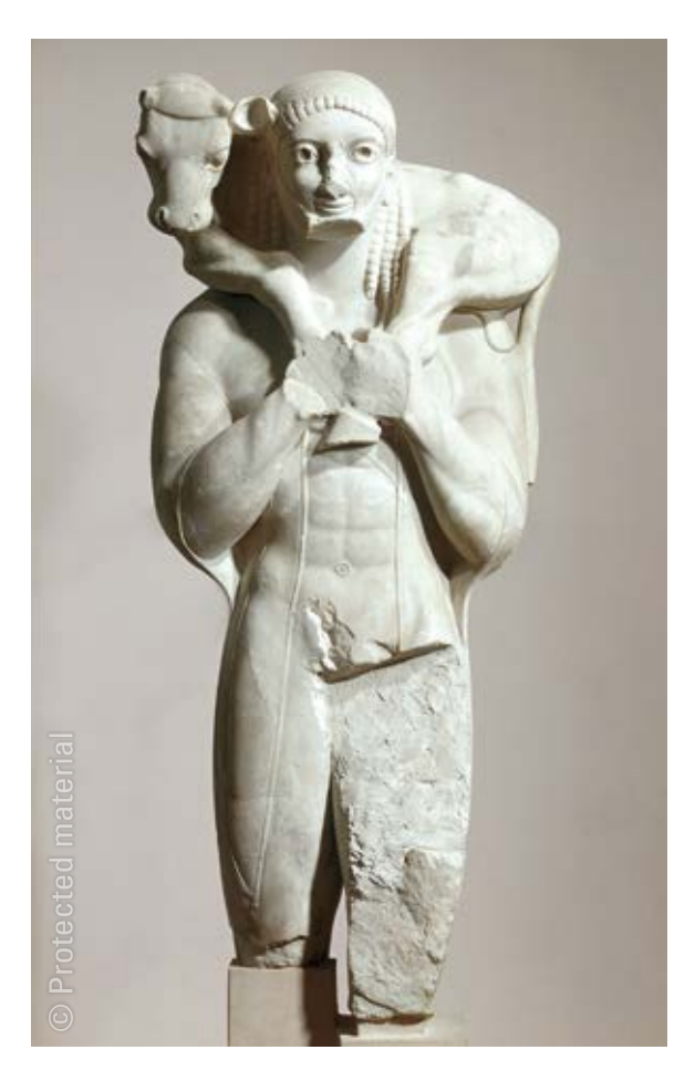
6. Moscophoros , 570 BC Marble with stone incrustations, 165 cm (height) Acropolis Museum, Athens

mortals. Lüpertz ladles the portrait with irony. Instead of an eagle, this "particular" Ganymede, tranquil, in repose, holds a dead chicken in his right hand. The shepherd ( Hirte ), symbol of the guide of souls and bearer of peace, has been pretext and model on many occasions for the visual arts, particularly sculpture: Picasso's Man with Lamb (1943) is a case in point. Curiously, Lüpertz's figure is imbued with an archaism absent from the Picasso sculpture; it is evident in the posture of the torso and legs, which evokes the man with a lamb in the Acropolis [fig. 6].