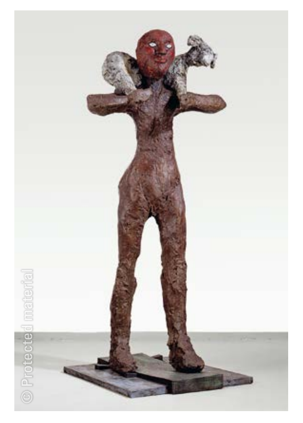
5. Markus Lüpertz (1941) Hirte , 1986 Painted bronze, 230 x 95 x 65 cm MLP 29/6

The tendency towards the grotesque, towards the shout or laugh is not a tendency towards caricature. It is a tendency towards nakedness. Bacon's formal reflections, like Giacometti's or music's, is a visual consideration on the disfigured figure, converted not only in an expressive shadow, framed in the paintings the way death notices in the newspaper are framed, or resting on their own pedestal bases, but also fundamentally converted in erosion. With this nakedness, this erosion, Lüpertz, like Bacon before him, breaks the limits of portrayal, as if the figure dissolves in its own painterly apparition.