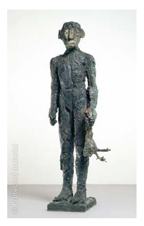
4. Markus Lüpertz (1941) Ganymed, 1985 Painted bronze, 230 x 80 x 80 cm MLP 26/1