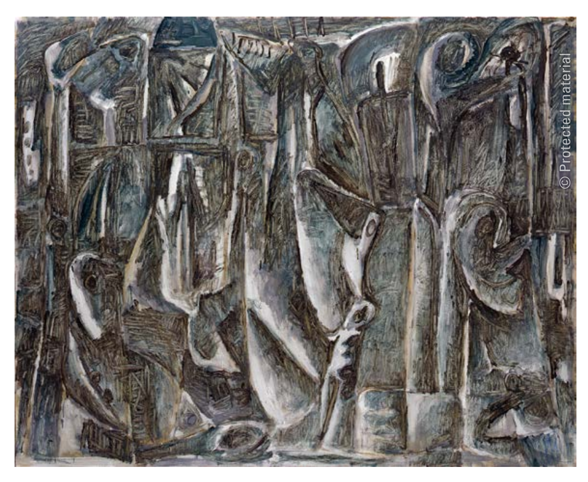
11. Markus Lüpertz (1941) Blauer Garten: Distelreich, 1988 Oil on canvas, 200 x 250 cm ML 831/00

What we are dealing with here is a sensorial rather than an intellectual fantasy, one that seeks modes instead of forms. Markus Lüpertz fabricates combinations of clues that constantly pay homage to art history. In 1988 he was named principal of the Fine Arts Academy of Düsseldorf, a post he held until he retired in 2010, where he tried to change the conceptual spirit of Joseph Beuys.