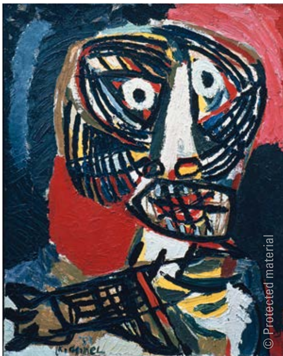
20. Karel Appel (1921-2006) L'homme au masque de fer , 1953 Oil on canvas, 142 x 110 cm Private collection, Germany