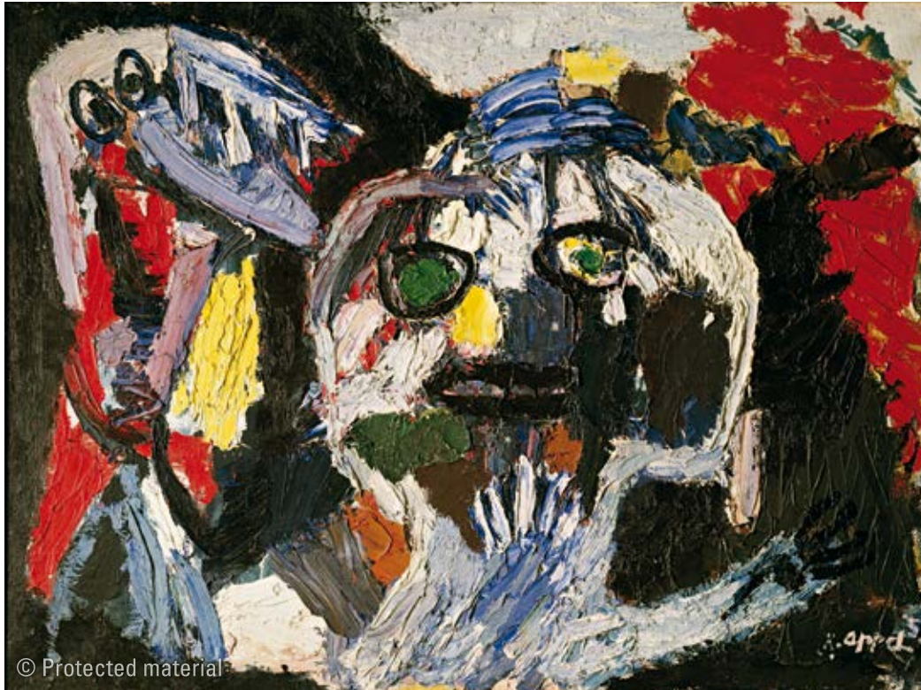
19. Karel Appel (1921-2006) Femme et oiseau , 1953 Oil on canvas, 97 x 130 cm Centre Pompidou, Paris. Musée national d'art moderne, Centre de création industrielle Inv. no. AM 1981-90

Another unforgettable picture, Ubu roi (1953) [fig. 18], a complement of the previous ones, features a different kind of iconic mode, a declaration of principles almost: a solemn figure is a doll and a doll is a solemn figure, pretty much in line with what Jarry wanted for his hero : head up, legs firm, like some of the buffoons portrayed by Velázquez, an impressive trunk, where the figure's verticality rivals its monumental motionlessness, in sharp contrast to the dynamism of the actual painting. Ubu was to have its tragic continuation in Nu barbare (1957) [fig. 2], a female figure with sexual features on view and a face practically gone, but which retains the same kind of savage, grotesque solemnity found in its predecessor.