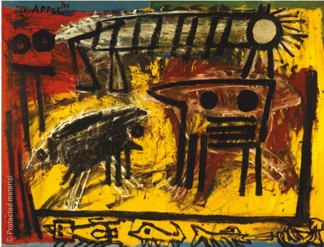
11. Karel Appel (1921-2006) Les animaux , 1948 Oil on canvas, 96 x 126 cm Karel Appel Estate Foundation

This is not the only characteristic worth mentioning at this point. The drawing also merits attention: the lines of the figures do not "enclose" the chromatic forms or blurs, so they don't have to adapt to any particular precision of the motifs. They can spill over, break out, and they may also "shrink". Line and colour in Appel's painting behave at this time just as line and colour do in children's drawings: they don't coincide, they boil over, they don't quite reach, they don't fit (...), and this is what, in part, their beauty, and the beauty of the artist's paintings, is founded on.