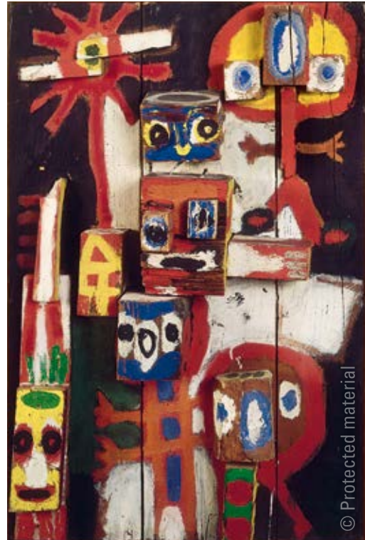
6. Karel Appel (1921-2006) Les enfants interrogeants , 1948 Oil on panel, 85 x 56 cm Centre Pompidou, Paris. Musée national d'art moderne, Centre de création industrielle Inv. no. 1985-128