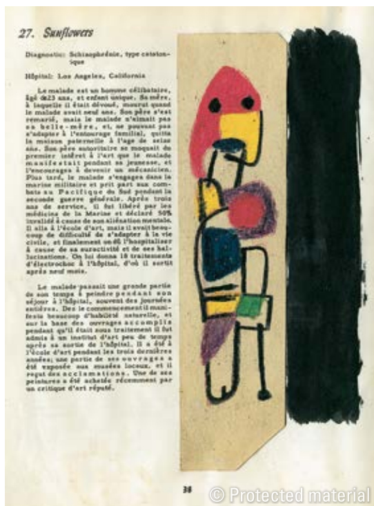
12. Karel Appel (1921-2006) Art psychopathologique. Carnet 1948-1950 (page 38) Karel Appel Estate Foundation