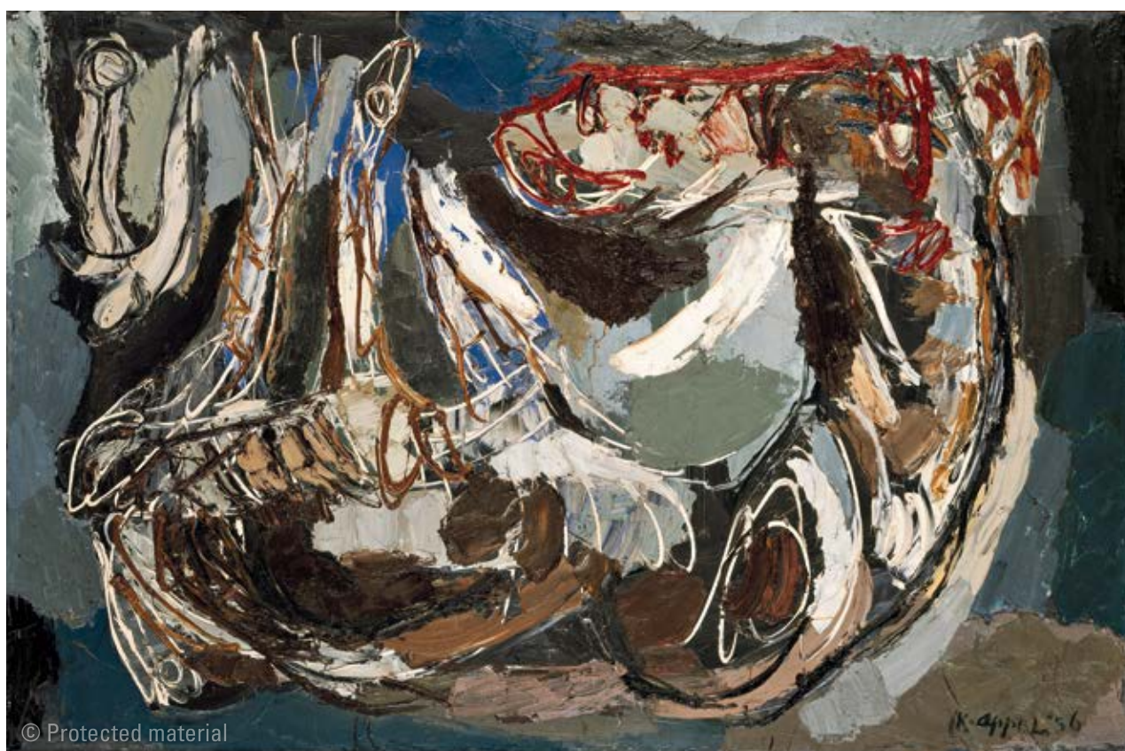
1. Karel Appel (1921-2006) Le cheval mourant , 1956 Oil on canvas, 130 x 195 cm Bilbao Fine Arts Museum Inv. no. 07/7