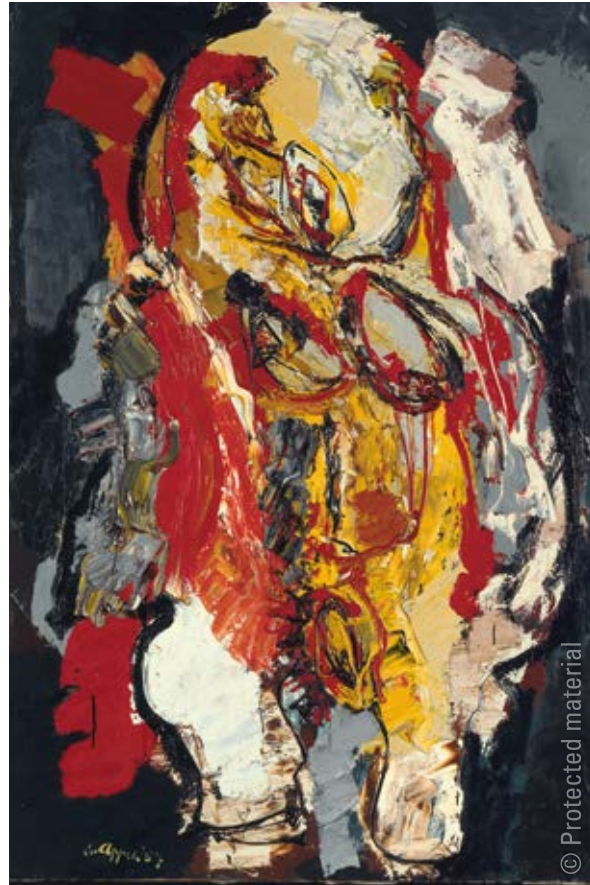
2. Karel Appel (1921-2006) Nu barbare , 1957 Oil on canvas, 195 x 130 cm Stedelijk Museum voor Actuele Kunst, Gent, Belgium

adds that Appel "is a classical painter who lives much less in the 'madding' crowd and far more in the quiet of his studios" 5 .