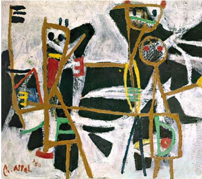
4. Karel Appel (1921-2006) Personnages , 1950 Oil on canvas, 65 x 80 cm Private collection, Holland

looks at his family in Kafka's Metamorphosis and with the kind of looks seen, years later, on the faces of so many of Francis Bacon's human/beast characters). A deranged, inhuman viewpoint, if you like, but one that, as such, affects everything seen/represented/painted. Indeed, in some later works it is difficult to say whether the characters shown are humans or animals: see, for instance, Personnages (1950) [fig. 4].