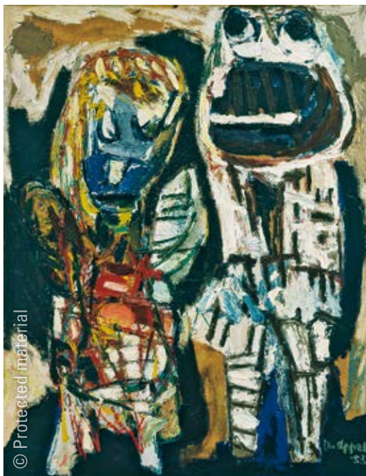
16. Karel Appel (1921-2006) Hommage à Rosenberg, 1953 Oil on canvas, 142.5 x 110 cm Stedelijk Van Abbemuseum, Eindhoven, Holland