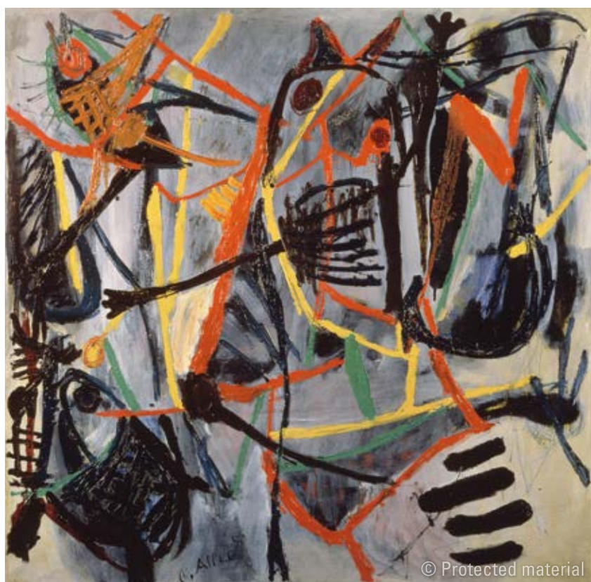
9. Karel Appel (1921-2006) Volons ensemble , 1950 Oil on canvas, 100 x 100 cm Karel Appel Estate Foundation