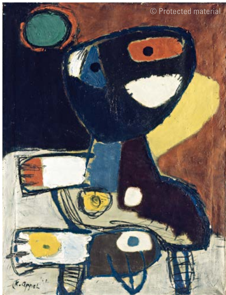
15. Karel Appel (1921-2006) L'enfant à la balle verte , 1951 Oil on canvas, 80 x 60 cm Private collection, Germany