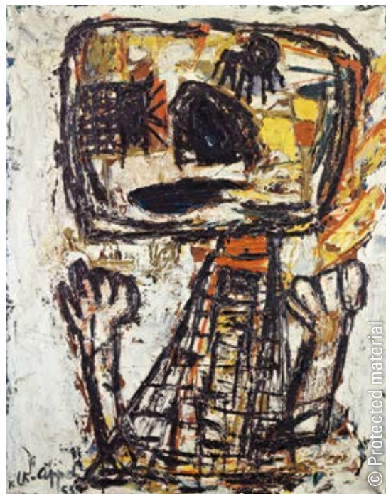
17. Karel Appel (1921-2006) Jeune fille en pleurs, 1953 Oil on canvas, 116 x 89 cm Stedelijk Museum Schiedam, Holland On loan from a private collection