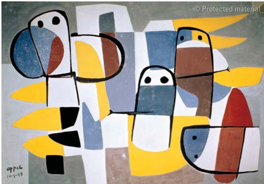
7. Karel Appel (1921-2006) Les enfants interrogeants , 1949 Mural for Amsterdam City Council Now in the restaurant of the Sofitel Amsterdam The Grand Hotel