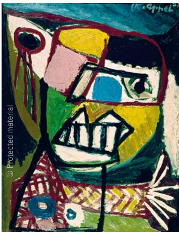
22. Karel Appel (1921-2006) Tête , 1953 Oil on canvas, 96.5 x 72.5 cm Martha Jackson Gallery, New York