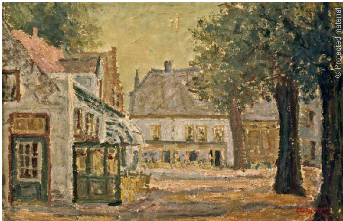
3. Karel Appel (1921-2006) Vue sur la Ville de Oorschot , 1942 Oil on canvas, 50 x 70 cm Karel Appel Estate Foundation

people 7 , adding that it wasn't "folk" popular, but more the kind of popular found in an industrial, incipiently consumerist society, with high waste levels, like the Amsterdam of his youth, a popularity from which neither violence nor a certain degree of chaos are exempt.