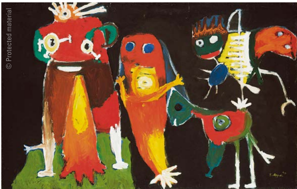
8. Karel Appel (1921-2006) Hip, Hip, Hourra! , 1949 Oil on canvas, 81.7 x 127 cm Tate, London Inv. no. T05077