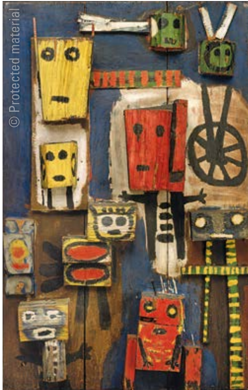
5. Karel Appel (1921-2006) Enfants interrogeants , 1948 Oil on panel, 105 x 67 x 17.5 cm Stedelijk Museum, Amsterdam Inv. no. BA 481