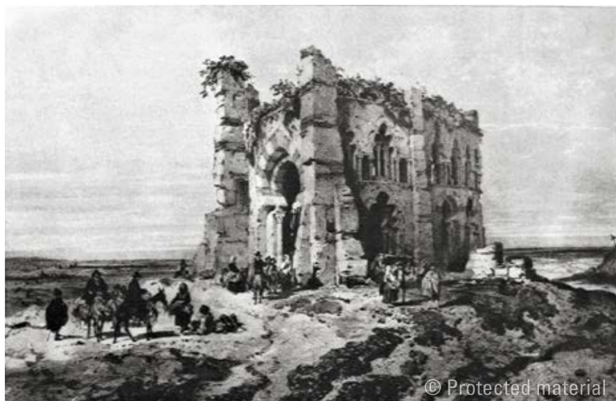
15. Jenaro Pérez Villaamil (1807-1854) Remains of Mudejar Building , 1840 Watercolour on paper, 20 x 26 cm The Old Xavier de Salas Collection, Madrid