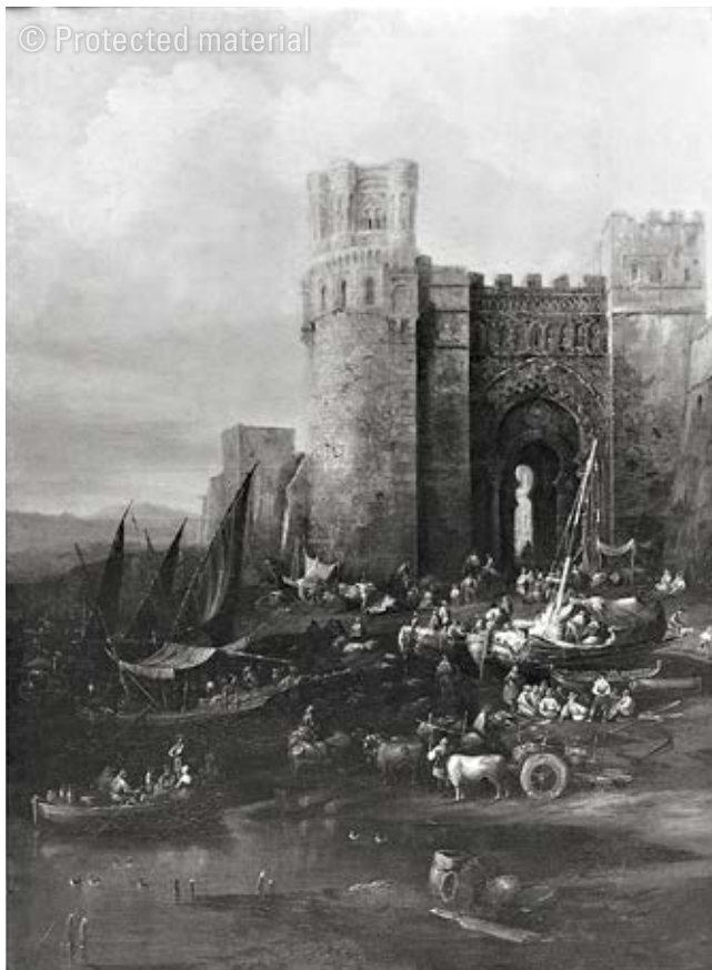
7. Jenaro Pérez Villaamil (1807-1854) Interesting Fragment of Arab Fortification , c. 1837-1838 Oil on canvas, 146 x 110 cm Museo Nacional de Bellas Artes, Buenos Aires