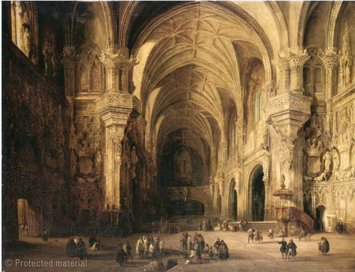
22. Jenaro Pérez Villaamil (1807-1854) Interior of San Juan de los Reyes of Toledo , 1839 Oil on canvas, 89 x 114.2 cm Old Lady Manners Collection, United Kingdom

It is fair to consider the paintings on Toledo-related themes he produced and sold between 1840 and 1844 as a sort of epilogue to his early Romantic period and those early contacts with themes concerning the city he worked on at that time. And it is wholly appropriate to judge the General View of Toledo from the Cross of the Canons in the Bilbao Fine Arts Museum discussed here as a paradigm of that style and period.