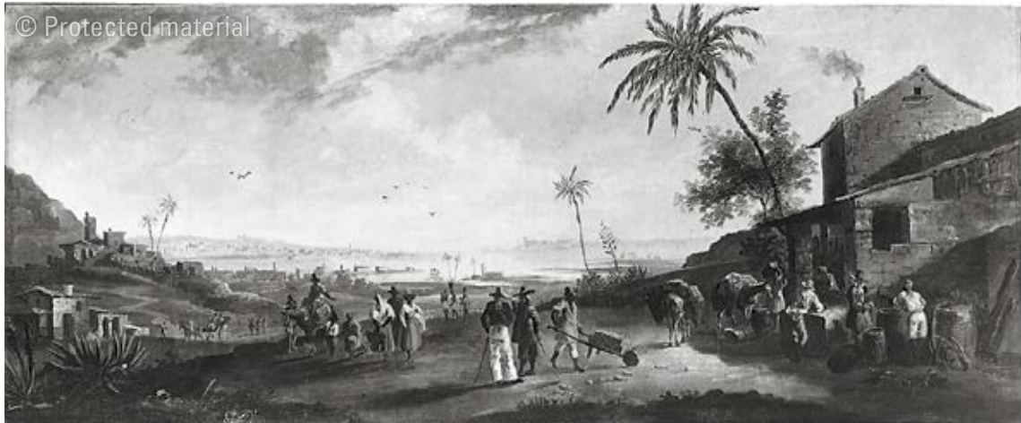
5. Jenaro Pérez Villaamil (1807-1854) View of the Bay at San Juan de Puerto Rico , c. 1830-1833 Oil on canvas, 80 x 170 cm Private collection, Bilbao