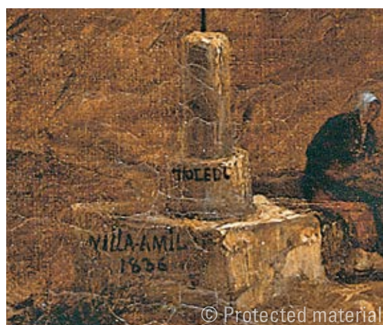
2. Jenaro Pérez Villaamil (1807-1854) General View of Toledo from the Cross of the Canons , 1836 Bilbao Fine Arts Museum Detail