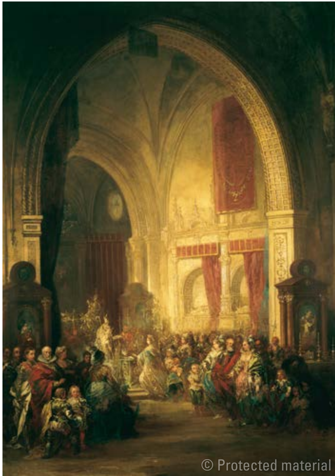
16. Jenaro Pérez Villaamil (1807-1854) Ceremony in Reyes Nuevos Chapel, Toledo Cathedral Oil on canvas, 162.5 x 110 cm Museo Nacional del Prado, Madrid