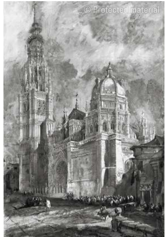
10. Jenaro Pérez Villaamil (1807-1854) View of the Main Façade of Toledo Cathedral Preliminary drawing for fig. 9 Pencil and wash on paper, 68 x 50 cm The Old Varela Collection, Madrid