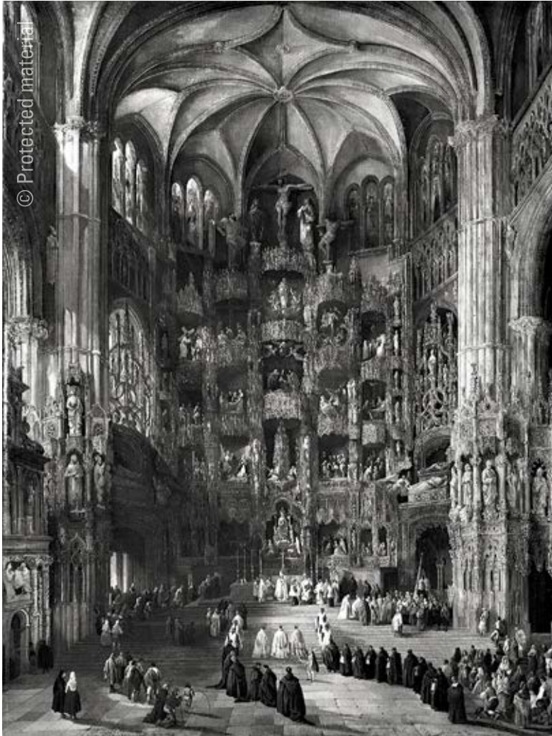
17. Jenaro Pérez Villaamil (1807-1854) Procession, Toledo Cathedral , 1840-1844 Oil on canvas, 148 x 130 cm (approximately) Private collection, Madrid

To conclude, we also know that between 11 February and 17 March 1843 he painted another Interior of San Juan de los Reyes, in Toledo in Louvain, where he lived while in Belgium. He mentions this painting repeatedly in his Diary entries for the month or so he was working on it, basically for the problems he had with it 54 . When it was finished, he sent it to that year's Le Hague exhibition, where it was bought by the "Old King" —William I of Holland, who had abdicated in 1840 in favour of his son William II— for 600 florins 55 . It is hardly surprising that Villaamil should paint a Toledo picture in Belgium, as he must have had with him the 1839 and 1840 sketches and drawings of the city's monuments, and possibly earlier ones too. According to entries in his Diary 56 he painted many more works on Spanish themes while he was abroad to satisfy demand from a European clientele that now saw Spain as a highly picturesque country, with Toledo, Granada and Seville being a central part of that vision.