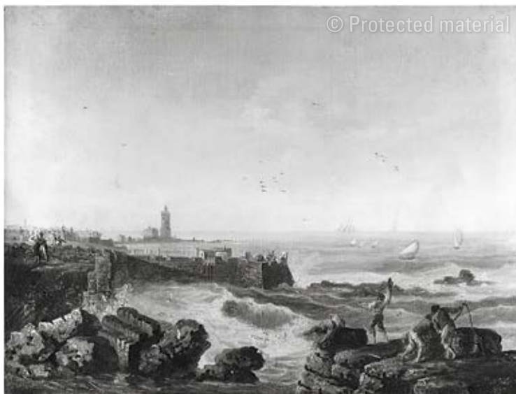
4. Jenaro Pérez Villaamil (1807-1854) View of Cadiz , 1829 Oil on canvas, 44 x 57 cm Saldaña Suances Collection, Barcelona

Our starting point must inevitably be the painting's appearance on the Madrid market in 1978. This event revealed a good deal about its past, clearly a vital factor in contextualizing the work within the painter's early Romantic period.