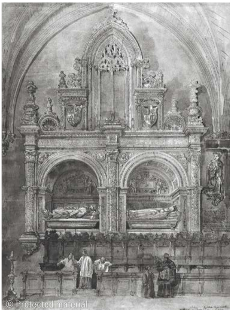
14. Jenaro Pérez Villaamil (1807-1854) Reyes Nuevos Chapel, Toledo Cathedral , 1840 Watercolour on paper, 62 x 46 cm Private collection