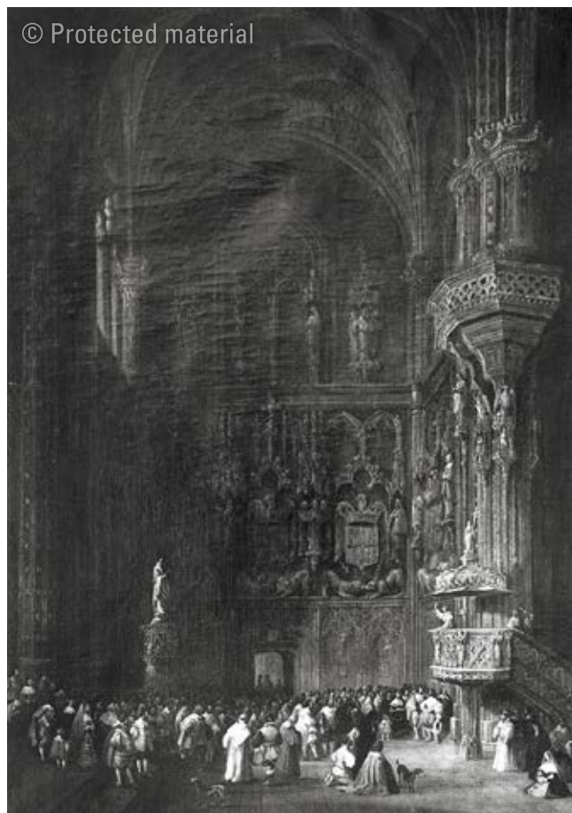
8. Jenaro Pérez Villaamil (1807-1854) Sermon inside San Juan de los Reyes, Toledo , 1838 Oil on canvas, 101 x 71 cm Private collection, Madrid